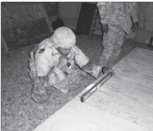
A Soldier ensures that the building floor is level.

W ith increasing violence in Baghdad, traffic flow needed to be regulated between the various areas of the city. Members of Headquarters and Support Company, Bravo Company, and Charlie Company, of the