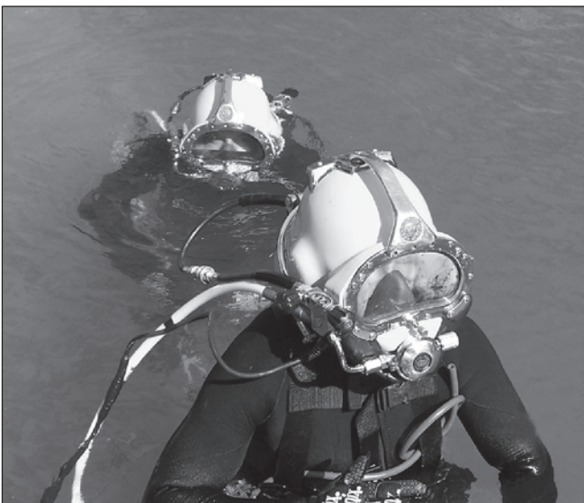
Divers prepare to perform in-water checks before leaving the surface.

water flow creates a large amount of natural erosion as rock and soil are loosened and fall to the bottom. Along with the natural erosion, a former Santa Rosa city administrator ordered rock and debris dropped in the Blue Hole to close off the opening to the cavern system located at the bottom. This decision was partly to discourage divers from attempting to navigate the caverns, because many would run out of air or become lost and disoriented and were unable to find their way back.