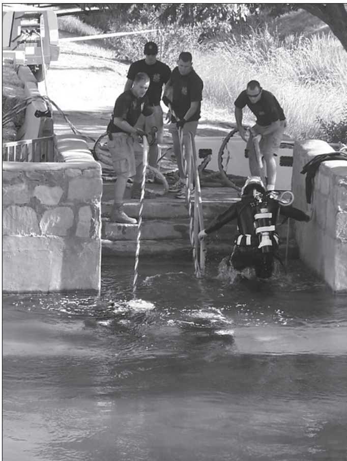
Tenders, who provide surface support, pull the divers from the water.

water column with intake hoses extending all the way to the silt bottom. Divers would call for “switch on,” and the pump would suck a silt and water mixture at a rate of 800 gallons per minute. The third technique was a basic airlift consisting of an 8-inch hose that pumped out small gravel and rock. Air was supplied to the hose at a pressure of 110 pounds per square inch, resulting in a flow of more than 1,000 gallons per minute.