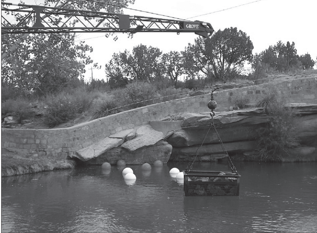
A crane lifts a basket of rock and debris from the bottom of the Blue Hole.

airlift system. The manual labor technique involved the strongest divers picking up the larger rocks and placing them into a basket. The second technique consisted of a hydraulic submersible pump suspended approximately 40 feet in the