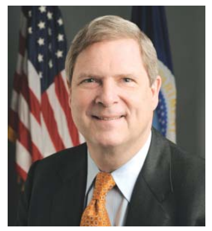
Secretary of Agriculture Tom Vilsack

When I assumed this office in January 2009, our country was struggling through the most serious economic crisis since the Great Depression. In rural America, the recession aggravated challenges that had been ignored or unsolved for decades. President Obama directed me to do everything possible to help jumpstart the national economy – and