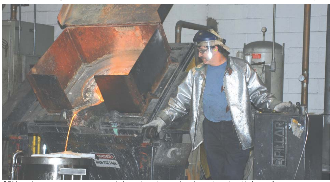
OPM smelter operator processes recycled metals and pours them into selected molds for cooling.

Ohio Precious Metals (OPM), a Jackson County metal refining company with roots dating back to 1974, received a $9,470,000 American Recovery and Reinvestment Act (ARRA) Guarantee loan through Rural Development's Business and Industry Guaranteed Loan Program. The loan was made through Peoples Bank of Lancaster, Ohio.