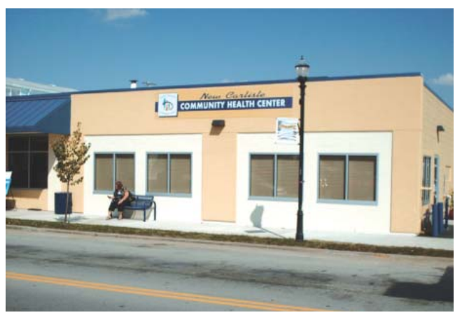
(Top photo) New Health Partners of Western Ohio facility purchased through Rural Development's CF Program. (Bottom photo) Ribbon cutting ceremony and waste projects that served dedicating new facility for Ohio Geneological Society funded through CF Program.

equipment and health and safety service centers.