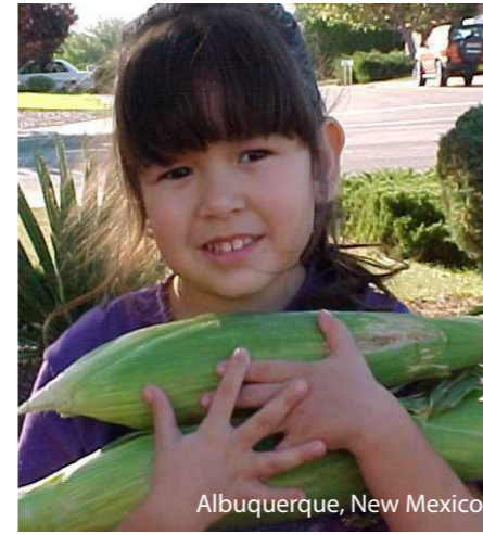
Albuquerque, New Mexico

When Abraham Lincoln founded USDA in 1862, he referred to it as "The People's Department." It is a description that is as true today as it was then. USDA touches the lives of Americans every day. To commemorate this significant link to all Americans, Secretary of Agriculture Tom Vilsack, broke ground on the first People's Garden at USDA Headquarters on February 12, 2009, the bicentennial of Lincoln's birthday. Today, the entire grounds are a part of this garden. Plans are being developed to create rooftop and rain gardens and incorporate pollinator, wildlife, and edible components throughout the landscape. The garden at USDA headquarters, as well as gardens at all USDA facilities, will demonstrate sustainable conservation practices and will be used to educate and engage the public.