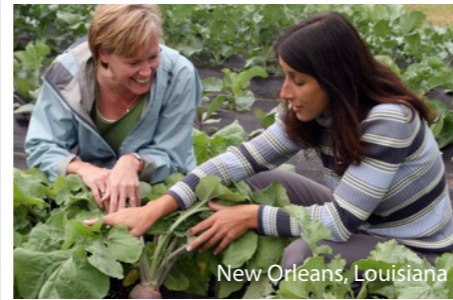
New Orleans, Louisiana

The garden must be a collaborative effort between other volunteers, neighbors or organizations within your community. Consider forming local partnerships to carry out the mission of a People's Garden.