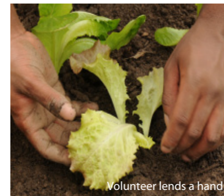
Volunteer lends a hand

People's Gardens promote sustainable practices. They improve water quality, improve soil health and create shelter and nesting habitat for wildlife.