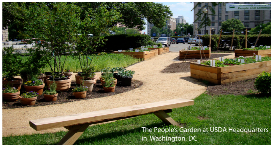
The People's Garden at USDA Headquarters in Washington, DC

With each garden we plant and every sustainable practice we implement, USDA will demonstrate how easy it is to green our communities, take better care of our natural resources, and produce healthy fruits and vegetables.