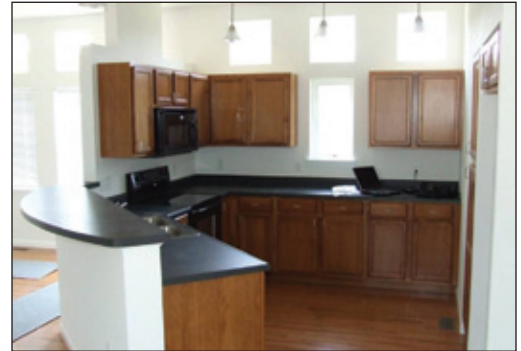
Left: A typical Patrician Place home. Right: Energy-efficient natural lighting helps lower utility costs.

10-home project known as Patrician Place. Funding for this endeavor was provided by a regional bank and the U.S. Department of Housing and Urban Development.