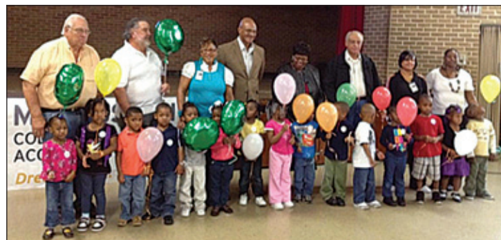
Community leaders and participants celebrate the kick-off of the Center for Community and Economic Development's Children's Savings Account (CSA) program.

CDAC (Community Development Advisory Council) members are experts in community and economic development and financial education. They complement the information developed through outreach by the District's Community Development staff and suggest ways that the Bank might support local efforts. A list of current members is available at www.stlouisfed.org/community_development .