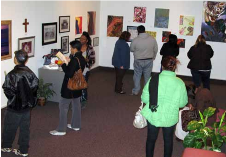
An art show is among the activities sponsored by the Women in New Roles program at Tarrant County College.

that workers with associate degrees earn $340,000 more during their career than someone with only a high school diploma, and $600,000 more than someone with no diploma. 3