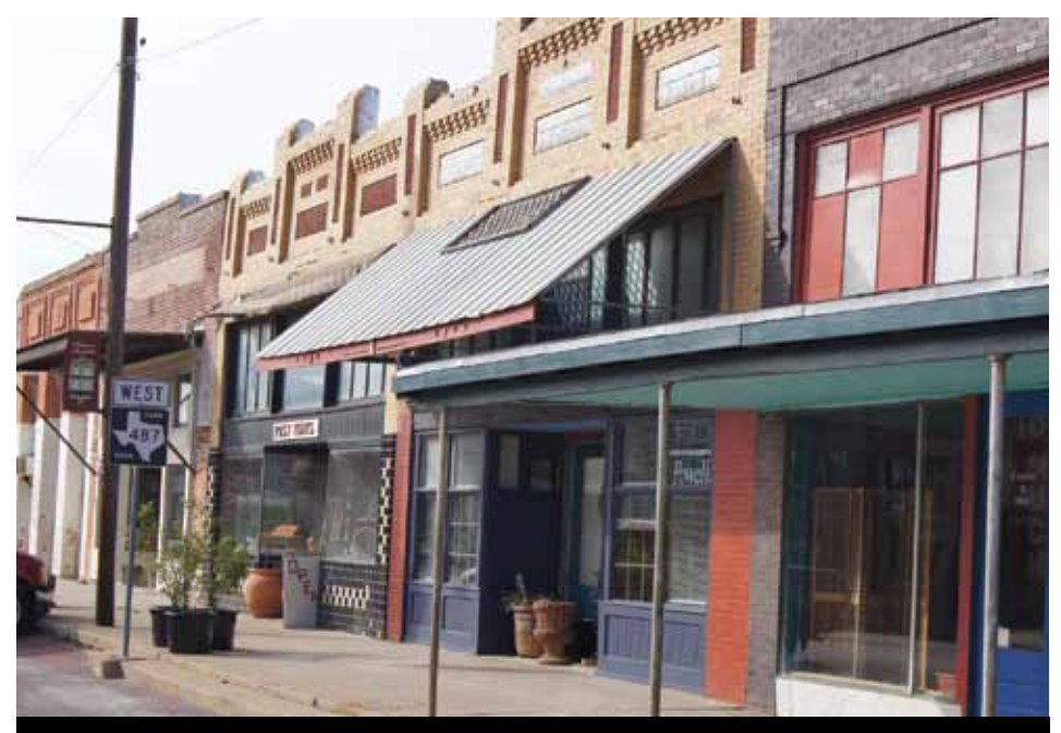
The face of rural Texas is changing, as seen in Bastrop, a once-rural town that has become a bedroom community for commuters to Austin.

Rural communities have seen their share of economic struggles in recent years. Nearly one in six people living in rural America fell below the poverty line in 2009.