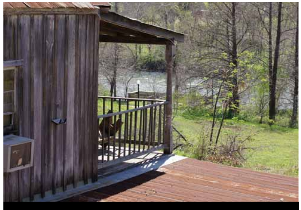
Programs like the earned income tax credit can mean the difference between a rural family living in poverty or not.

Individual Development Accounts hold much promise as a tool for addressing asset-building deficiencies in communities. IDAs supplement the savings of low-income households with matching funds drawn from a variety of public and private resources.