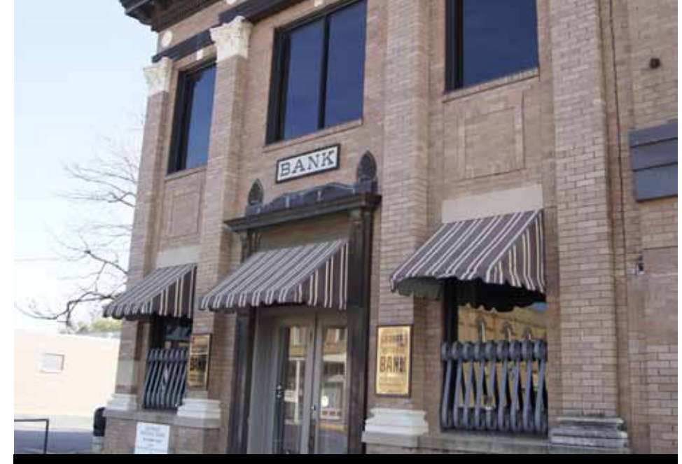
Establishing a relationship with a bank or credit union is often the first step toward building assets. Rural community banks play a critical role for families looking to save, invest and secure their finances

State and local policymakers and nonprofit and business leaders are coming together to discuss ways to strengthen and connect existing wealth-building strategies to help make these opportunities accessible to more working families.