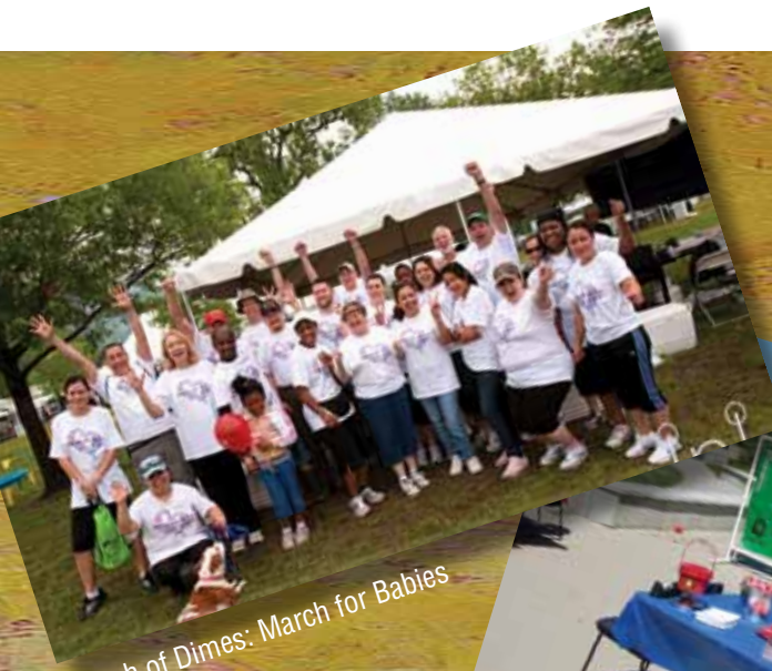
March of Dimes: March for Babies