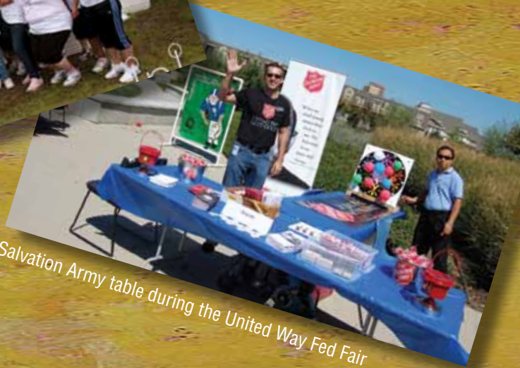
Salvation Army table during the United Way Fed Fair