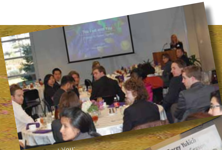
The Fed and You: College networking event