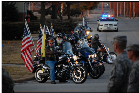
ABOVE: The Freedom Riders escorted the 55th MAC upon their return