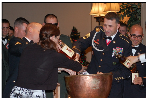
ABOVE: Soldiers of the 50th MRBC add their drink of choice to the Grog during the Holiday Ball