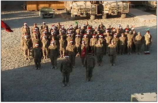
ABOVE: 515th Sappers showing their Christmas spirit