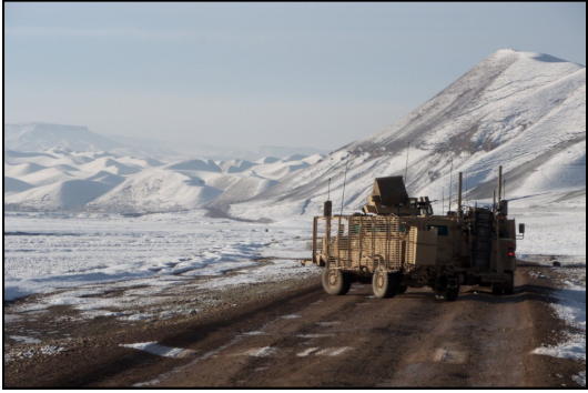
ABOVE: 509th Route Clearance pictures