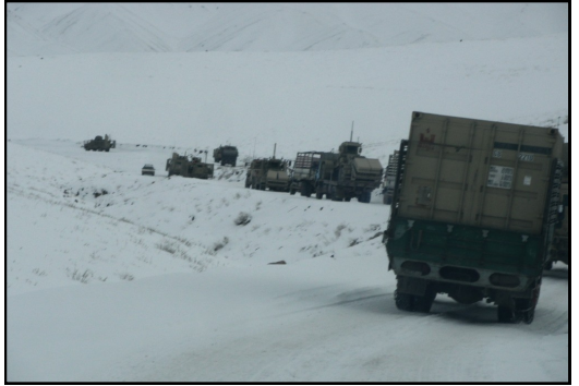
ABOVE: 509th Route Clearance pictures