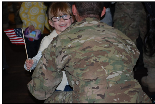
ABOVE: A Soldier greets his daughter during the ceremony