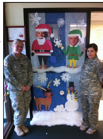
RIGHT: FSC Soldiers participate in the BDE Door decorating contest