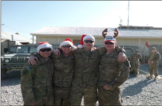
LEFT: Soldiers from the 515th celebrate Christmas in Afghanistan