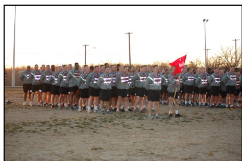
ABOVE: HHC and the rear detachments in formation before a battalion run