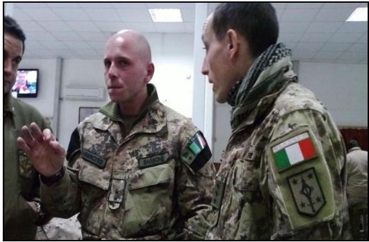
BELOW: 509th has worked with Italians during their support of Operation Enduring Freedom