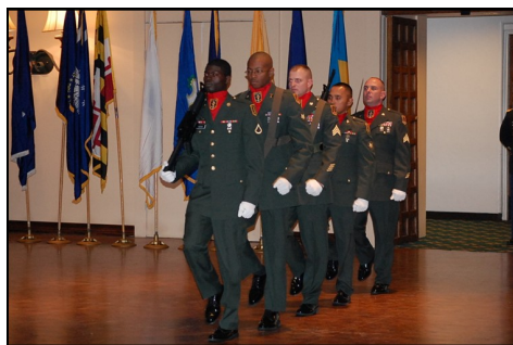
ABOVE: FSC Soldiers provide the Color guard at the BN Christmas Ball