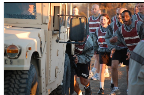
ABOVE: 50th MRBC Soldiers during the HMMWV push event of the 6 JAN Fighter Day