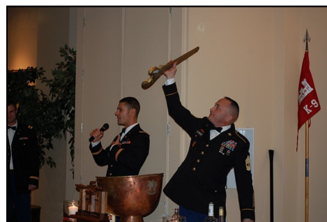
ABOVE: The commander and 1SG making sure the GROG has the right stirring tool