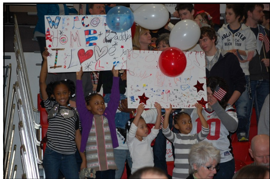
BELOW: Family and friends showed their support with signs honoring their loved ones