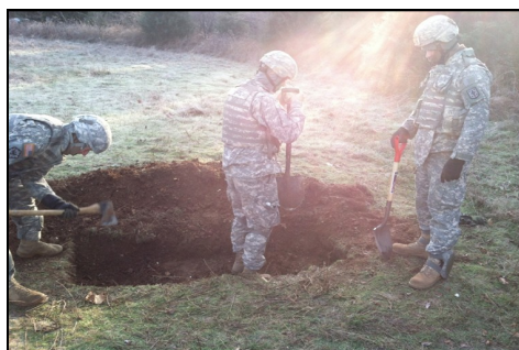
ABOVE: FSC Soldiers digging a FOX hole to "Standard" during warrior time training