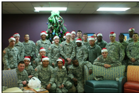
ABOVE: On 16 December 2011, Soldiers from the 50 th MRBC went to Columbia Children's Hospital with bags of new toys