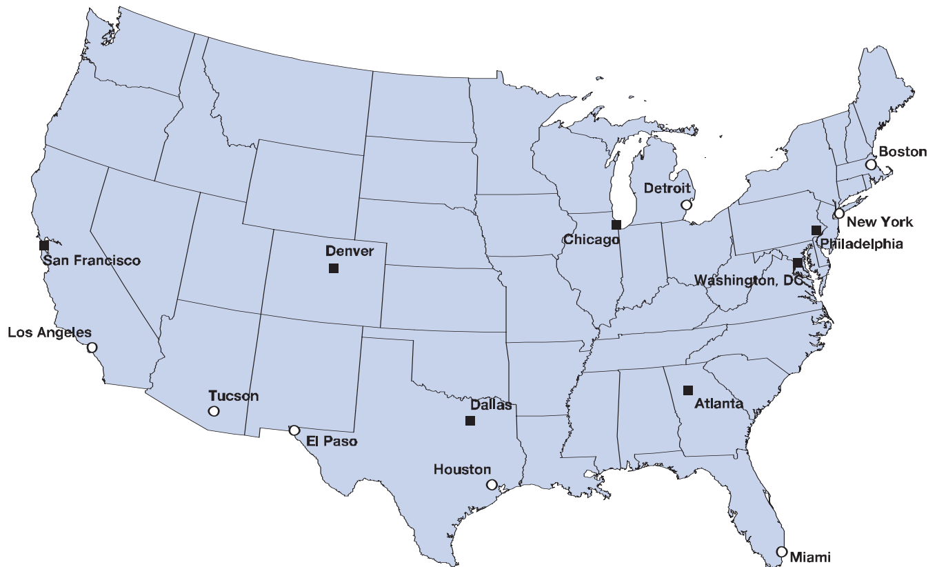
Audit and Investigations Divisions Locations as of September 30, 2003

Information about the OIG and full-text versions of many of its reports are available at www.usdoj.gov/oig .