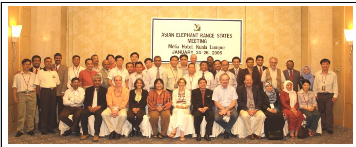
ASIAN ELEPHANT RANGE STATES MEETING