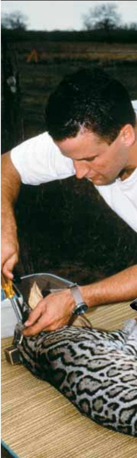
Laguna Atascosa NWR, Texas Ocelot