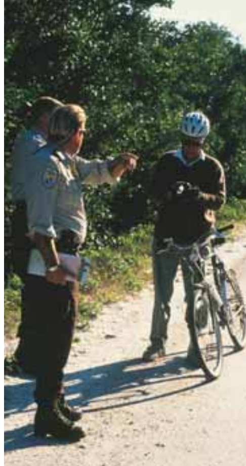
Ding Darling NWR, Florida

The Division of Law Enforcement helps protect “wild things” and “wild places” in this country, including national wildlife refuges. Service special agents work in partnership with refuge officers to uphold Federal laws that safeguard fish, wildlife and their habitat.