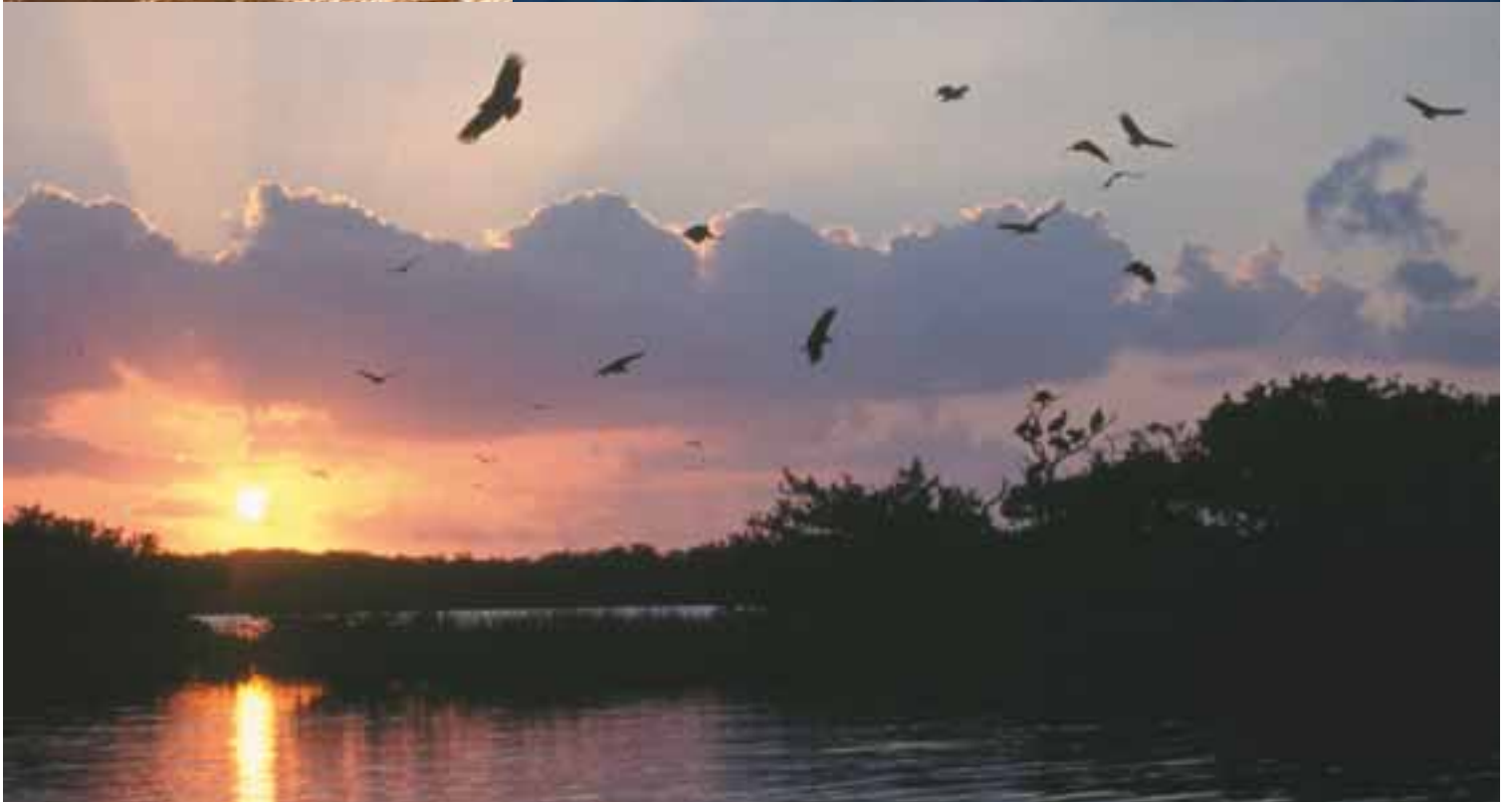
Pelican Island at sunset