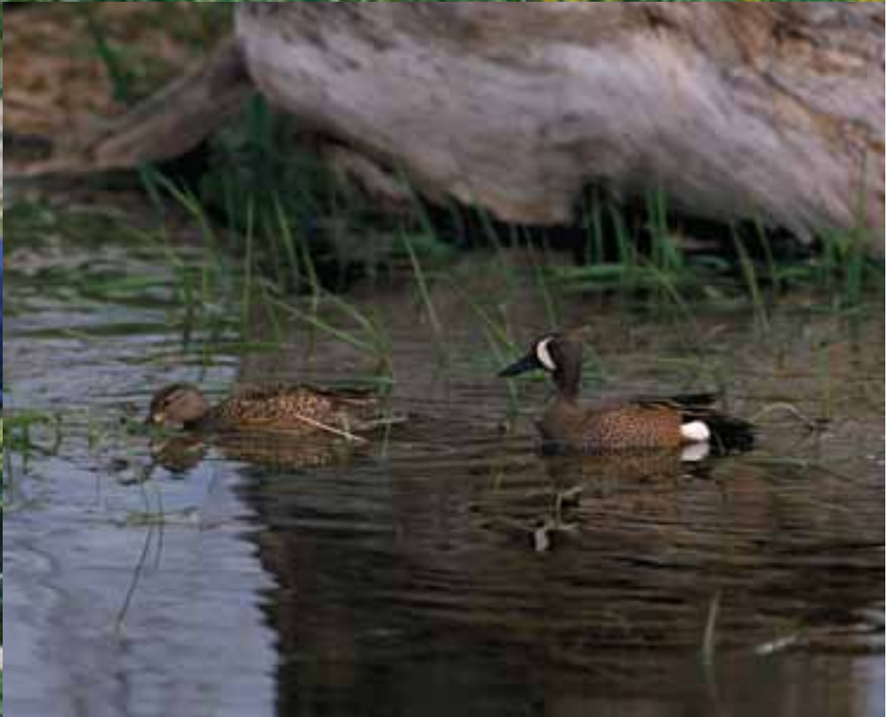
Shiawassee NWR, Michigan Blue winged teal