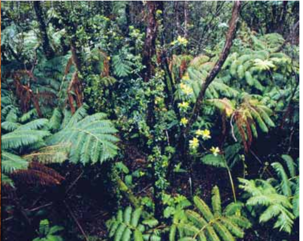
Haukalau Forest NWR, Hawaii