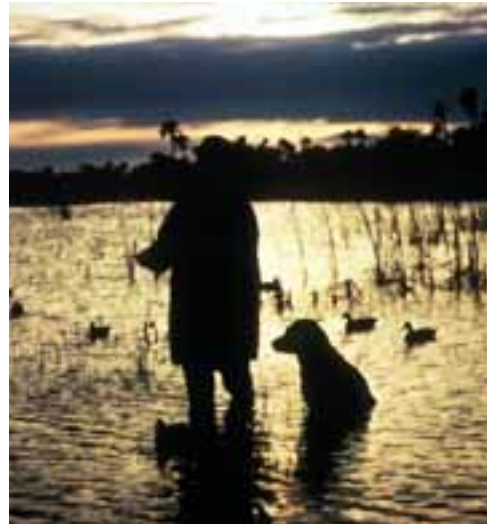
Setting decoys

About 1,500 miles west of Anchorage, a brilliant jade green island jugged out of the fog-choked Gulf of Alaska. Buldir Island is part of the Aleutian Islands NWR and is home to millions of nesting seabirds. It has played an important role in the recovery of the Aleutian Canada Goose, and its underwater substrate provides tremendous foraging opportunities for numerous marine fish species. I saw the small island in June 1977 from the deck of a Soviet fishing trawler while monitoring the commercial fishing catch in the western Aleutians.