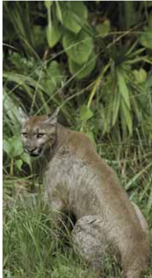
Florida Panther NWR, Florida Florida panther

As I prepare to take the reins of the National Wildlife Refuge System, I look back on what has already been accomplished with awe, and look ahead to the challenges we face with confidence. I know, coming in, that our people are the most important assets of the refuge system. I know that their intelligence, their passion for the resources in their trust, and the sometimes incredible hours they are willing to work will make the accomplishments of our future every bit as bright as the conservation victories of the past 100 years.