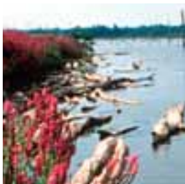
■ Montezuma NWR, NY Number of Refuges 124