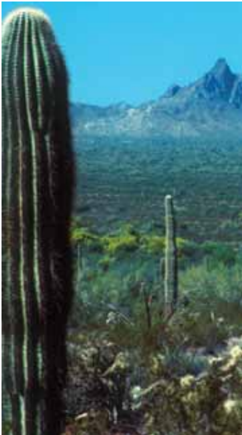
Cabeza Prieta NWR, Arizona