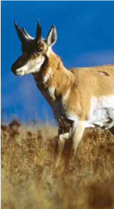
National Bison Range, Montana Pronghorn