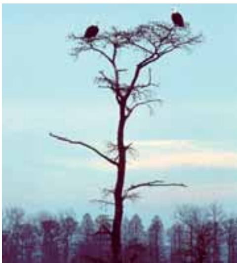
Reelfoot NWR, Tennessee Bald eagles