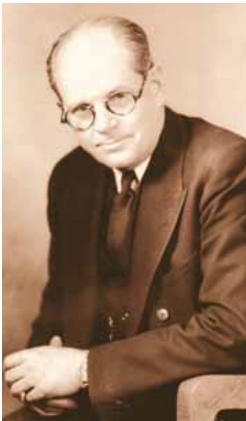
J.N. "Ding" Darling

Darling wasn't alone in his thinking. Many of the country's eminent conservationists and wildlife biologists agreed with him. Though overshooting was a problem, the loss of prime waterfowl habitat was more serious.