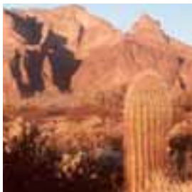
■ Kofa NWR, AZ Number of Refuges 170