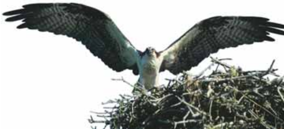
Ten Thousand Islands NWR, Florida