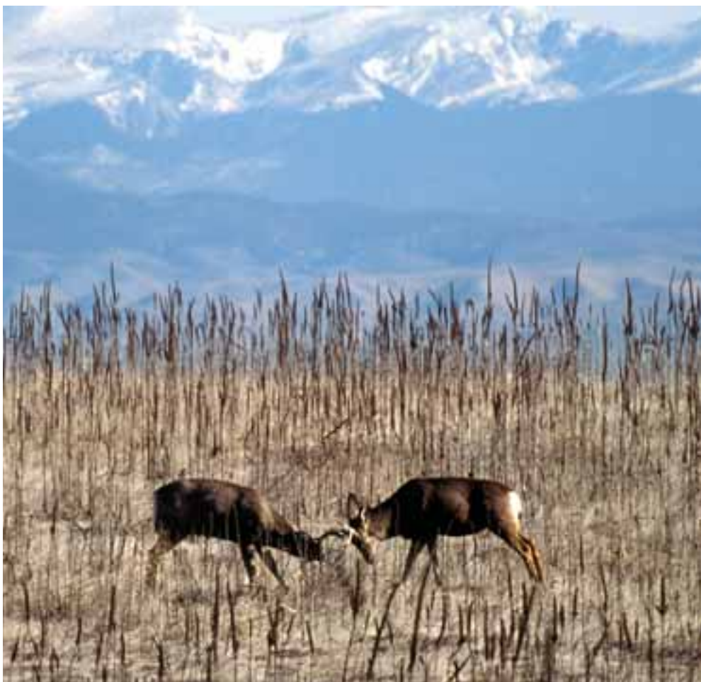
Rocky Mountain Arsenal NWR, Colorado