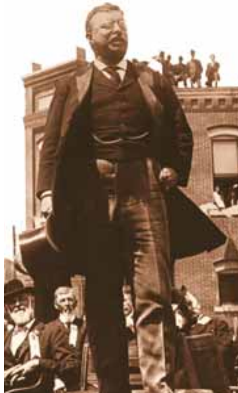
President Theodore Roosevelt

Excerpts from the Refuge's 75th Edition of Fish and Wildlife News