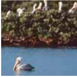
■ Pelican Island NWR, FL Number of Refuges 1