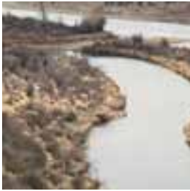
■ Seedskaadee NWR, WY Number of Refuges 284