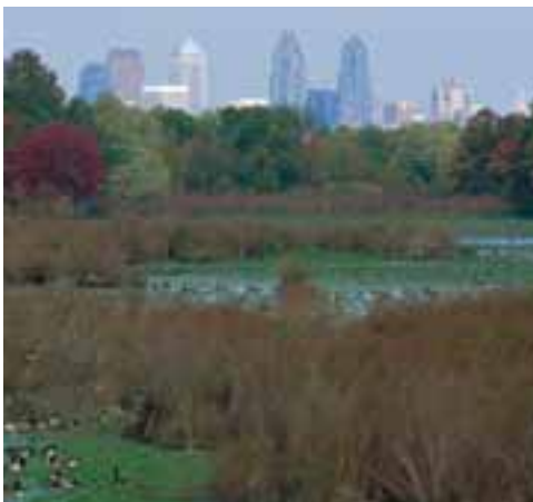
John Heinz NWR, Pennsylvania

We can't talk about the past 25 years without recalling our struggles with incompatible uses on refuges. A damning 1989 GAO report and the lawsuit that followed brought a rallying cry for organic legislation. The enactment of the National Wildlife Refuge System Improvement Act in 1997 is of tremendous historical significance. This "organic legislation" clarified the wildlife conservation mission of the refuge system.