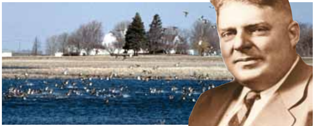
Maynard Reese Waterfowl Production Area, Iowa