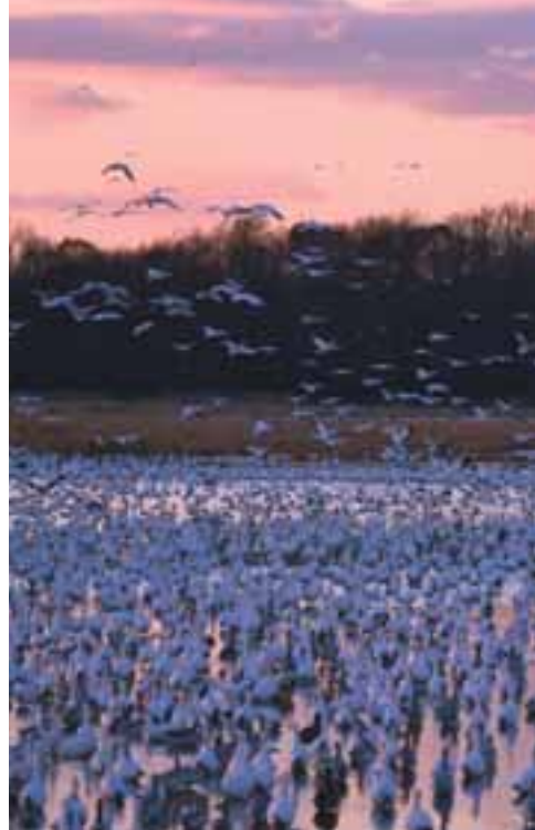
Bombay Hook NWR, Delaware

As the National Wildlife Refuge System celebrates its 100th anniversary, it needs and deserves support now more than ever.