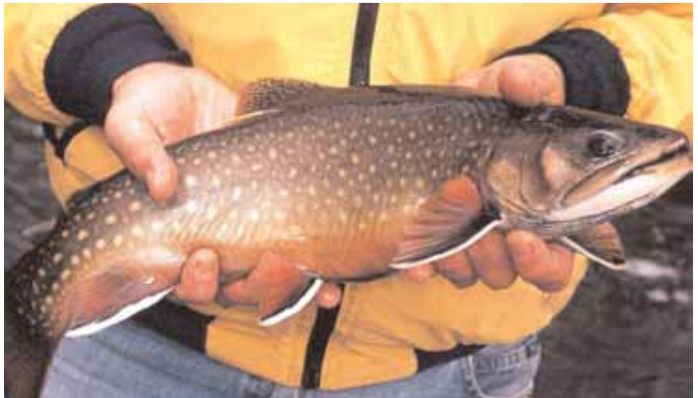
Whittlesey Creek NWR, Wisconsin Coaster brook trout