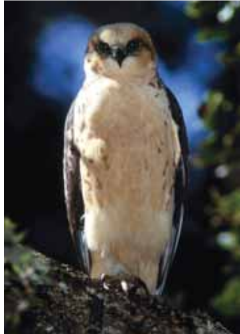
Hakalan NWR, Hawaii