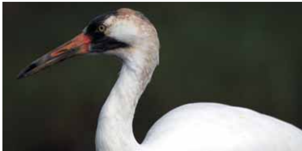
Chassahowitzka NWR, Florida