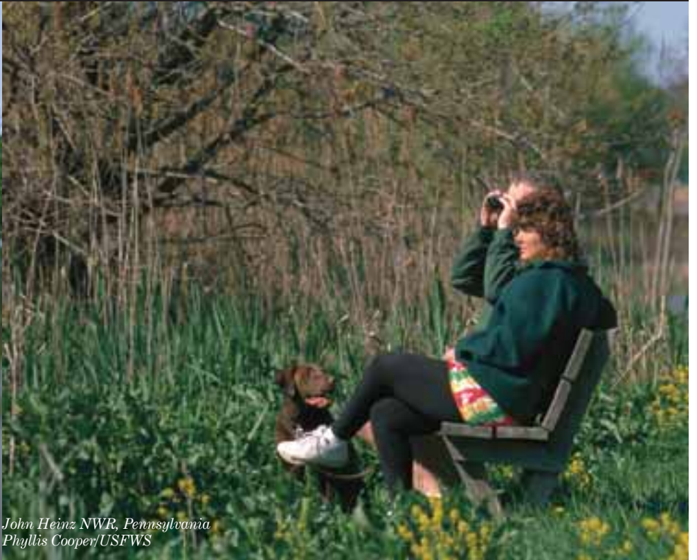
John Heinz NWR, Pennsylvania