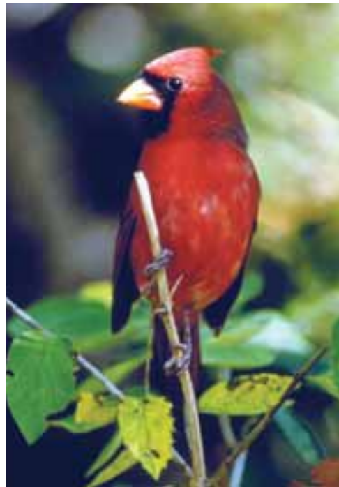
Morton NWR, New York

It would be difficult to find a conservationist who hasn't heard or used that phrase at least once during his life. It's a good metaphor, eliciting the vision of the interconnectedness of all creatures great and small to sustain life. The metaphor works for the Service, too — one division connected to another, all needed to successfully preserve the mission of the Service — and that's why the National Wildlife Refuge Centennial is not just a celebration for those working on a refuge, it's a celebration for all of us working for the Service.