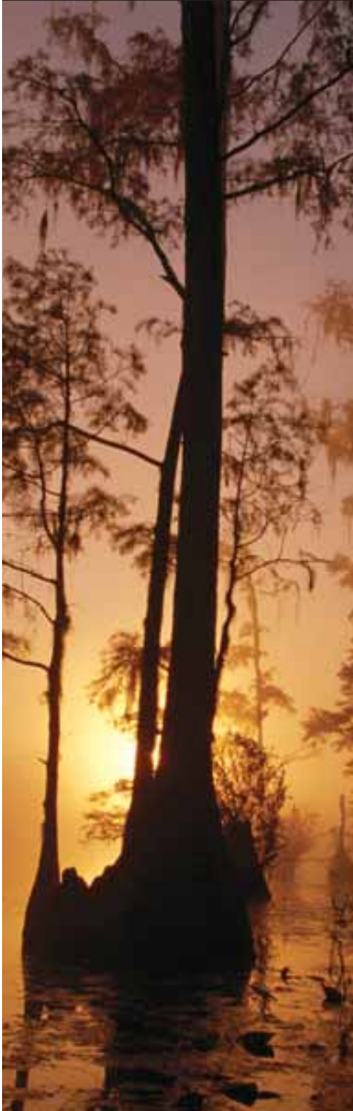
Okefenokee NWR, Georgia