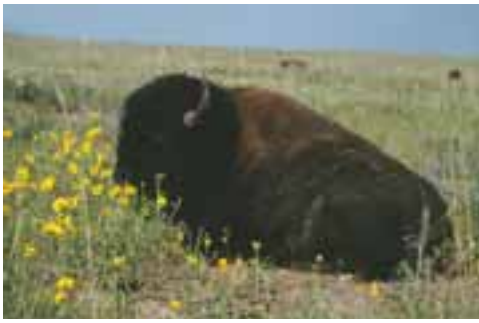
Fort Niobrara NWR, Nebraska American bison