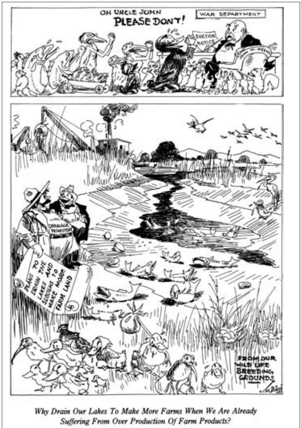
J.N. "Ding" Darling cartoon

They got quite a bit of that money for the Biological Survey, and embarked on a crusade that would revitalize the hard-pressed Survey and its refuges. It would end only when World War II interfered.