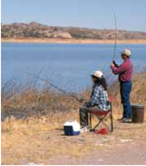
Bosque del Apache NWR, New Mexico

The American Sportfishing Association is a longstanding partner with the Service. Most people in the agency know us because of our support for the fisheries program. But we're also proud to be a part of the Cooperative Alliance for Refuge Enhancement.