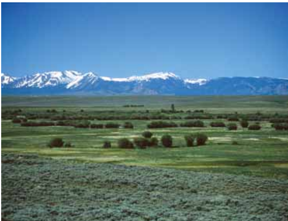
Arapaho NWR, Colorado