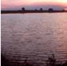
■ Cape May NWR, NJ Number of Refuges 453