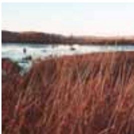
■ Canaan Valley NWR, WV Number of Refuges 500