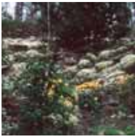
■ Kanuti NWR, AK Number of Refuges 404