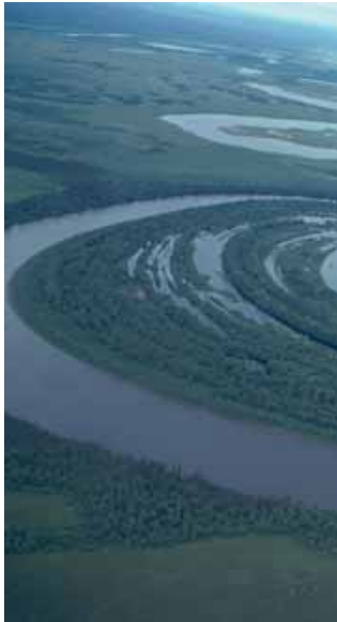
Innoko NWR, Alaska

The Wildlife Management Institute (WMI) was established eight years after Pelican Island was designated as the first National Wildlife Refuge. As a result, both the Refuge Systems' and WMI's histories have intertwined during the last century. WMI has been a firm supporter of the Refuge System since its inception.