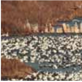
■ DeSota NWR, IA Number of Refuges 239