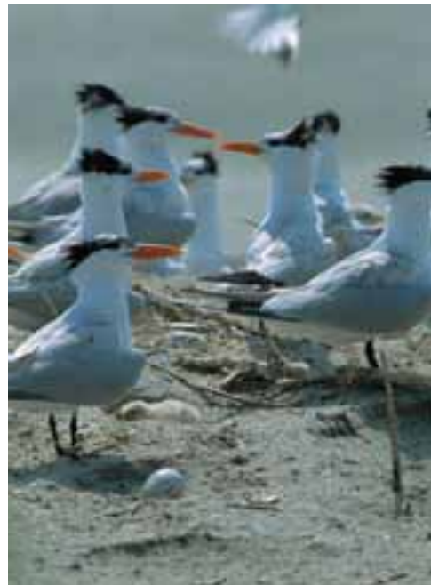
Cedar Island NWR, North Carolina