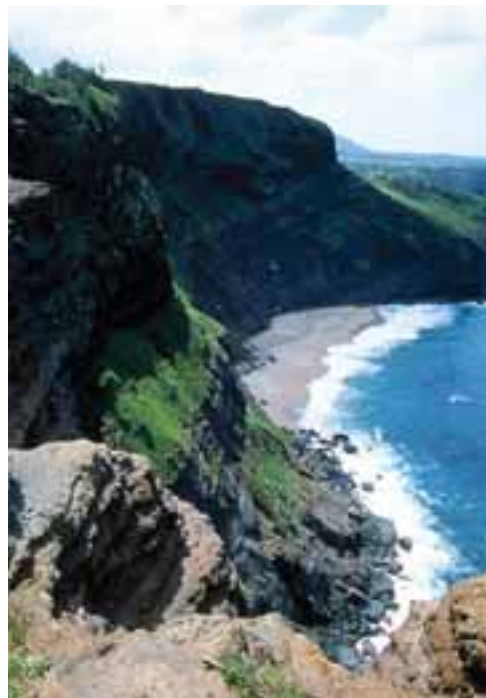
Kilauea Point NWR, Hawaii