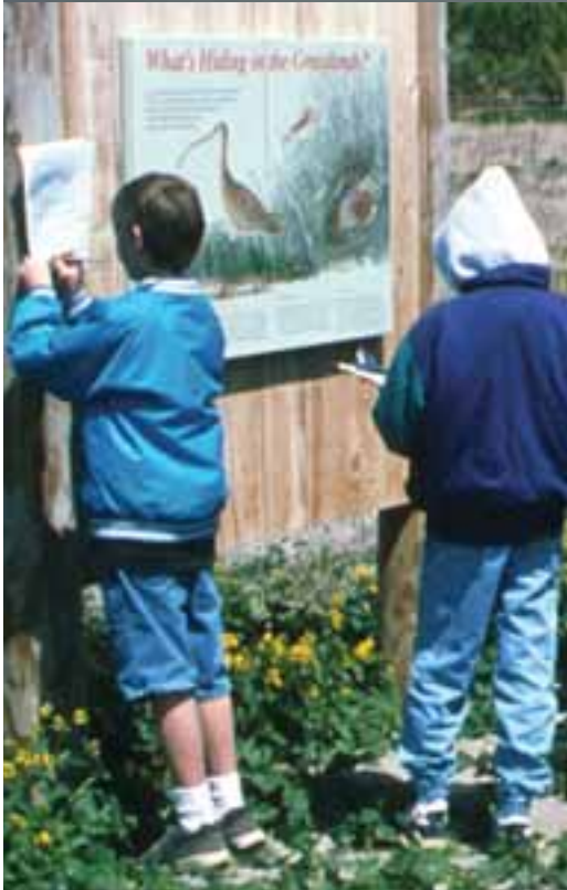
Tule Lake NWR, California