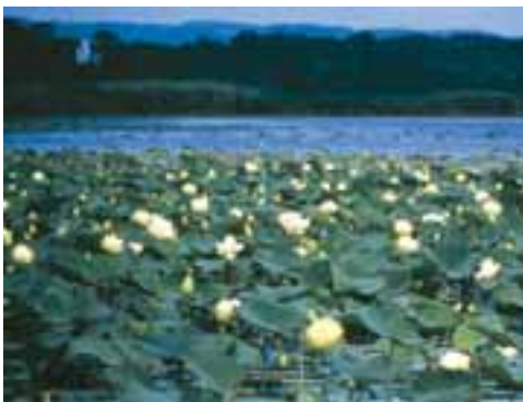
Upper Mississippi NWR, Iowa American lotus

By that time, the National Wildlife Refuge System was an established fact.