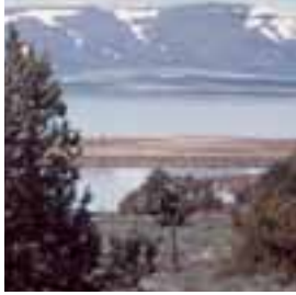
■ Clear Lake NWR, CA Number of Refuges 26