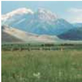
■ Red Rocks Lake NWR, MT Number of Refuges 90