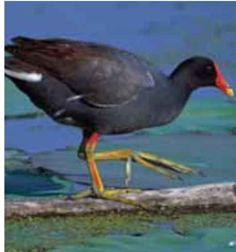
Squaw Creek NWR, Missouri