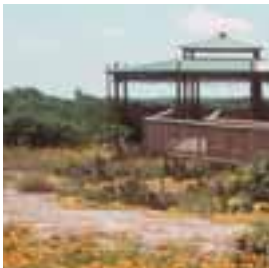
■ Balcones Canyonlands NWR, TX Number of Refuges 486