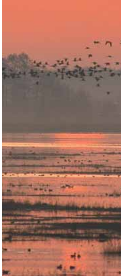
Lacassine NWR, Louisiana

This Centennial issue of the Fish and Wildlife Service News is full of the history of the National Wildlife Refuge System. As a second generation Fish and Wildlife Service employee, I take great pride in our heritage and our century of accomplishments in conserving fish and wildlife. We have a lot to be proud of and reason to celebrate.