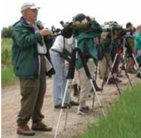
Rice Lake NWR, Minnesota

As we all know, the National Wildlife Refuge System welcomes almost 40 million visitors a year. Most of these people are there to watch wildlife, and in most reserves birds are the most visible and cooperative of wildlife to watch. As a result, the refuges act as important portals to birding and, for many, birding is their gateway to a relationship with the natural world. The system serves as an effective way to introduce the many visitors to birds, the needs of birds, and the urgent need to conserve the habitats on which the birds depend. While important for birds, the refuges are also very special to many birders.