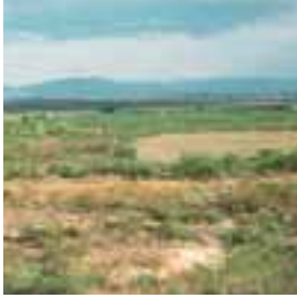
■ San Bernadino NWR, AZ Number of Refuges 409