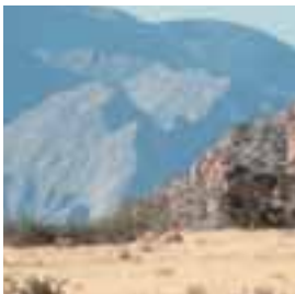
■ Sevilleta NWR, NM Number of Refuges 339