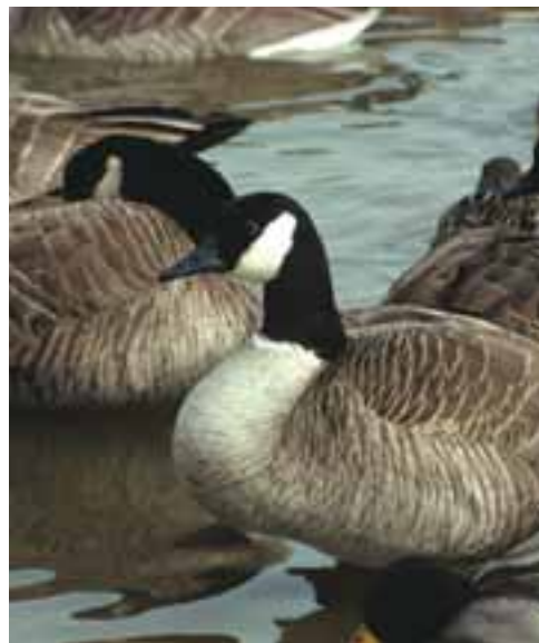
Crab Orchard NWR, Illinois

Ducks Unlimited is proud to be a partner in the refuge system. We have close to 600 projects on our nation's refuges, amounting to 300,000 acres of wetlands and associated uplands. Dispersed throughout the four flyways traveled by migratory birds in the United States, our nation's refuges present a valued opportunity to restore and enhance critical habitats.