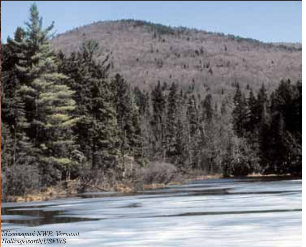
Mississquoi NWR, Vermont