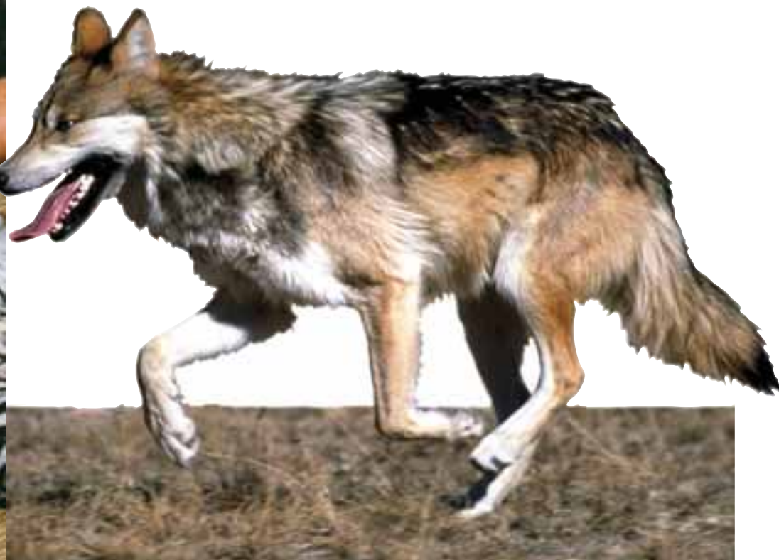
Sevilleta NWR, New Mexico Mexican wolf