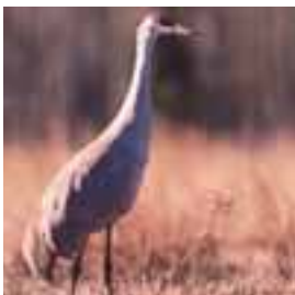
■ Mississippi Sandhill Crane NWR, MS Number of Refuges 361