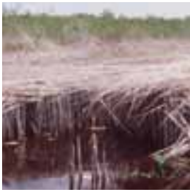
■ Loxahatchee NWR, FL Number of Refuges 220