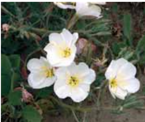
Antioch Dunes NWR, California Evening primrose