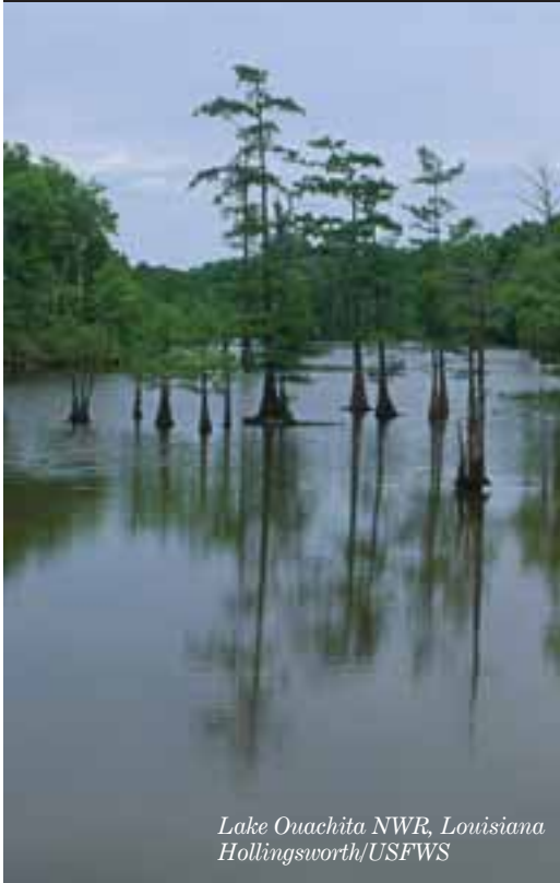
Lake Ouachita NWR, Louisiana