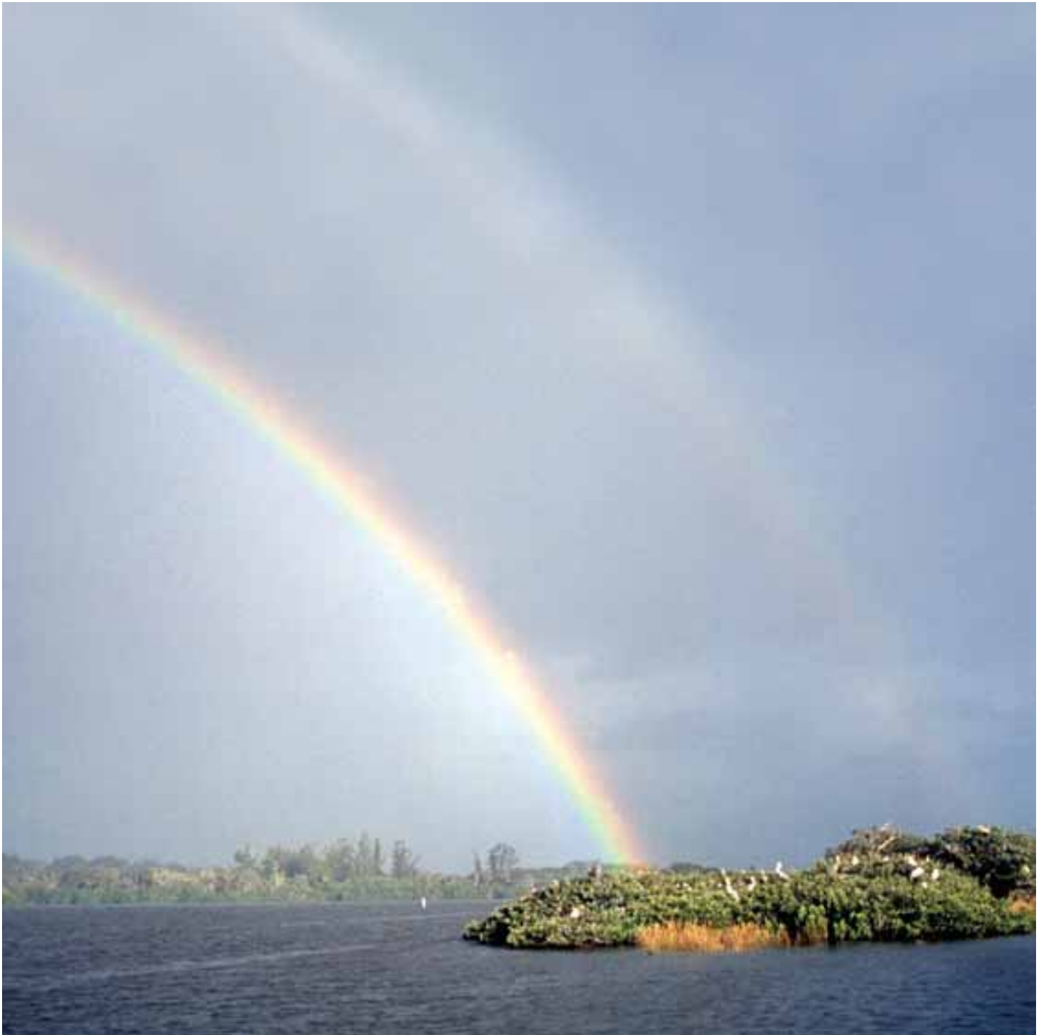
Pelican Island NWR, Florida