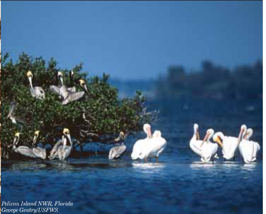
Pelican Island NWR, Florida