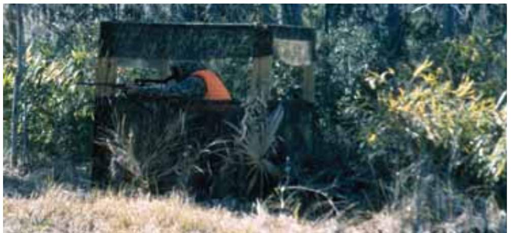
Ace Basin NWR, South Carolina, Disabled hunter blinds