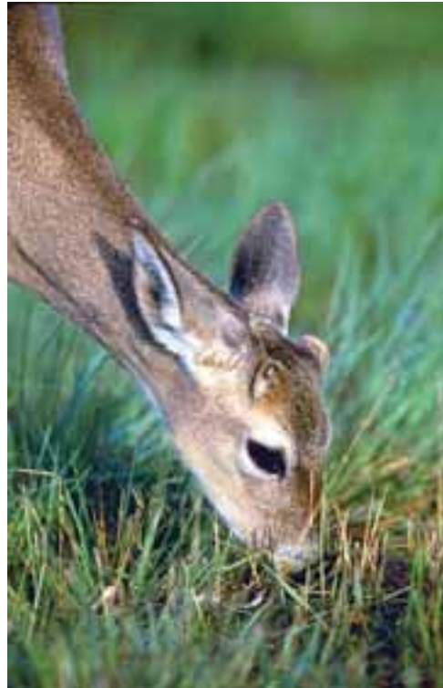
Key Deer NWR, Florida Key deer