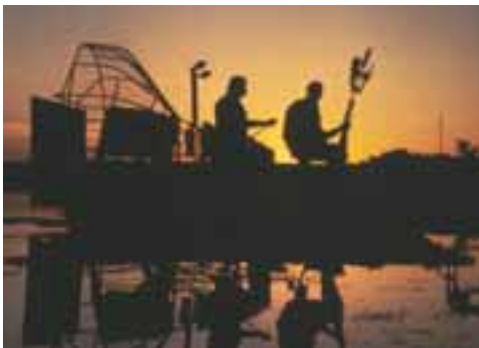
Air boats

The National Conservation Training Center Museum has grown rapidly in recent years. Holdings now include diverse objects, ranging from an old wall box telephone to documents signed by Presidents Theodore Roosevelt and John F. Kennedy. This large collection was put to good use by the producers of “Arctic Dance,” a film about Mardy Murie, the grandmother of the conservation movement, and the History Channel’s “Dangerous Missions,” an episode about Service Law Enforcement.