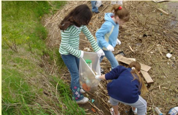
DEPARTMENT OF DEFENSE DEPENDENT SCHOOL STUDENTS (DoDDS) gain "hands-on" experience learning stewardship principles at a base beach clean-up event.

REPLACEMENT OF HIGH PRESSURE SODIUM VAPOR LAMPS with energy efficient fluorescent lamps in hardened aircraft shelters conserved electricity and improved light quality, meeting mission and environmental goals.