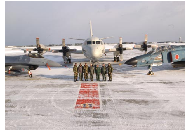
US AIR FORCE, US NAVY AND JAPAN SELF DEFENSE FORCE COMMANDERS form a strong coalition defending Japan and promoting US security interests in the region.