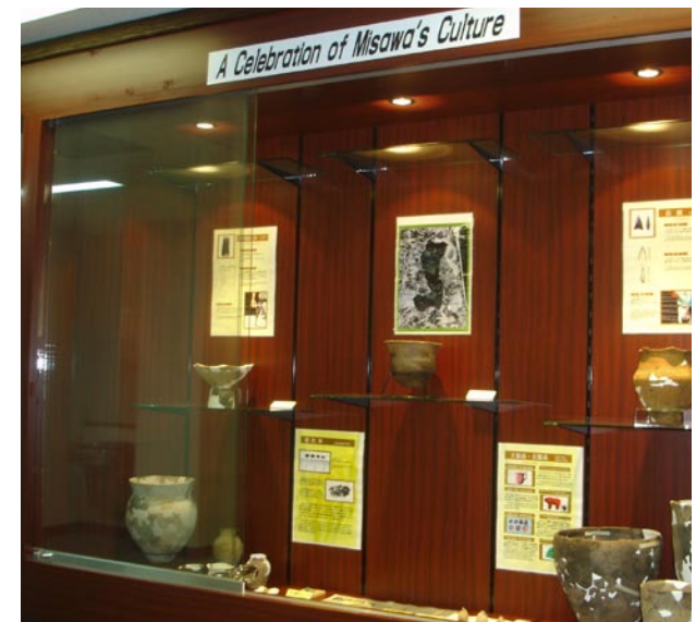
ARCHAEOLOGICAL EXHIBIT displaying artifacts found on base. Some artifacts found have been dated back 10,000 years.