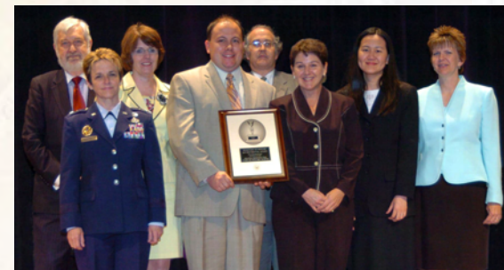
TINKER'S P2 ACCOMPLISHMENTS WERE NOTED BY THE NATIONAL P2 ROUNDTABLE, WHO PRESENTED TAFB WITH THE 2006 MOST VALUABLE POLLUTION PREVENTION PROGRAM AWARD.

reduction. This is accomplished through the use of chemical substitutions, process changes, and other techniques. If hazardous materials must be used, TAFB minimizes their use as much as possible. Second, TAFB recycles and reuses spent material or waste whenever possible. And third, as a last resort, TAFB disposes of hazardous waste in an environmentally safe manner, consistent with the requirements of all applicable laws. The table (shown right) highlights some of the most notable P2 accomplishments.