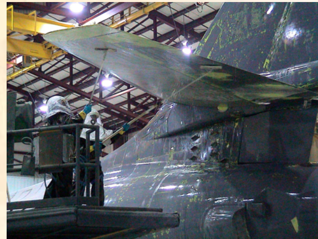
THE TAFB P2 TEAM SUCCESSFULLY IMPLEMENTED A NON-CHROMATED SURFACE TREATMENT (PREKOTE), WHICH ACHIEVES BETTER PAINT ADHESION AND SAVES $120,000 ANNUALLY.

The first step in the environmental management hierarchy requires that TAFB practice source