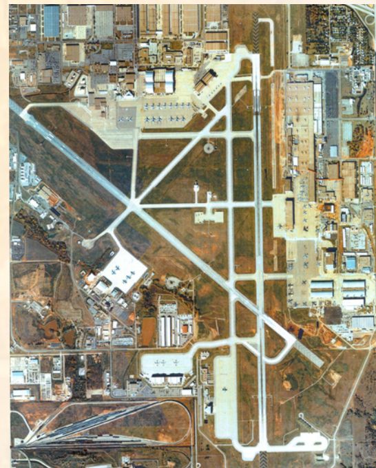
TAFB ENCOMPASSES 5,031 ACRES AND EMPLOYS MORE THAN 26,000 MILITARY AND CIVILIAN EMPLOYEES, THE LARGEST INDUSTRIAL EMPLOYER IN OKLAHOMA. THE PRIMARY AREA OF THE BASE'S INDUSTRIAL ACTIVITIES IS SHOWN ABOVE.

To accomplish this strategic vision, CEV has performed the following activities: