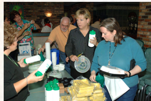
IN CELEBRATION OF BASE ENVIRONMENTAL AWARENESS, DEMONSTRATIONS WERE HELD AT BUILDING 3001 TO EMPHASIZE EACH WORKER'S ROLE IN ENVIRONMENTAL COMPLIANCE AND STEWARDSHIP.