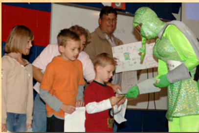
SUPERHERO RECYCLOWOMAN SPREADS THE GOOD NEWS ABOUT RECYCLING AT TINKER ELEMENTARY SCHOOL.

TAFB has an extensive proactive community outreach program that is designed to heighten environmental awareness by providing opportunities for the TAFB staff and the public to participate in several environmental activities/events. Activities include: