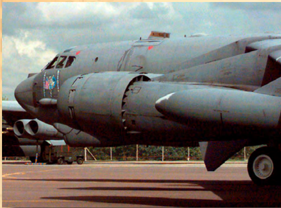
A SUCCESSFUL TF-33 ENGINE TEST OF FISCHER-TROPSCH FUEL (A DOMESTIC, NON-PETROLEUM FUEL) AT TINKER LED TO A B-52 FLIGHT TEST AT EDWARDS AFB.

The base has also entered into a partnership with the EPA to reduce the use of priority chemicals on base. These chemicals are either bioaccumulators or environmentally persistent. TAFB was recognized as the 100th partner to join the National Partnership for Environmental Priorities (NPEP) Program and has voluntarily agreed to reduce five chemicals used on base. These reduction plans have been incorporated as environmental management plans under the EMS.