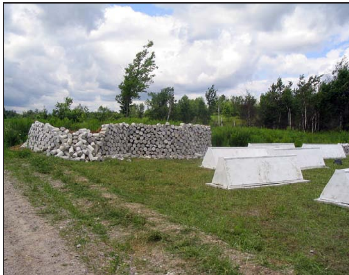
Fort Drum archaeology and LRAM crews worked together to build a replica stone cone mosaic tower and Middle Eastern style cemetery as avoidance targets for Fort Drum's Adirondack Range 48.