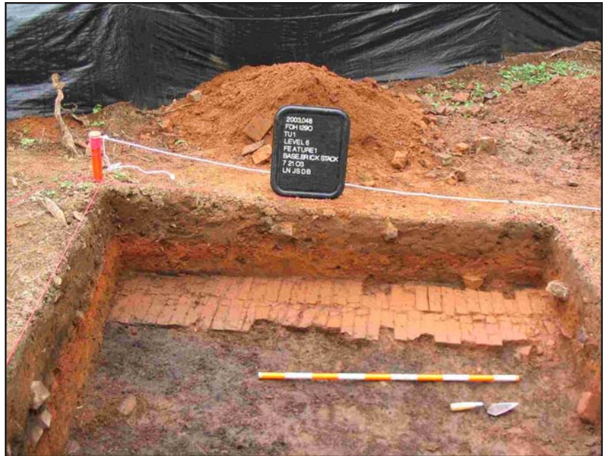
Significant archaeological sites on Fort Drum include the original brick clamp where the bricks for the LeRay Mansion were made.

The primary management tool for accomplishing the goals and objectives of the Fort Drum CRM program is the ICRMP, first signed at the end of 2001. The draft of the updated plan is complete