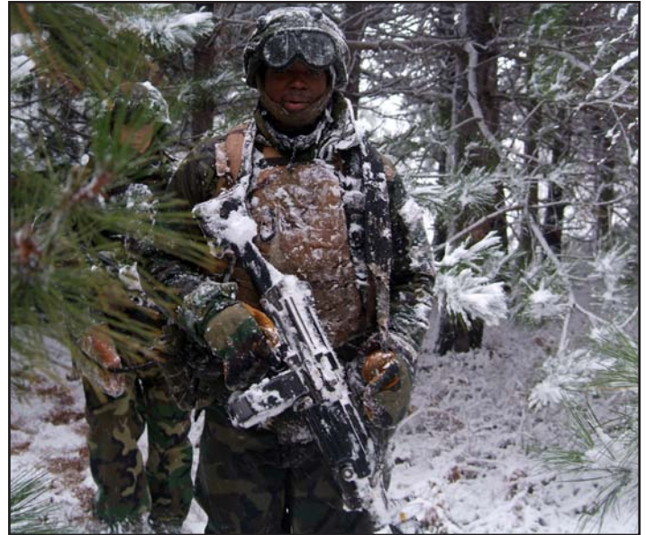
Fort Drum is home to the Army's 10th Mountain Division.

Today, the Fort Drum cultural resources management (CRM) team manages the entire installation, which encompasses over 200 prehistoric and 700 historic archaeological