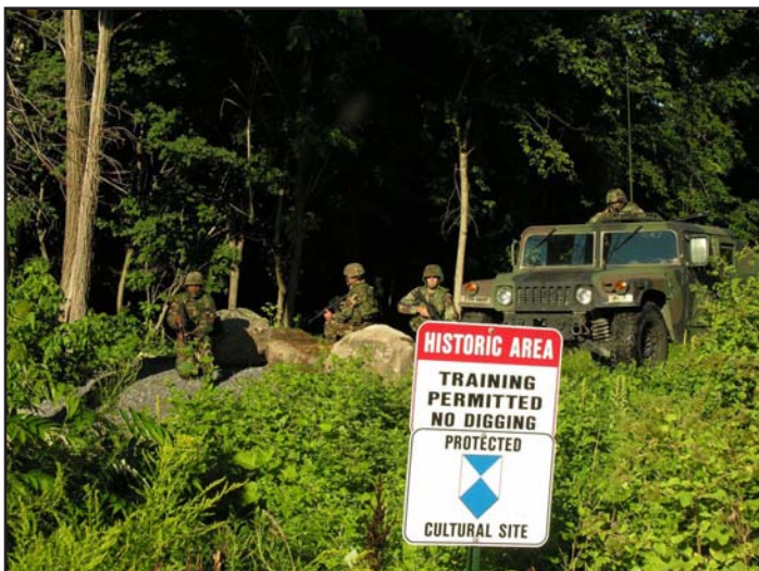
Fort Drum Soldiers conduct squad maneuver training in and around hardened cultural resource sites.

Intermittent encounters in the Fort Drum region between Native American governments, societies, residents and European explorers, missionaries and settlers began in the mid-16th century and continued until the treaty of Canandaigua opened