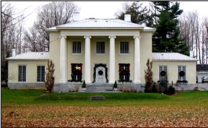
The LeRay Mansion is one of the six Fort Drum historic and archaeological districts listed on the National Register of Historic Places.