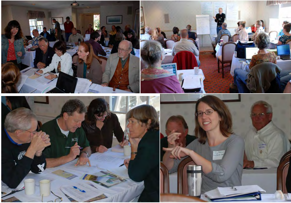
Meeting in Mendocino, California, on August 20 and 21, 2009, the North Coast Geotourism Committee reviewed the more than 900 site nominations gathered and submitted during the initial phase of developing the North Coast Geotourism MapGuide with the National Geographic Society and coordinated by the BLM's California Coastal National Monument.