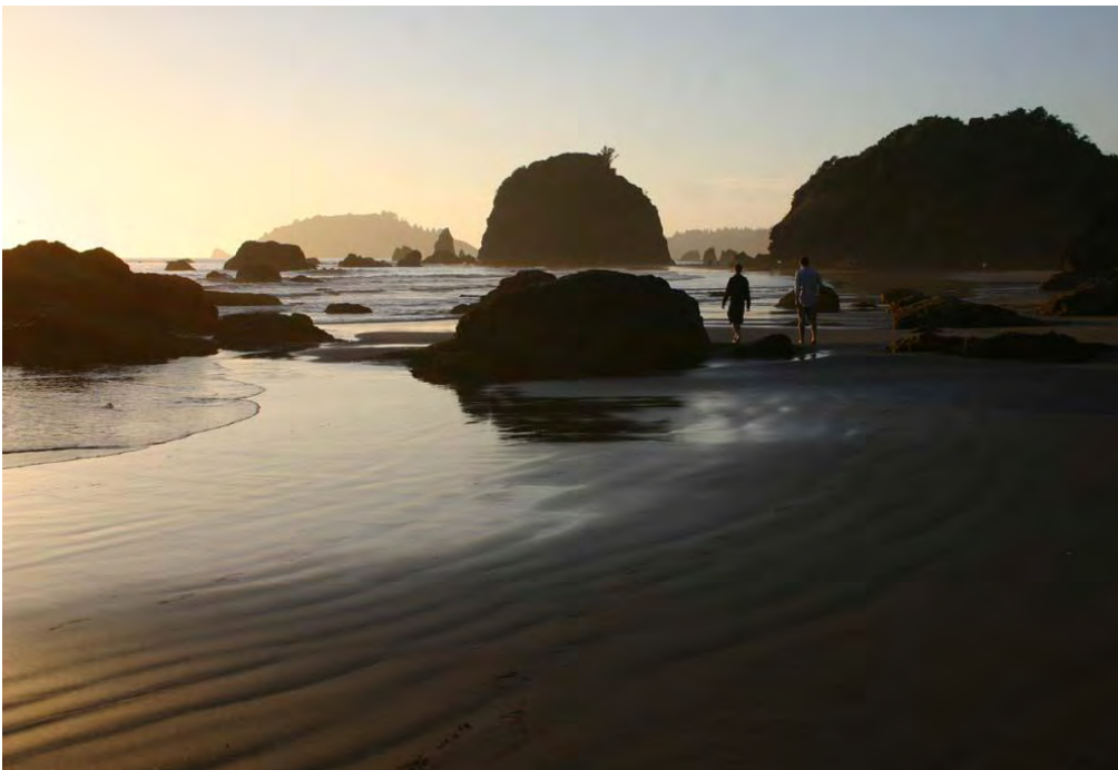
Button Rock at low tide (Houda Point, Trinidad Bay (Humboldt County, CA)

[NOTE: Images from the CCNM Traveling Photo Exhibit should be posted on the CCNM website before the end of February 2009.]