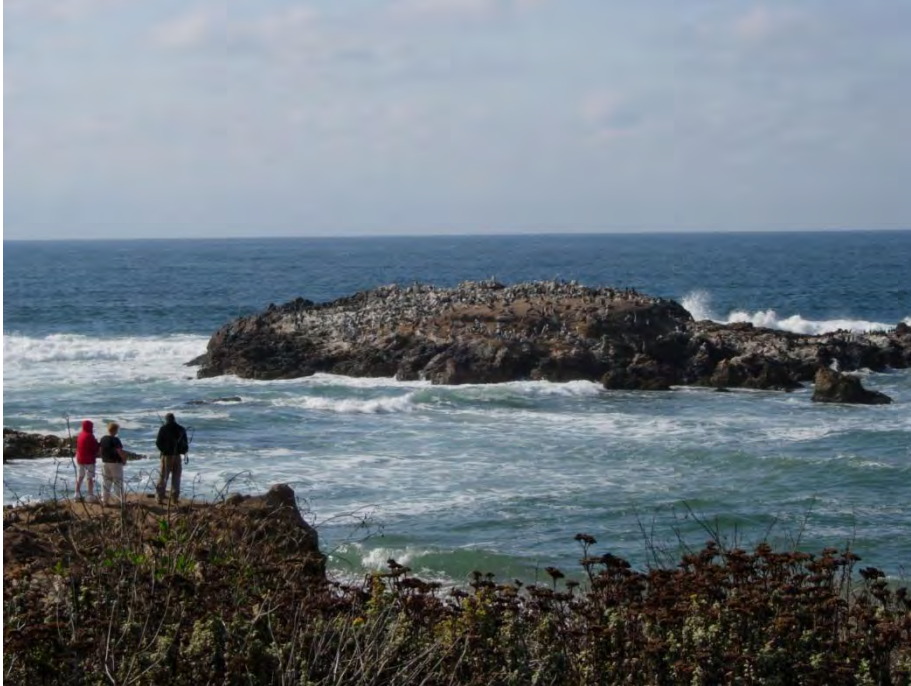
The CCNM is the most viewed of all the Nation's national monuments, but most viewers do not know that they are looking at a National Monument. Millions of people each year drive along the California coast and see or stop to view the ocean and use the rocks as a focal point for handling the ocean's vastness. (Photo is of Pescadero Rock off Pescadero State Beach, San Mateo County, CA)