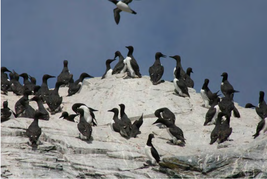
Common Murre on Flatiron Rock north of Trinidad (Humboldt County, CA)