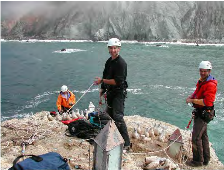
U.S. Fish & Wildlife Service biologists removing Common Murre decoys from Devil's Slide Rock south of Pacifica (San Mateo County, CA)