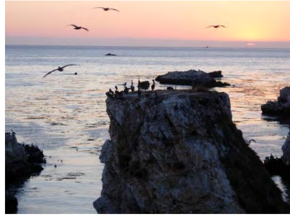
The Brown Pelican uses the CCNM rocks and small islands along the entire California coast for resting and roosting (Photos off Shell Beach within the City of Pismo Beach, San Luis Obispo County, CA).