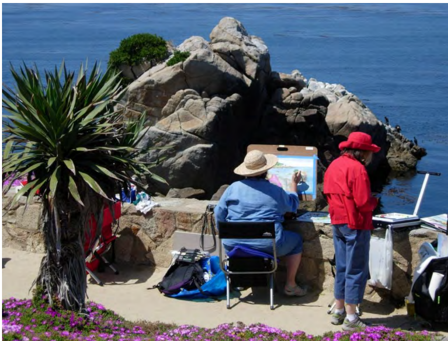
Art class using a CCNM rock at Pacific Grove on the Monterey Peninsula (Monterey County CA).