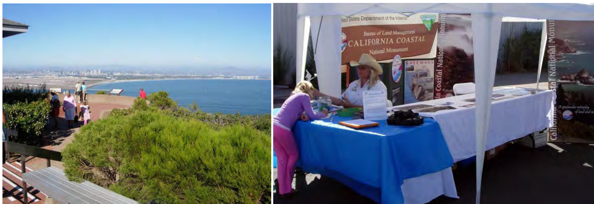
CCNM was an exhibitor at an all-day "Celebration of San Diego Parks, Natural Areas and Open Space" on the anniversary of the National Park Service's Founder's Day at Cabrillo National Monument, on August 25, 2009, BLMers handed out CCNM and National Landscape Conservation System brochures and CCNM pencils and posters, discussed the CCNM and NLCS, and provided the opportunity for kids to make pelican headbands or borrow binoculars.