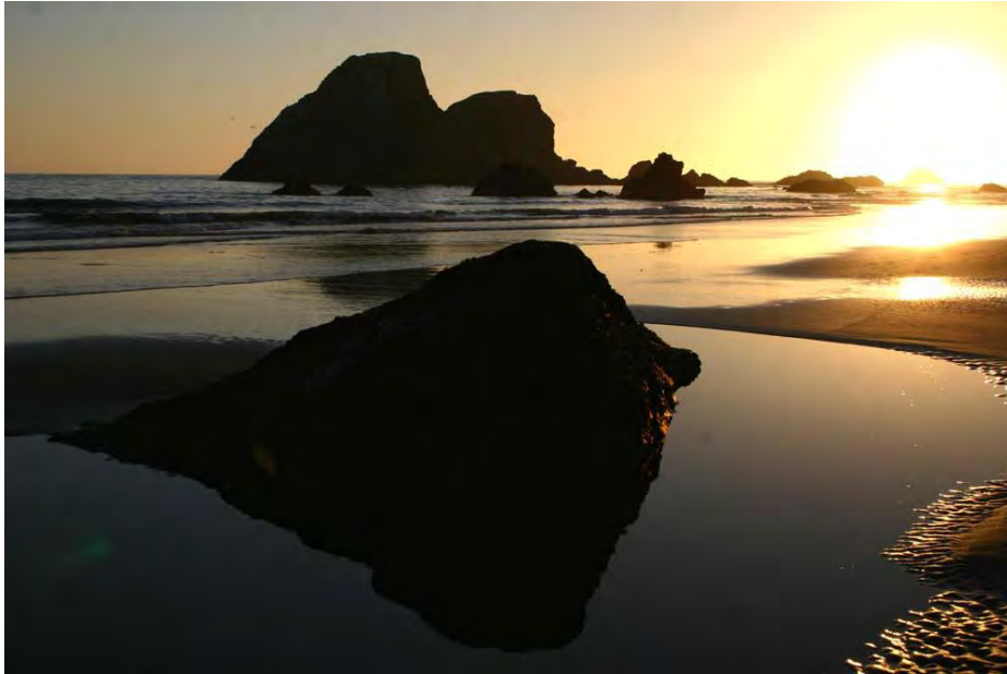
Sunset behind Camel Rock in Trinidad Bay (Humboldt County, CA)