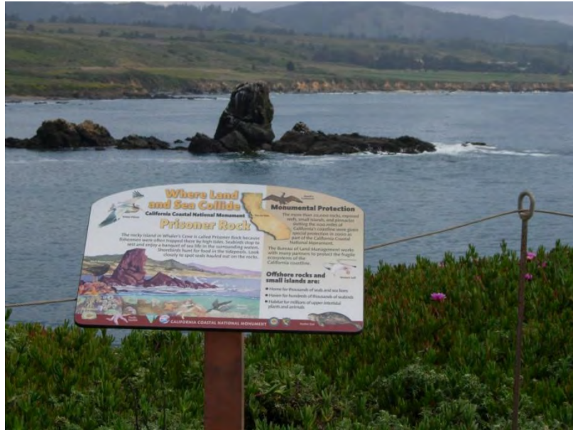
CCNM uses existing venues for interpretive signing as here at Whaler's Cove off Pigeon Point Light Station State Historic Park (San Mateo County, CA)...