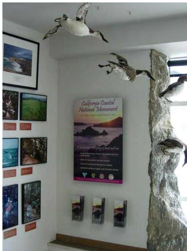
...and as "CCNM visitor contact stations," such as the Pacifica Chamber of Commerce (a CCNM Collaborative Partner) Visitor Center at Rockaway Beach in Pacifica, CA.