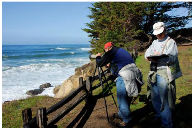
The Sea Ranch CCNM Stewardship Task Force “citizen scientists” and BLM biologists monitoring nesting cormorants (above) and other seabirds as part of an intensive monitoring program conducted primarily on donated time by a very dedicated group of “CCNM Stewards” (Sea Ranch, Sonoma County, CA)