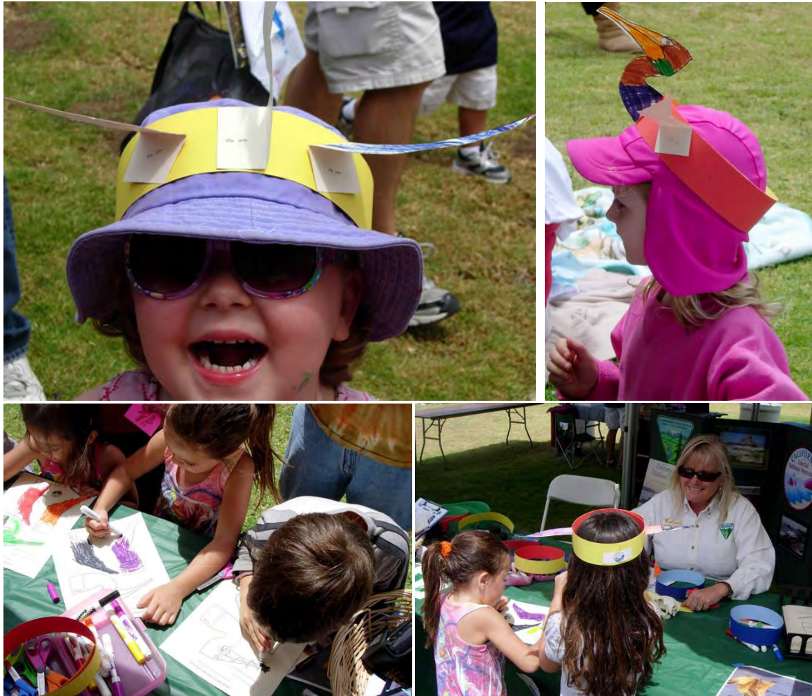
For the fourth year in a row, CCNM had a booth at the Monterey Bay National Marine Sanctuary's Coastal Discovery Fair held at Randolph Hearst Memorial State Beach in San Simeon on July 11, 2009. At the BLM booth, more than 100 kids colored, cut and assembled pelican headbands.