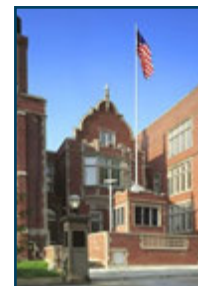
Carlos Rosario International Public Charter School promotes influenza vaccination in Washington, DC