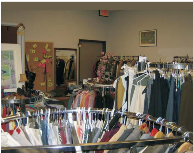
Clothes Closet at Sacramento Works Hillsdale One-Stop Career Center