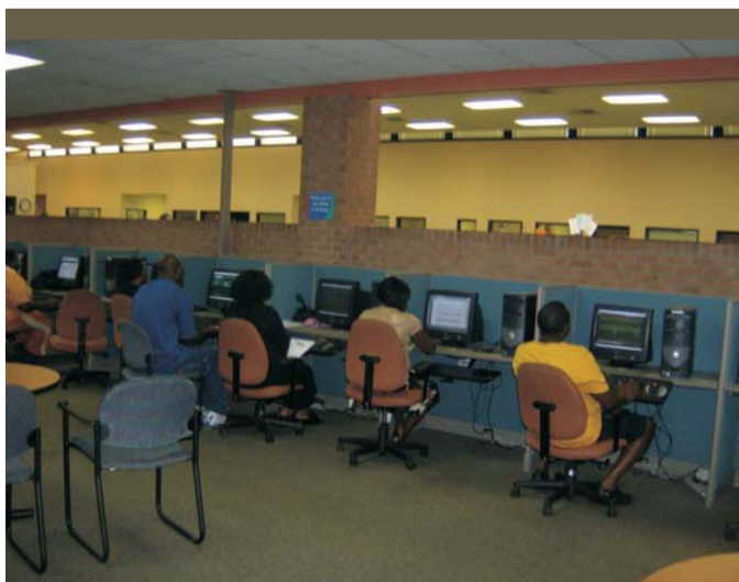
Resource Room at the One-Stop in the Macon Career Center

Rehabilitation Program provides on-site intake for referred clients, initial and comprehensive assessments, and referrals (such as to Goodwill Industries).