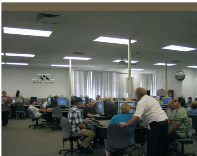
Resource Room at Modesto One-Stop Career Center

One-Stop Career Center. The TANF client may conduct their job searches at the Career Resource Center in the StanWORKS building or at the Modesto One-Stop Career Center. If the TANF client is not job-ready, their case manager will either send them to a job club (a class to teach individuals how to search and apply for a job, how to write a résumé, and skills for interviewing), assist them in entering training/education activities, or place them in an unpaid “community services program” where they can gain work experience and possibly become an employee.