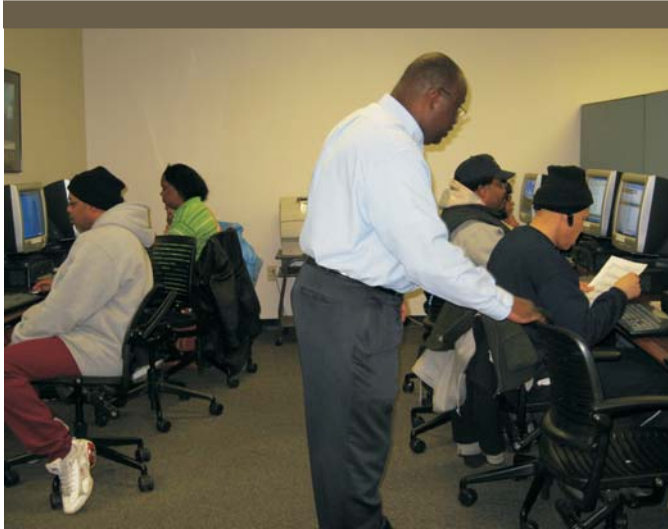
Staff Assisting Customers at North Oaks One-Stop Career Center

At North Oaks One-Stop Career Center, FSD staff members are on-site to conduct TANF intake, so individuals do not have to go to a separate location for their CAP assessment. People can receive the same TANF services at the One-Stop Career Centers that they would if they went to one of the FSD locations, but they also receive the employment component. The initial CAP visit includes an orientation to CAP, being entered into allowable work activities for TANF (unsubsidized employment, job search assistance, job readiness, high school-teens, occupational/vocational education training), and receiving transportation reimbursement expenses.