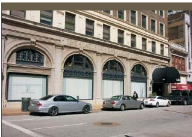
St. Louis Agency on Training and Employment (SLATE) One-Stop Career Center

The local WIB for years has had the goal of placing low-income clients in jobs with hourly wages that are realistic to support a household ($9.45/$9.55). Before the 2003 Executive Order, the Family Support Division collaborated with the Division of Workforce Development in the “Futures” program in St. Louis City whereby low-income individuals were trained for future jobs through the One-Stop Career Centers. The WIB chair described how he became involved with the WIA system when he was in human resources at the Marriott and assisted in the