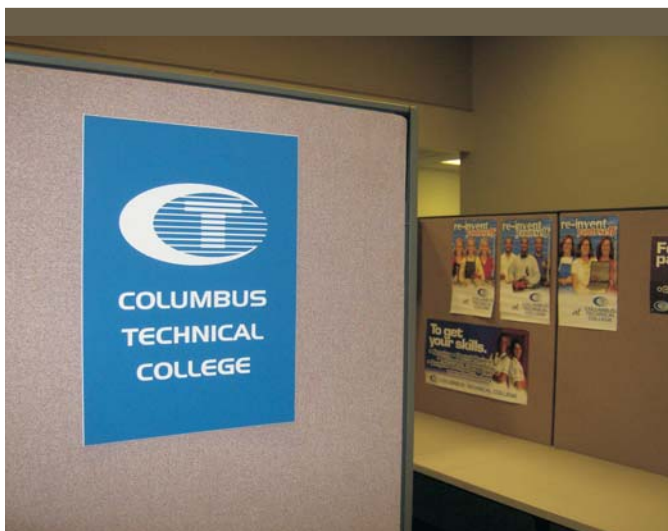
On-site Partner at the One-Stop in the Columbus Career Center