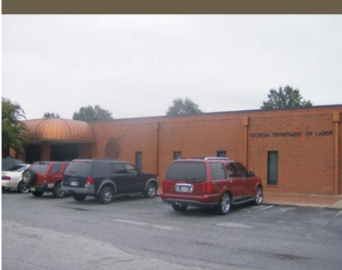
Columbus Career Center

stamps. In the past, the region had a vibrant textile industry. However, many of the textile businesses (Fieldcrest, Russell) began closing. As a result, the area has experienced an increase in the need for job retraining services to accommodate the displaced workers.