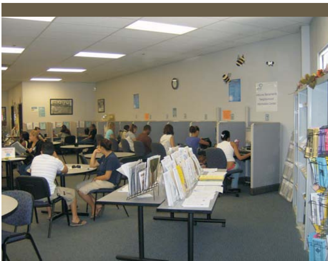
Resource Room at Sacramento Works Hillsdale One-Stop Career Center

Once an individual has applied for cash assistance at a county Department of Human Assistance (DHA) office and they have attended a Welfare-to-Work orientation, they are referred to a One-Stop Career Center to attend a job club or to conduct a job search. Over 20 percent of the clients at Sacramento Works' Hillsdale One-Stop Career Center are TANF recipients. If an individual walks in to a One-Stop Career Center and is found to be in need of TANF services, they are referred to a DHA office to apply for TANF. At the One-Stop Career Center, an employment specialist assesses new customers' employment skills utilizing various measurement tools such as WorkKeys, Quick Guide Skill Review (measure of reading and math levels), and Job Readiness Assessment. If a TANF recipient is determined to be ready for employment, they may receive on-the-job training opportunities and/or TANF Emergency Contingency Fund (ECF) subsidized employment. If the TANF recipient is not job ready, they attend a job club to learn soft or personal skills and have opportunities to enter adult education programs, technical training, computer skills classes, job coaching, and résumé preparation assistance.