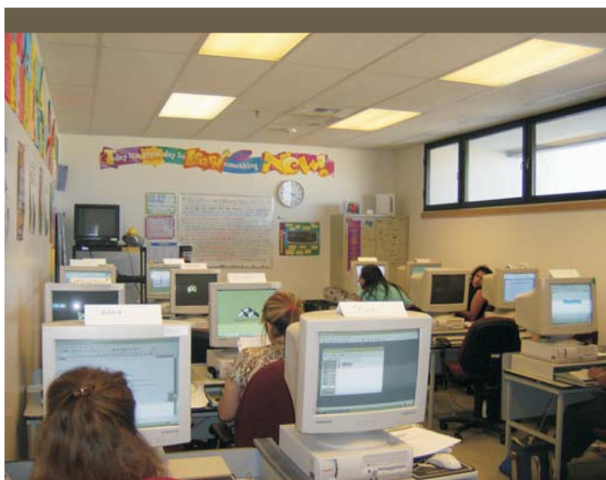
Workshop at Modesto One-Stop Career Center

Services for all customers, including TANF clients, at the Modesto One-Stop Career Center include a resource room with access to computers with job listings including CalJobs, register for JobMatch, access to fax machines, copy machines, printers, and telephones, résumé assistance, online job applications, workshops for résumé writing and interviewing skills, WorkKeys (job skills assessment) and Work Readiness certificates, typing tests and certifications, and intensive training. Customers can receive WIA intensive services at the Modesto One-Stop Career Center. These services include one-on-one assistance, career counseling, skill and aptitude tests, development of an individual employment plan, vocational training, and customized job searches. Customers can also apply for Unemployment Insurance in the same facility.