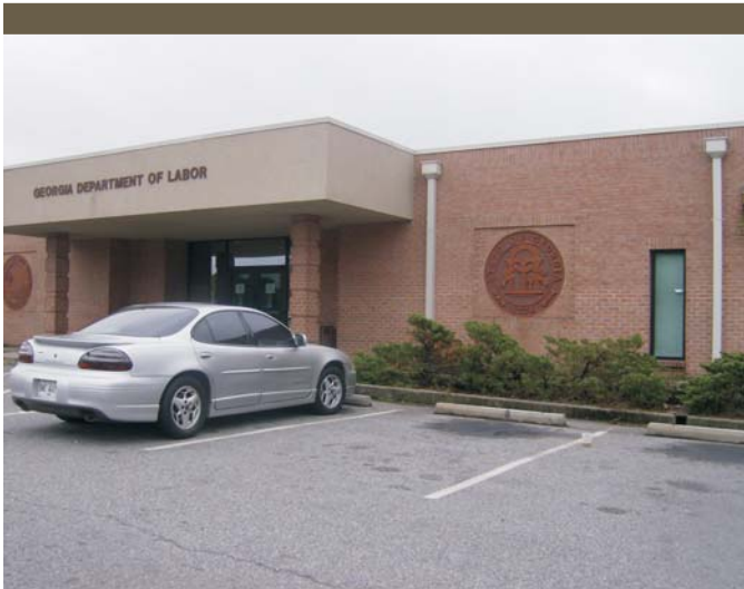
Macon Career Center

within Bibb County. The Mayor's Office of Workforce Development (MOWD) is the administrative entity for the local Workforce Investment Board and the operator of the One-Stop within the Career Center. DOL provides WIA core services, the MOWD provides WIA intensive services, and the Division of Rehabilitative Services provides vocational rehabilitation.