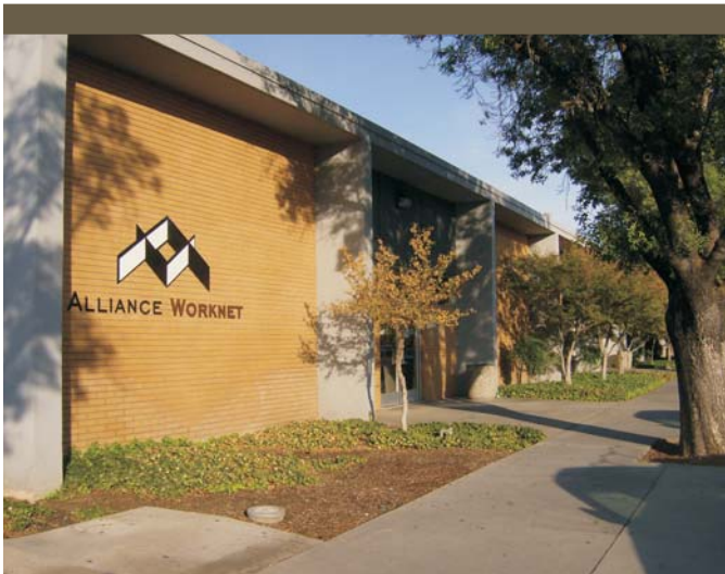
Alliance WorkNet Modesto One-Stop Career Center

served in the Stanislaus County Local Workforce Investment Area were TANF clients. The local WIA has a 77.1 percent rate of clients entering employment. The county exhibits a higher than national average rate of unemployment and poverty. Particularly significant is the 26.2 percent of adults over the age of 25 within the county that do not have a high school diploma, compared to the 15.4 percent national average. The largest urban area in Stanislaus County is Modesto. Similar to the county trend, Modesto characteristics include higher than national average levels of unemployment and poverty, and a significantly higher percent of adults without a high school diploma.