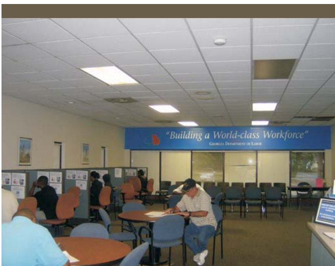
Resource Room at the One-Stop in the Columbus Career Center

The DFCS staff on-site conduct eligibility determination for the welfare-to-work program, provide information and applications for food stamps, and other relevant work programs for low-income/TANF clients. All customers of the Career Center may obtain employment information, career counseling, explore training and education opportunities, conduct job searches, get