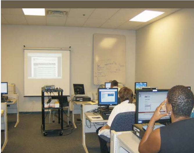
Workshop at Sacramento Works Hillsdale One-Stop Career Center