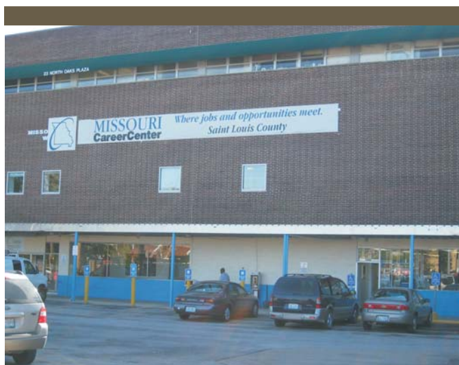
North Oaks One-Stop Career Center

Low-income populations have been served at the North Oaks One-Stop Career Center since its inception in 2000. As was the case with the SLATE center, the governor’s Executive Order that put the work requirement of TANF within the Division of Workforce Development responsibilities led to Career Assistance Program staff being located in North Oaks One-Stop Career Center. The North Oaks WIB chair describes the One-Stop Career Center as operating on a “comprehensive customer service” approach, so that all the services a low-income client would need should be found in one location. The issuance of the governor’s Executive Order served to underscore, rather than significantly change, the local WIA work plan since the focus had previously