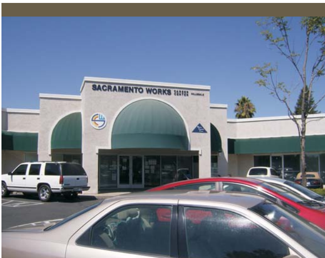
Sacramento Works Hillsdale One-Stop Career Center

Sacramento Works is the operator of twelve One-Stop Career Centers within the city/county consortium WIB. Sacramento city and county joined to form SETA, which functions as the local WIB. All, but one, of the twelve one-stops are full service, comprehensive Career Centers. In their local WIA plan, SETA reports that TANF case loads are highly concentrated in downtown, South Sacramento, Oak Park, Meadowview, North Sacramento, and Rancho Cordova. The Hillsdale One-Stop Career Center was identified as a location serving a high number of TANF clients.