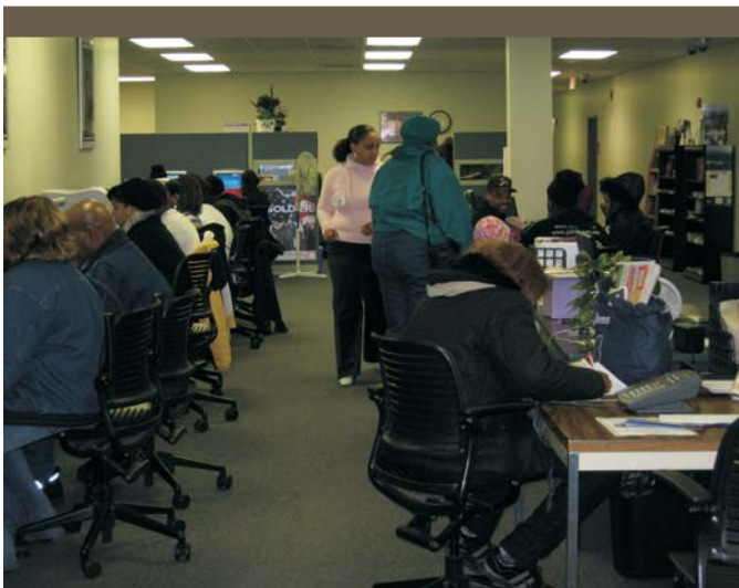
Resource Room at North Oaks One-Stop Career Center