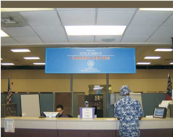
Intake at Columbus Career Center

registers the customer with the Career Center and assesses them for job skills and work experience. If needed, they are referred to the WIA intensive services unit on-site at the Career Center for job training. This unit works with long-term unemployed and hard-to-employ individuals. When the GoodWorks program was fully operational in Columbus, such individuals would attend workshops that led to an intensive job search plan. However, the GoodWorks program in Muscogee County only had the capacity to serve about eight individuals in 2007-2008. Now, the Division of Family and Children Services contracts with outside service providers for job training and education services.