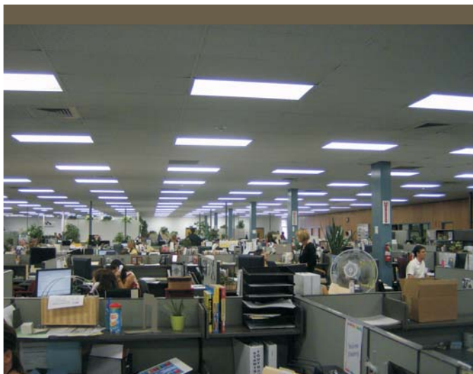
EDD and Alliance WorkNet at Modesto One-Stop Career Center