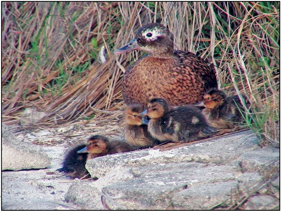
Female Laysan Duck with chicks