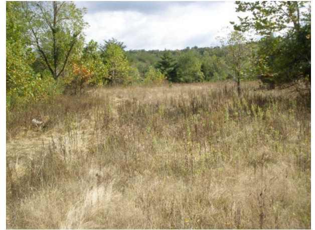
View of southern portion of Tincher Openings following the initial herbicide application to prepare the area for fall 2011 native seeding with seed drill.