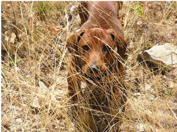
Figure 2. Its always good to have a faithful companion for a weekend native seed reconnaissance trip