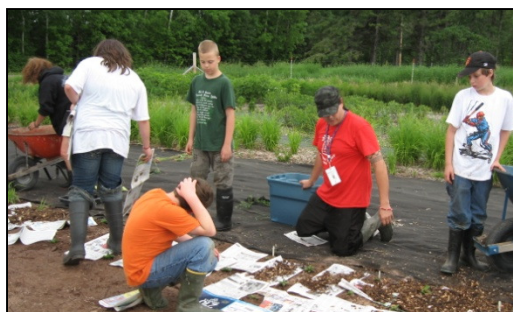
Figure 3. National Public Lands Day Volunteers weed orchard Sept. 24, 2011.

Figures 1-2. Students and UW-Extension Certified Master Gardeners planted over 1,000 native plants in 2011.