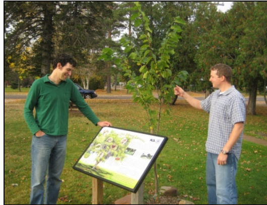
Figure 1. Washburn Ranger District staff proudly display new elm exhibit and Princeton elm tree.

In 2011, the Chequamegon-Nicolet National Forest purchased frames and installed elm wayside exhibits at the Northern Great Lakes Visitor Center, Washburn Ranger District and Wild Rivers Interpretive Center. These exhibits are located at visible sites with moderate to heavy visitation.