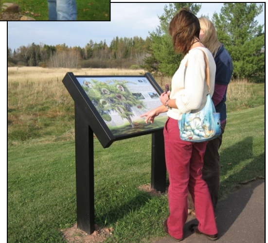
Figure 2. Visitors view elm wayside exhibit at the Northern Great Lakes Visitor Center in Ashland, Wisconsin.