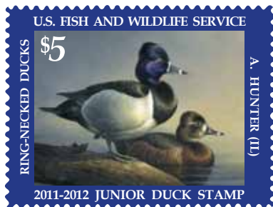
Federal Junior Duck Stamp