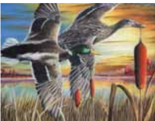
Indiana Junior Duck Stamp Program Best of Show by Azucena Monge