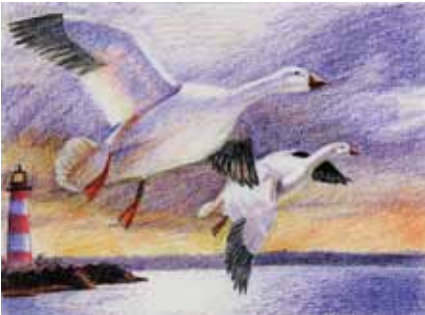
This is improper use of the 2004 Duck Stamp as a reference. This is a copy of the 2004 Federal Duck Stamp and would be disqualified.