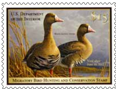
Federal Conservation Duck Stamp