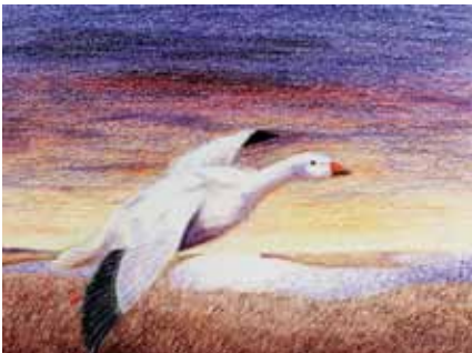
This is proper use of the 2004 Duck Stamp as a reference. Study the differences between the stamp and this drawing. The snow goose is featured in a different angle of flight. Additional features in the stamp, such as the lighthouse have been omitted.