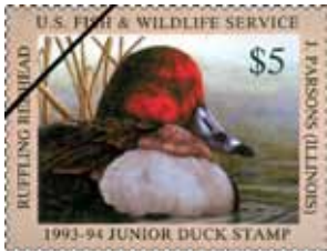
1993-94 The First Junior Duck Stamp