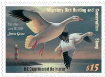
Visual Reference 2004 Federal Hunting and Conservation Duck Stamp