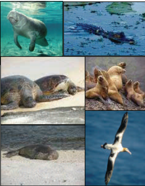
Some of the threatened and endangered species protected by marine National Wildlife Refuges. Clockwise from top left: Florida manatee; American crocodile; Stellar sea lions; Short-tailed albatross; Hawaiian monk seal; and Green sea turtles.