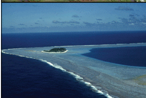
National Wildlife Refuge System Marine Refuges, location, and year designated. From top to bottom: Palmyra Atoll NWR, Remote Pacific (2001); Oregon Islands NWR, Oregon (1935); Chincoteague NWR, Virginia (1943); J. N. "Ding" Darling NWR, Florida (1945); Rose Atoll NWR, Remote Pacific (1973).