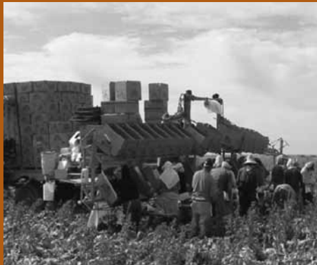
Cal/OSHA intensified enforcement of the heat illness standard during the summer months by increasing targeted inspections of industries with outdoor employment.

The Cal/OSHA Process Safety Management Units proactively initiated a California Emphasis Program (CEP) on April 14, 2010, under which Program Quality Verifications (PQV) were conducted on 11 out of 12 California petroleum refineries to examine each refiner's procedures and practices for identifying and mitigating corrosion damage known to be produced in the NHT process environment. The PQV focused on the NHT process units in