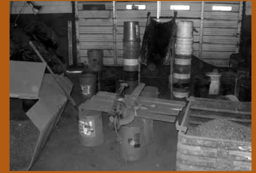
Welch Group Environmental: The Chute System.

North American Midway Entertainment: On October 11, 2010, South Carolina OSHA responded to a worker fatality at North American Midway Entertainment.