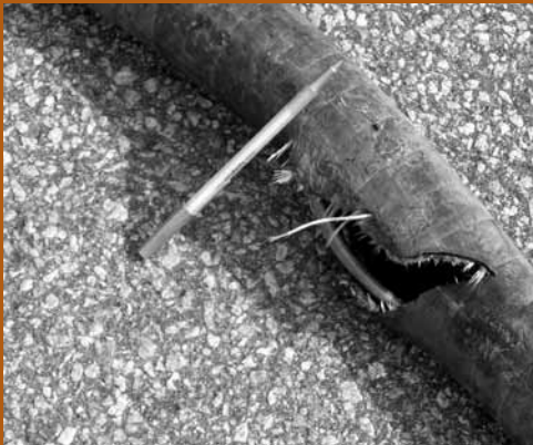
A transfer hose burst, releasing a heavily concentrated cloud of ammonia gas.

Tanner Industries is covered under OSHA's Process Safety Management (PSM) standard due to the amount of anhydrous ammonia used in their process. It was determined that Tanner had not completed a Process Hazard analysis nor had they developed Standard Operating Procedures for the ammonia transfer process.