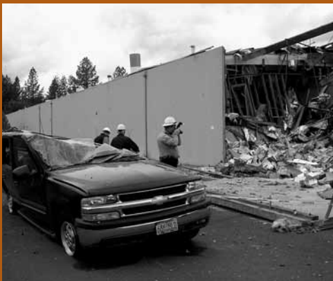
A blast at the Nosler ammunitions plant destroyed 10 percent of the facility.