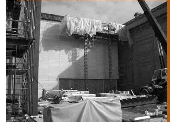
A Davenport Masonry employee fell to his death while working from this scaffolding.

As part of the agreement, Davenport Masonry was eligible for dismissal of the felony charges if the company was not cited for a similar scaffolding violation or another willful violation of a MIOSHA construction standard during the 12-month period, and all other terms and conditions were satisfied. On December 15, 2011, following confirmation by MIOSHA of the company's compliance with the agreement, the Michigan Attorney General and Davenport Masonry jointly moved the court for dismissal of the criminal charges.