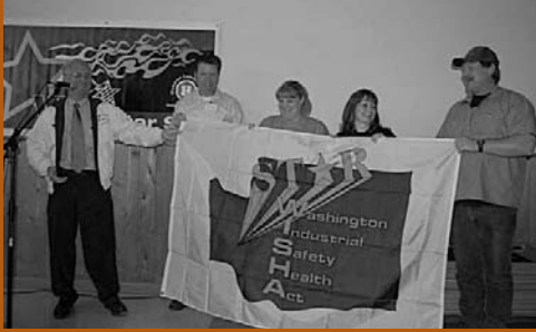
The Hampton Mills VPP celebration was held on May 13, 2010.