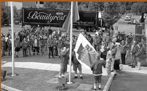
The Simmons VPP celebration was held on September 1, 2010.

Governor's Industrial Safety and Health Conference: Washington's 60th annual Governor's Industrial Safety and Health Conference was held on September 28-29, 2011, at the Tacoma Convention Center. This year the 1,500 attendee conference offered two days of training and education, special recognition of 100 years of the Worker's Compensation Act and had over 80 exhibitors providing the latest tools, technologies, and strategies for workplace safety and health.