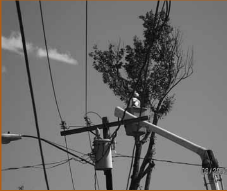
On August 29, 2011, CONN-OSHA offered assistance in the aftermath of Tropical Storm Irene.

CONN-OSHA responded to a double fatality involving firefighters for the Bridgeport Fire Department. CONN-OSHA issued five serious violations. Currently, one of the violations is being contested by the City of Bridgeport.