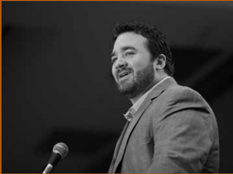
Indianapolis Colts Center Jeff Saturday addressed the 2011 Indiana Safety and Health Conference and Expo and spoke about worker safety and health from a professional athlete's perspective.