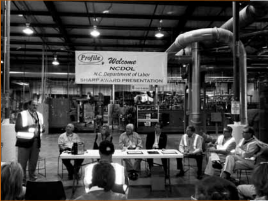
Profile Products, LLC of Conover, North Carolina received the SHARP Award and Flag at a ceremony at their facility on April 23, 2010.

The OSH Division's Standards Section answered 5,322 public inquiries by phone or written correspondence and provided technical assistance in two instances for employers and employees in the state. Standards also reviewed and adopted rules clarifying and specifying safety and training requirements for all workers.