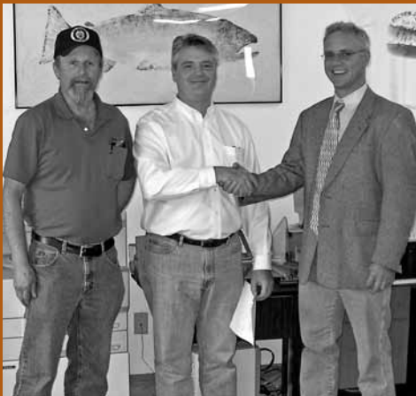
AKOSH Signing ceremony with Trident Seafoods, Inc.

In addition to outreach efforts, seafood processing establishments are a strategic target for enforcement inspections over the next five years as of 2009.