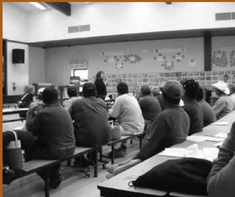
Enforcement efforts were complimented by training sessions for both supervisors and workers that detailed the elements of the Heat Illness Prevention Program.