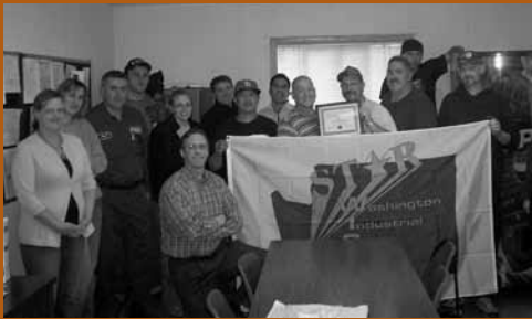
The PSC (Burlington Environmental) VPP celebration was held on May 27, 2010.