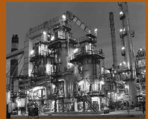
The Cal/OSHA Process Safety Management Units proactively initiated a California Emphasis Program (CEP) on April 14, 2010, on the refinery industry.

Cal/OSHA's Process Safety Management Unit is the only PSM unit in the nation dedicated to oversight of refineries and other operations handling large volumes of chemicals and was created in the aftermath of a 1999 settlement with the Tosco Corporation, which operated a refinery in California where an explosion killed four workers. In the 11 years since the PSM Unit was created, there have been three worker fatalities at refineries in California. The PSM Unit also regulates ammonia refrigeration and chlorine facilities, alcohol and beverage manufacturer's chemical plants, and explosive manufacturers, among other industries.