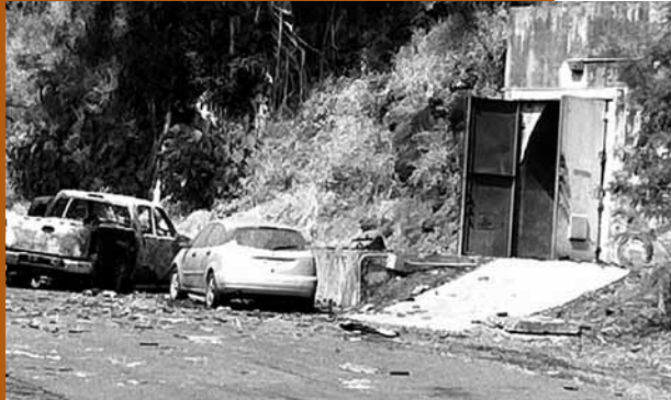
This is the entrance to the bunker where fireworks were stored and the explosion occurred.

On April 8, 2011, an explosion at a storage bunker used to store contraband class 1.3G fireworks seized by the Bureau of Alcohol, Tobacco, and Firearms, claimed the lives of five workers and injured another.