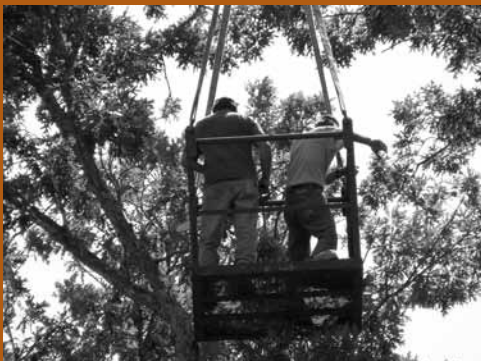
Tree Trimming Operations Employees being lifted in an unauthorized basket.

While enforcing the Virginia unique Overhead High Voltage Power Lines (OHVPL) standard remains an important emphasis program, in the last year we have stressed compliance with the new Virginia unique standard on Reverse Signal Operation Safety Requirements for Motor Vehicles, Machinery and Equipment in General Industry and the Construction Industry, 16VAC25-97, and the new Tree Trimming Operations standard, 16VAC25-73, to ensure the maximum knowledge and compliance with these important programs. Enforcement of the new Tree Trimming Operations standard, 16VAC25-73, has had a significant impact on the arborist industry. Virginia continues with other local emphasis inspection programs to address the major causes of fatal and serious non-fatal accidents in the following areas: fall hazards in construction; scaffolding; heavy construction equipment, lumber and wood products; waste water and water treatment facilities; and use of workers' compensation accident reports to identify specific occurrences such as amputations, serious chemical exposures, etc. Virginia participates in the following National Emphasis Programs (NEPs) : amputations; lead; combustible dust; crystalline silica; and trenching and excavation. Thus far, VOSH has conducted 871 emphasis program-related inspections in the Commonwealth.