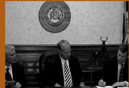
Signing of Wyoming Oil and Gas Industry Safety Alliance agreement, with Wyoming Governor Matthew H. Mead in the middle.

Oil and Gas Drilling and Servicing Training: We have been working with private companies to provide hands-on experience for our own compliance officers and consultants. We have expanded this opportunity to compliance/consultation programs from other states within our region in an effort to address the expanding oil play across state borders.