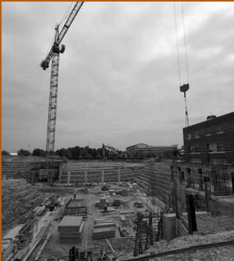
Pioneer Construction signed a partnership to protect workers at Grand Valley State University.