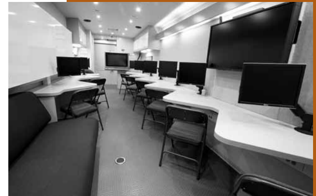
KYOSH IMPACT is a state-of-the-art multi-purpose incident response/outreach motor coach.