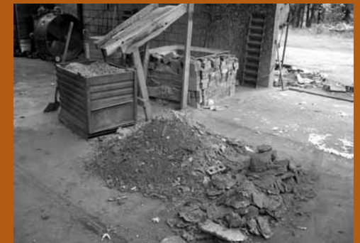
Welch Group Environmental: The Melting Operation.