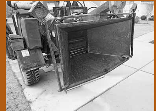
A 14-year-old boy was fatally injured after being pulled into this chipper.

As a result of the investigation, the VOSH Program issued two willful and 12 serious violations and $185,500 in penalties. Criminal charges were also filed for child endangerment and a criminal willful violation of VOSH regulations. The employer pled guilty to the criminal willful violation. The civil case is still pending.