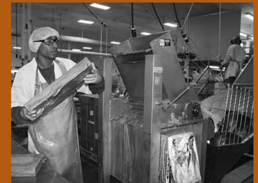
2011 Workplace Safety & Health Calendar: To protect employees, Trident Seafoods’ Pier 91 facility makes sure cutting and chopping machines are well guarded.