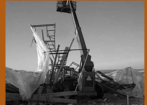
A Grand Traverse Construction employee was struck and killed by this scaffolding that overturned due to high winds.

Posen Construction: On June 6, 2011, the Construction Safety and Health Division issued three Willful violations, three Repeat Serious violations, and five Serious violations to Posen Construction for alleged safety hazards with total penalties of $199,200. On Dec. 23, 2010, three employees placed concrete in the bottom of a wet well and left a propane torch device running overnight to dry the concrete. The torch went out and filled the confined space with propane gas. At about 8:00 a.m. the employees attempted to relight the heater and an explosion occurred. All three employees suffered burns and were transported to a hospital.