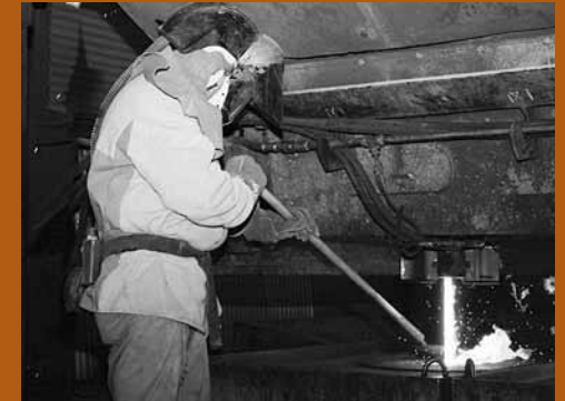
2011 Workplace Safety & Health Calendar: This worker at NuCor Steel in Seattle wears protective gear that includes flame-resistant clothing and a full-face respirator with a powered air filter.

2012 Job Safety & Health Calendar: For the 6th year, Washington has developed a 2012 Workplace Safety and Health Calendar containing weekly safety tips. Local businesses throughout the state were visited to take photos of actual workers doing their jobs in various industries. http://www.lni.wa.gov/IPUB/417-231-000.pdf