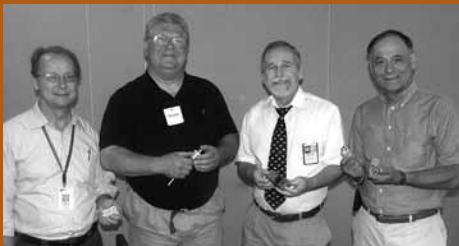
On July 19, 2011, four CONN-OSHA instructors presented information during the 100th Breakfast Roundtable meeting.