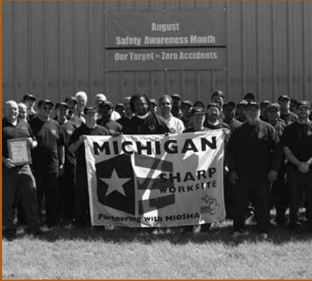
Siemens Industry Metallurgical Services in Benton Harbor Received the Michigan SHARP Award.