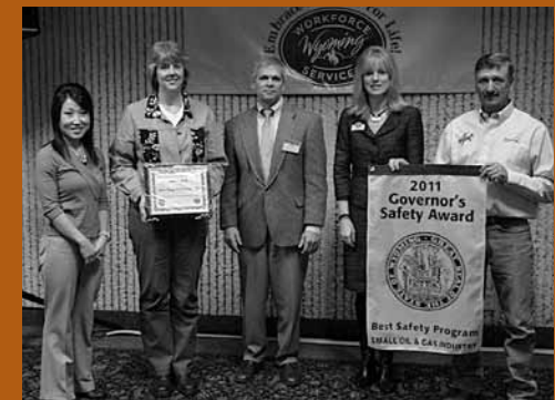
During the Governor's Safety Awards Conference, awards were presented to 10 companies with outstanding safety and health programs.