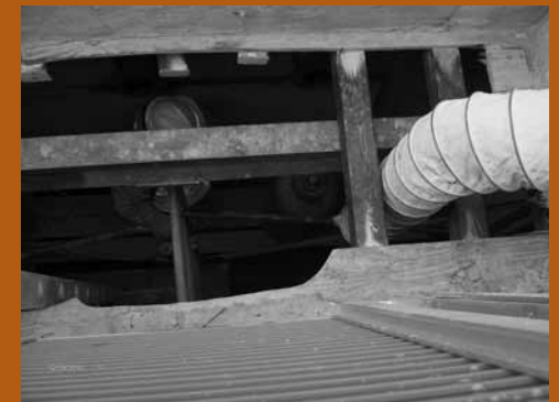
An explosion occurred at the bottom of this wet well, injuring three Posen employees.