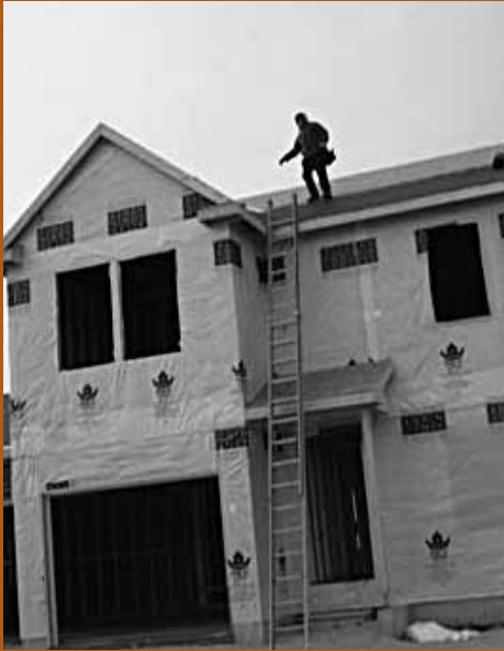
The number one cause of death and serious injury at residential construction sites is falls.