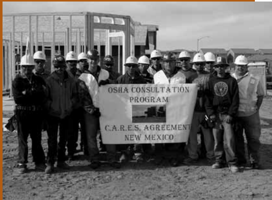
New member of Construction Agreement for Residential Employee Safety (CARES).