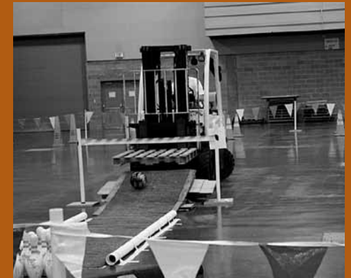
The Columbia Forklift Challenge debuted at the Oregon GOSH conference, where operators negotiated tight turns, stacked pallets and containers, and went bowling.

Historically, there has been high demand for training from businesses that employ Spanish-speaking workers. Oregon OSHA offers a number of materials in Spanish as part of its PESO program. The program includes 17