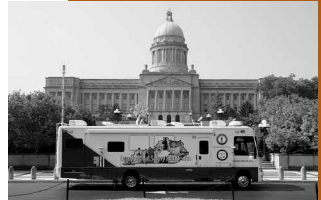
KYOSH IMPACT is used for outreach as well as strategic enforcement efforts.

Labor Cabinet Regional Seminars: In an effort to keep citizens abreast of the services offered by the Kentucky Labor Cabinet, the Cabinet hosted a series of six multi-day seminars across the Commonwealth during the summer of 2010. The seminars showcased all of the Cabinet’s agencies and was developed for employers, employee organizations, public works projects, workforce development, workforce education, and registered apprenticeship programs. The Division of Compliance and the Division of Education and Training provided attendees with detailed presentations of their many-faceted services as well as explanations of various statutory and regulatory mandates. The seminars were well received and attended by over 600 participants.