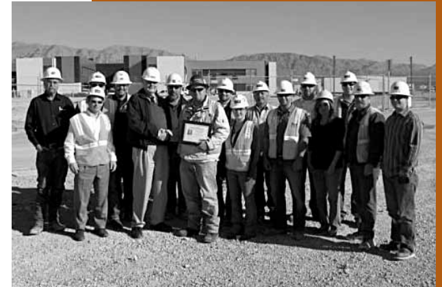
Clark Construction LLC received with the first ever Construction SHARP award.

Private Schools: Per Nevada Revised Statute (NRS) 394.245 a private school is required to have a health and safety inspection every two years to ensure it is operating in accordance with laws, regulations, and ordinances relating to