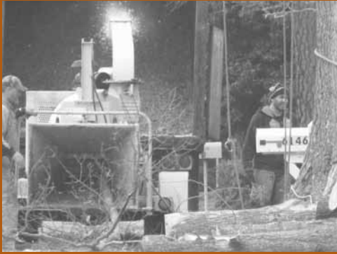
Tree Trimming Operations in Virginia Employees without proper PPE or training.

In 2011, Virginia promulgated a new comprehensive regulation entitled Tree Trimming Operations , 16VAC25-73, to reduce and eliminate employee injuries and fatalities in non-logging, arborist/tree trimming and cutting operations on residential and commercial work sites. The Tree Trimming Industry approached the Department about the possibility of adopting a comprehensive regulation addressing tree trimming in 2001. The Industry requested a regulation based on then current ANSI Z133.1-2000. Discussions with the Department resulted in a commitment from the Industry to make significant changes to the ANSI standard which culminated in the adoption of the revised ANSI Z133.1-2006.