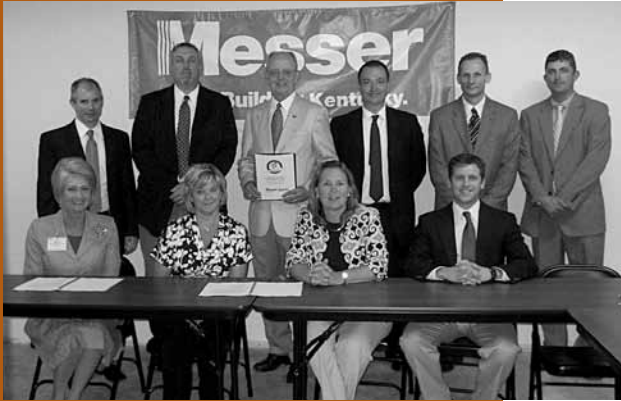
Messer Construction, Pikeville Medical Center and the Labor Cabinet signed a partnership to protect workers during the construction of an expansion to the Center.

Construction Partnership Program (CPP): Kentucky continues to add to the CCP as previous partnership sites are brought to successful conclusions. Two exciting new additions are “tri” partnerships. The first is a partnership with Jenkins-Essex, the City of Elizabethtown, and the Labor Cabinet. Jenkins-Essex is constructing a $29,000,000 sports park for the City of Elizabethtown, and the city wanted to collaborate in the project.