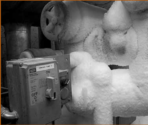
Excessive ice build up on valves was a PSM violation at Select Onion.