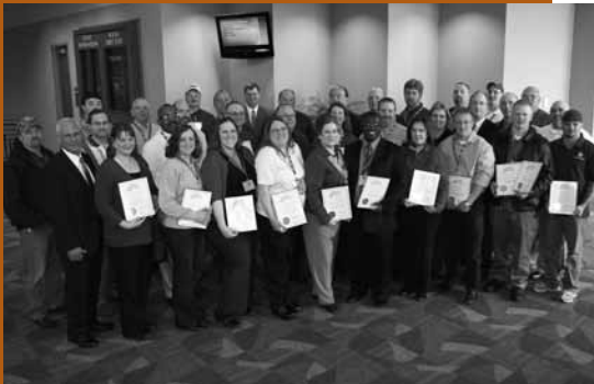
MTI Graduates recognized at the 2011 Michigan Safety Conference.