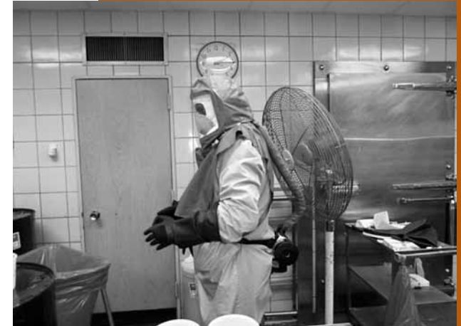
A MOSH Industrial Hygienist conducts formaldehyde sampling at a local hospital.

New compliance officers: In late April 2010, MOSH welcomed seven new compliance officers, four of which made it through the probationary period. The new CSHOs finished their formal training in April 2011. In March 2011, MOSH welcomed another trainee class consisting of six safety compliance officers, one compliance hygienist, one safety consultant, and one industrial hygienist consultant. These new CSHOs will go through our rigorous training program and then be assigned to Regions.