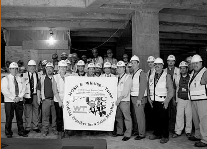
MOSH Commissioner and Assistant Commissioner at a signing ceremony for a new CCP partnership.

2009 was a record year for MOSH injury and illness statistics. Based on the Survey of Occupational Injuries and Illnesses, a cooperative program between the State of Maryland's Division of Labor and Industry and the U.S. Department of Labor's Bureau of Labor Statistics, Maryland's private sector total recordable case (TRC) rate was, for the second year in a row, at an all time low of 3.3 injury and illness cases per 100 equivalent full-time workers. This represents a decline of slightly over two-thirds (68%) from the series high of 10.6 recorded in 1972. Private sector construction's TRC rate declined three percent from 3.9 cases reported in 2008 to 3.8 in 2009 and was also the lowest rate on record for this industry sector in Maryland since the survey program's inception in the early 1970s.