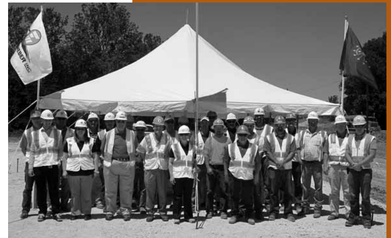
The Indiana Departments of Labor and Transportation signed a strategic partnership with Missouri-based Fred Weber, Inc. covering the construction of an 11-mile stretch of Interstate 69 in southwest Indiana.

In June 2011, the Indiana Department of Labor, Indiana Department of Transportation and Maryland Heights, Missouri-based Fred Weber, Inc. teamed up for a site-specific safety partnership for the Interstate 69 project. The project includes an 11-mile stretch of highway and the construction of more than two dozen bridges. This agreement marks the first infrastructure partnership for the Indiana Department of Labor. The partnership emphasizes fall protection above any surface six feet or greater from the ground level. It also stresses the importance of the construction industry emphasis four hazards.