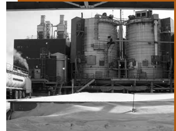
Processing facilities at the Kuparuk Oil and Gas Field VPP Site.