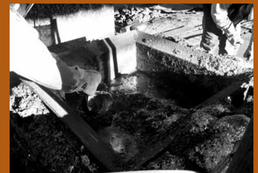
Welch Group Environmental: Removing lead from the crucible by a one gallon paint bucket.