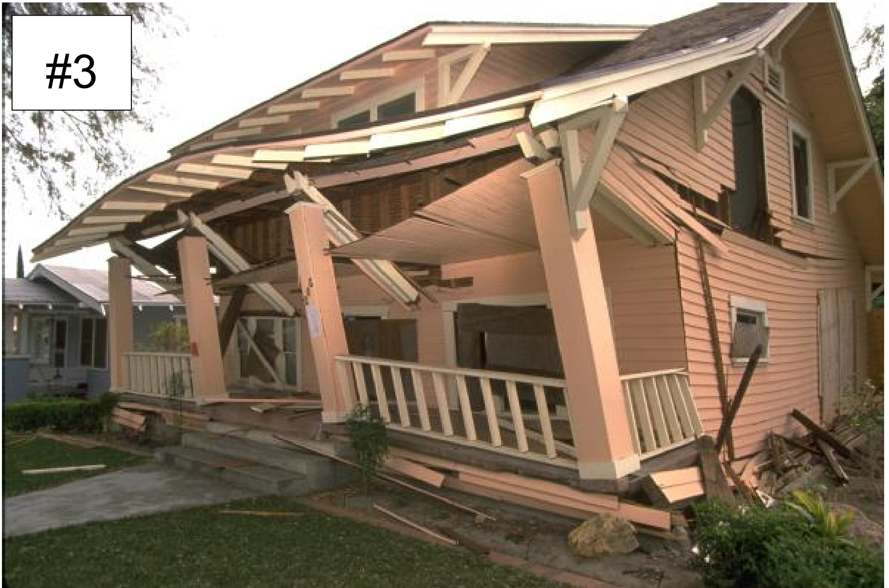
Sizeup Photo #3