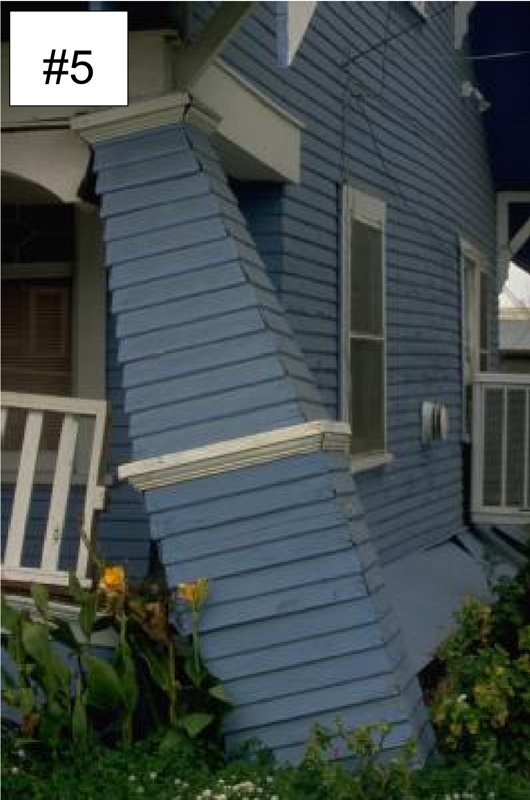
Sizeup Photo #5