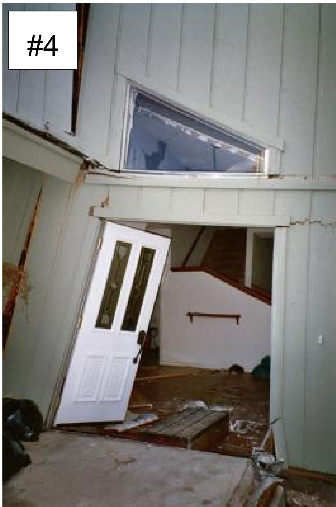
Sizeup Photo #4