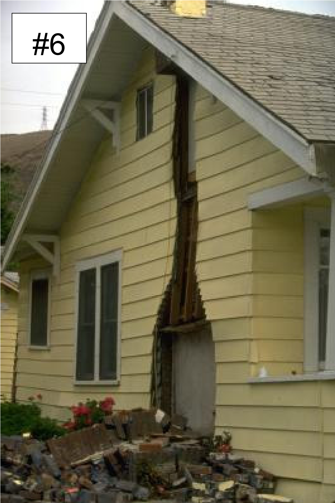
Sizeup Photo #6