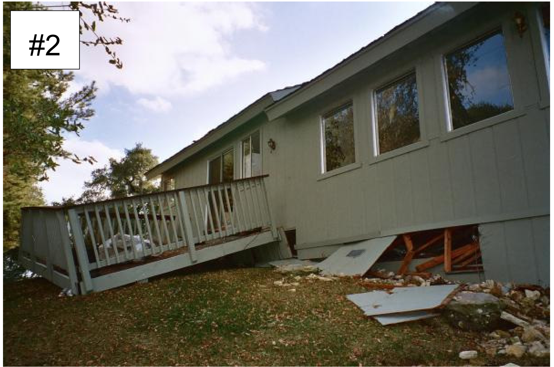
Sizeup Photo #2