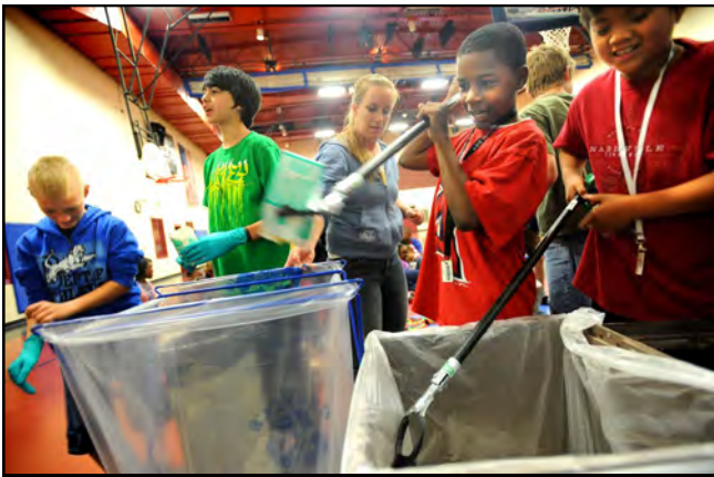
Teens brave their way through a trash audit at the Teen Zone as JBLM sustainability outreach coordinator, looks on. The teens were learning about the benefits of waste reduction. Other activities included Recycling Jeopardy and a video on the Great Ocean Garbage Patches.