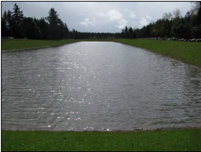
JBLM Stormwater filtration system is a collaborative project between the Water Quality Team and the Products and Materials Management Team.

The centralized stormwater filtration system ties elements of the community, environment and mission together. The facility provides interpretive opportunities, including a wetlands education center, increased habitat for wildlife