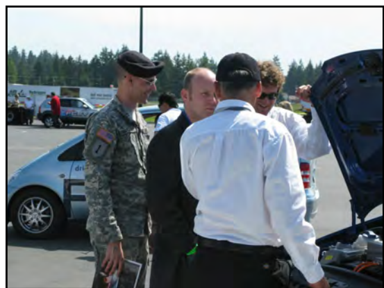
The June 2009 West Coast Hydrogen Road Tour (from California to British Columbia) stopped at JBLM. Soldiers, family members, retirees, government employees and one State Representative test drove 12 hydrogen fuel cell vehicles and talked with Tour Experts.