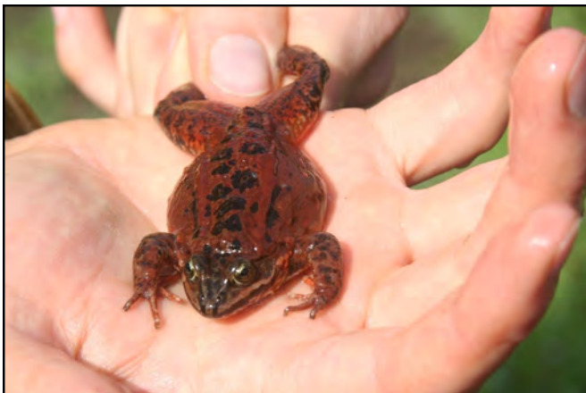
Over 1,300 Oregon spotted frogs were released in October 2010. This project is the result of partnerships between JBLM, Evergreen State College, Department of Corrections, The Nature Conservancy and local zoos.

JBLM purchases a significant amount of Renewable Energy Certificates (green tags), and was reported as #6 on the EPA’s “Top 10 Federal Government” Green Power Partners List published January 5, 2011.