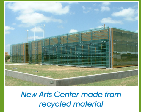
New Arts Center made from recycled material

Greensburg's progress toward realizing its goal of becoming "the greenest town in