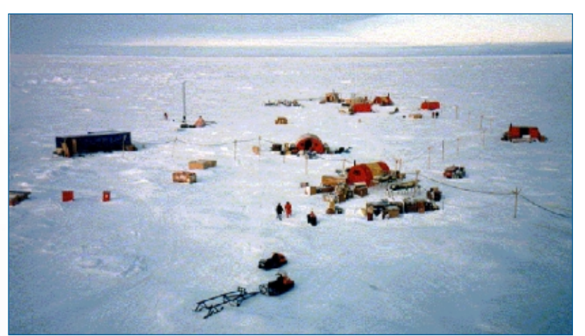
The Surface Heat Budget of the Arctic (SHEBA) experiment in Barrow, Alaska, used data collected by the ground-based radiation observations from the Atmospheric Emitted Radiance Interferometer (AERI).