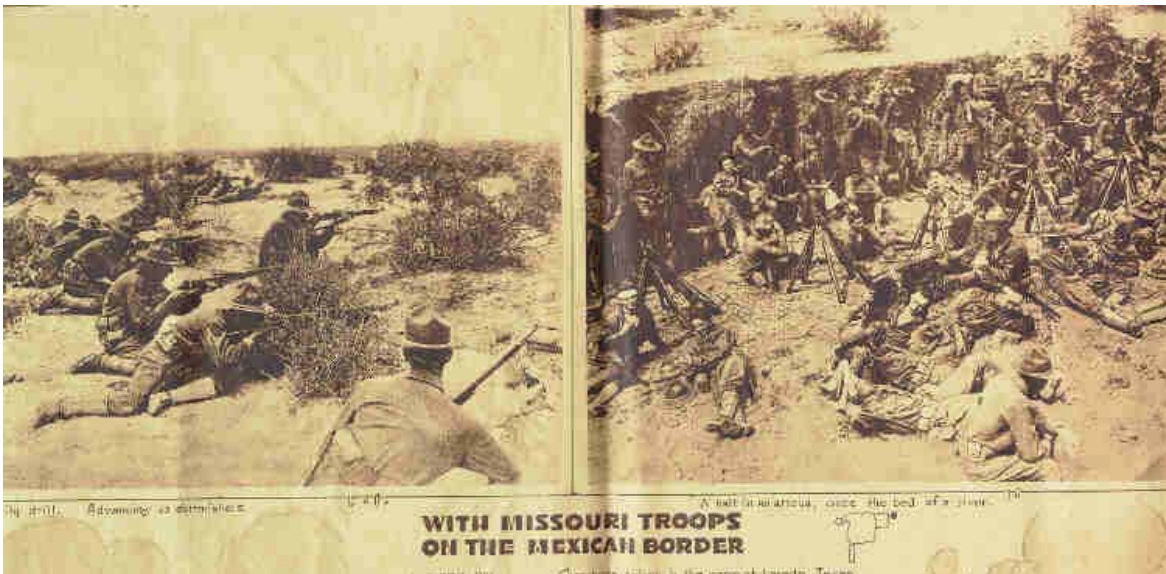
Clipping from the Saint Louis Post-Dispatch Rotogravure Picture Section, August 6, 1916. Troops from the MO. National Guard participated in the Punitive Expedition into Mexico in 1916