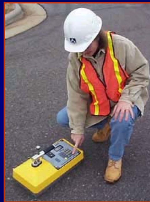
Road Paving (portable)