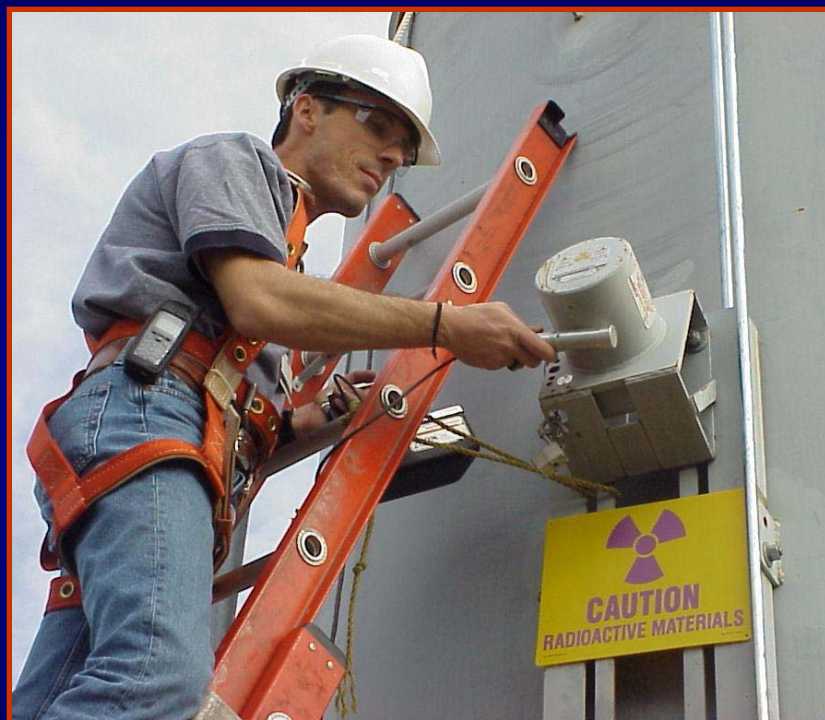
Process Control (fixed)