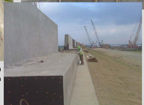
Ongoing construction in St. Bernard Parish