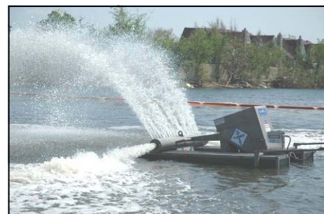
Environmental scientists with the Corps of Engineers set up aerator pumps at the 17th Street Canal on September 20, 2005, shortly after Hurricane Katrina flooded the area. Aerator pumps filtered the flood waters and removed many of the pollutants.

www.hq.usace.army.mil/cepa/envprinciples.htm