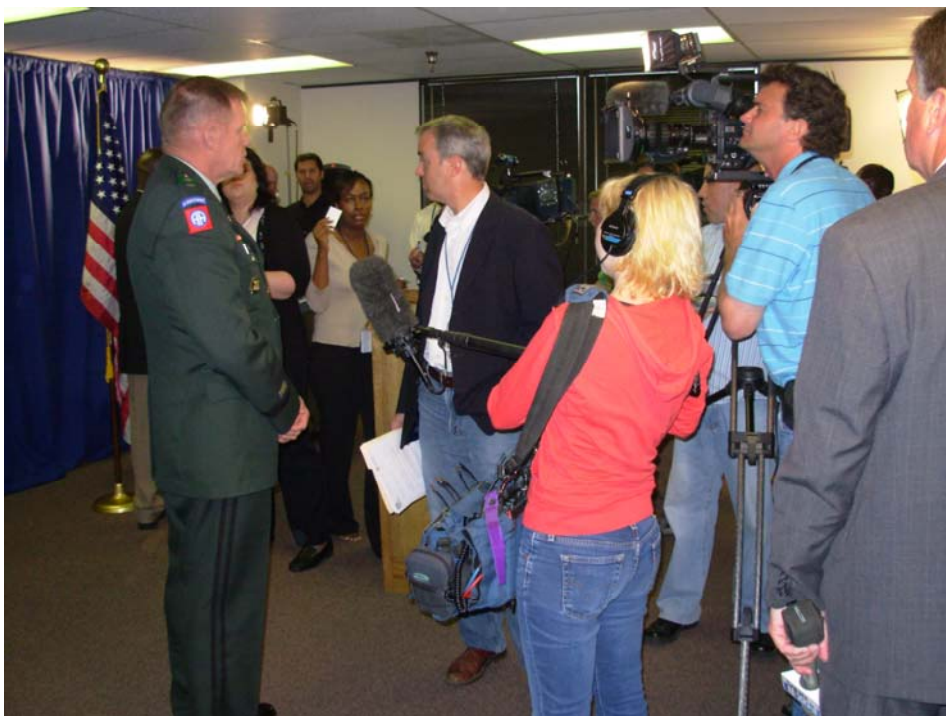
Prior to the 2006 hurricane season, Lt. Gen. Carl Strock, Commander of the U.S. Army Corps of Engineers and Chief of Engineers, gives the media an update on Corps readiness.

The newly-formed Joint Communication Advisory Council (JCAC) will provide the public with coordinated, interagency information on public safety in advance of the 2007 hurricane season.