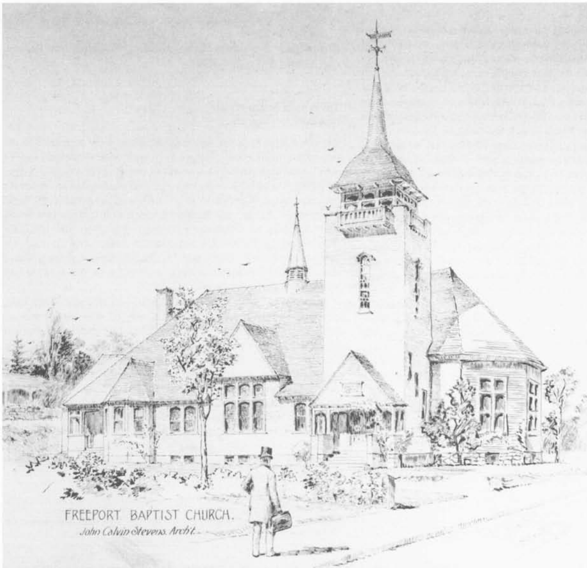
Freeport Baptist Church, Freeport, ME, 1896. One of many churches designed by the John Calvin Stevens firm.