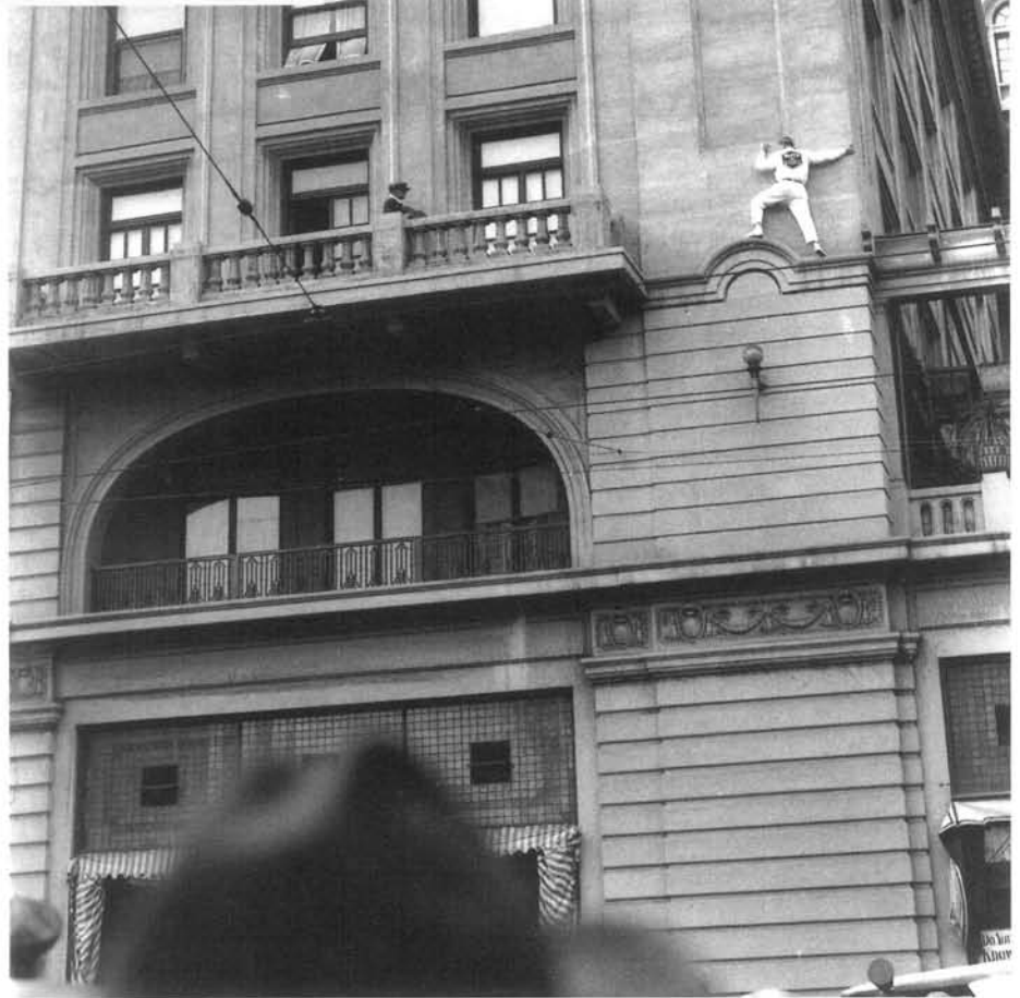
Human fly scaling wall of U.S. Grant Hotel, Broadway, San Diego, ca. 1920s.

By the end of the 1970s, the collection had grown to 150,000 images. In 1978, recognizing an increased need for care and a lessening of company support after the Forward family sold Union Title, the Booths helped move the collection to the San Diego Historical Society. At the Society, the Booths