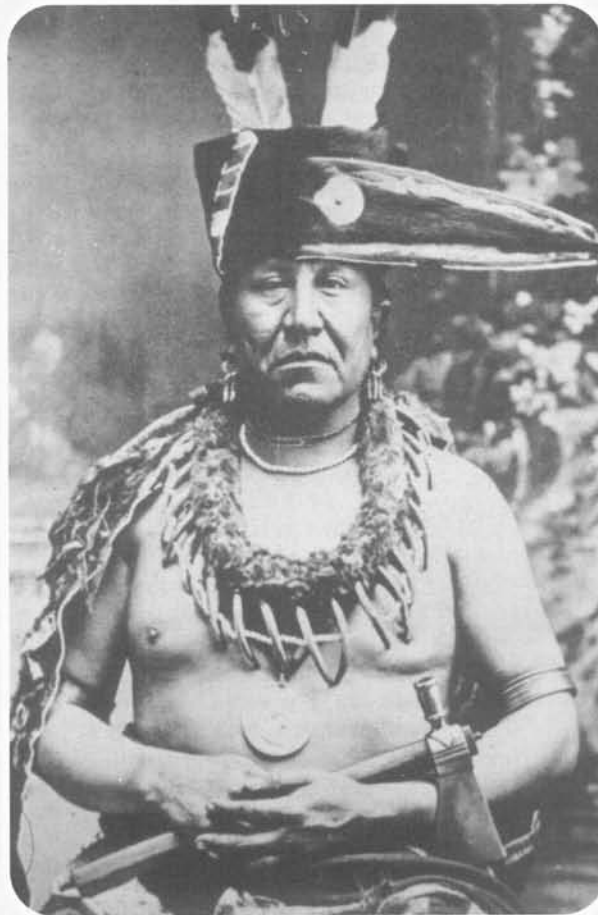
Eagle Chief.

The Pawnee Photo Images Project was aptly named "Kiru Ra' At?" meaning, "Where Has It Gone?" The goal was to survey institutions for photographs relating to Pawnee history and obtain copies of these photographs for reference in the (continued on page 19)