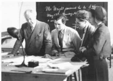
Frank Lloyd Wright on site at the testing of the columns for the Johnson Wax Building, Racine, Wisconsin.

As we approached this seemingly simple project, we did not anticipate the myriad of issues and problems that would demand our attention and whose solutions ultimately have shaped both product and process. In many ways, we were starting at the beginning. Our staff was undergoing significant reorganization that altered responsibilities and workflow. We knew little about these collections. Although we were old hands at creating MARC records, we had not used the MARC record for describing photographs. In a newly merged reference environment, what needed to be done