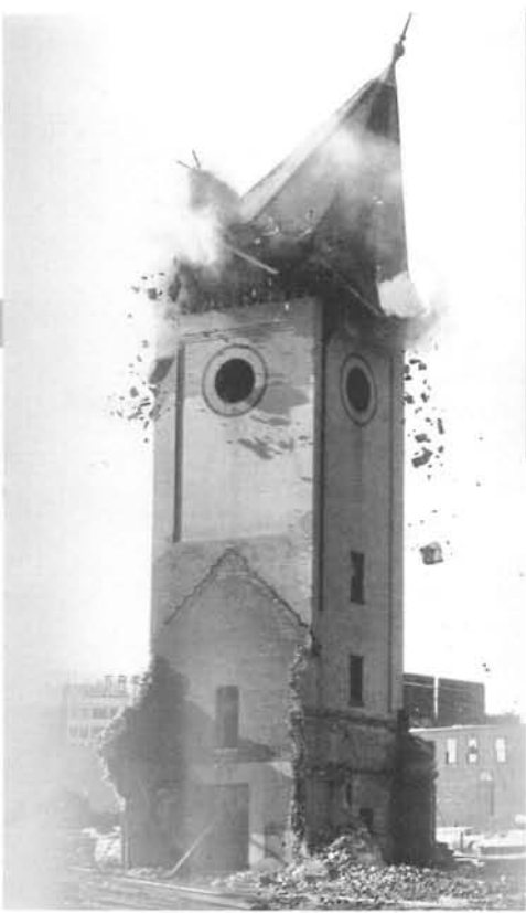
Union Station in Bangor, Maine, makes way for urban renewal, 1961.

THE HANDSOME OLD buildings come down one by one, their foundations erupting into dust as bricks, tin, and wood tumble to the earth. Little time is given to mourning their loss, for city leaders see promise in the rubble—crisp, modern buildings, shopping plazas, parking lots.