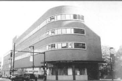
Union Mutual Insurance Company; Congress Street, Portland, ME, ca. 1954-56, by Wadsworth-Boston. A striking early example of modern commercial architecture in Maine.

The Stevens firm designed every type of building from small summer cottages to grand resort hotels, business blocks, churches,