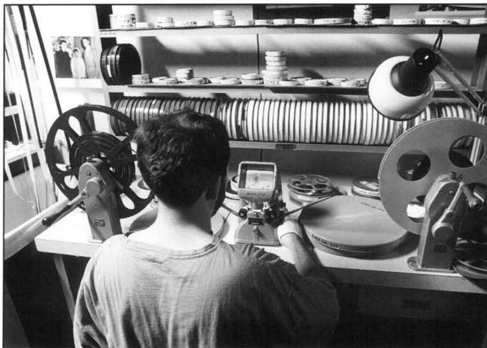
Film technician examines film using manual rewinds, viewing images on a moviescope viewer.

Television news collections provide an invaluable record of our day-to-day activities and serve as primary source materials documenting the events shaping our history and culture. But despite this value, television news is among the most endangered