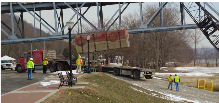
Utilizing a design-build procurement is expected to save the Milton-Madison Bridge $18 million and dramatically accelerate project completion.

DOT will also provide a $546 million TIGER TIFIA loan to complete the $1.7 billion Crenshaw/LAX Light-Rail Transit Corridor project, an integral piece of Los