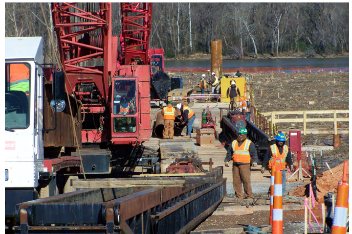
The I-85 Corridor and Yadkin River Crossing project utilizes Design-Build to accelerate project delivery.

Of the 13 TIGER I grants administered by the Federal Transit Administration, five projects are expected to use a design-build approach, as opposed to the more traditional design-bid-build, and three projects are expected to use a construction manager at risk or construction manager/general contractor approach to contracting. Both methods require greater collaboration from construction managers to deliver projects on time and on schedule. DOT expects these contracting approaches to significantly enhance the grantees' ability to control costs and schedules for the TIGER projects.