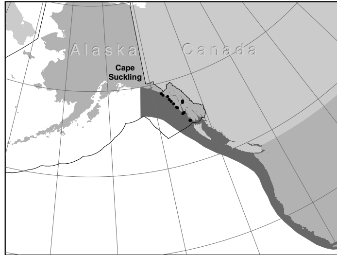
Figure 3. Approximate distribution of Steller sea lions in the eastern U.S. stock (shaded area). Major haulouts and rookeries are also depicted (points). Note: Haulouts and rookeries in British Columbia are not shown.

Loughlin (1997) considered the following information when classifying stock structure based upon the phylogeographic approach of Dizon et al. (1992): 1) Distributional data: geographic distribution continuous, yet a high degree of natal site fidelity and low (<10%) exchange rate of breeding animals between rookeries; 2) Population response data: substantial differences in population dynamics (York et al. 1996); 3) Phenotypic data: unknown; and 4) Genotypic data: substantial differences in mitochondrial DNA (Bickham et al. 1996). Based on this information, two separate stocks of Steller sea lions are now recognized within U. S. waters: an eastern U. S. stock, which includes animals east of Cape Suckling, Alaska (144°W), and a western U. S. stock, which includes animals at and west of Cape Suckling (Loughlin 1997, Fig. 3).