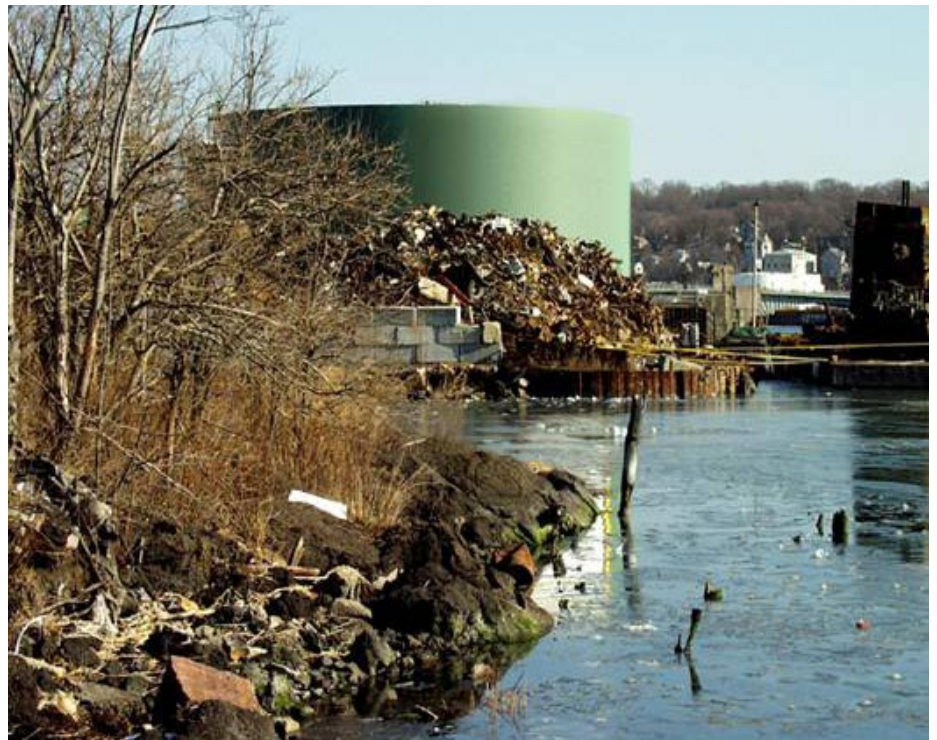
This brownfields/river site was cleaned up and will be redeveloped