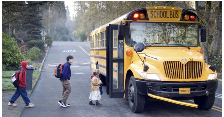
Children's health was used as a focal point for this CARE project

The program has been extremely successful. $435,000 in additional funding has been leveraged from CDC, an EPA vulnerable populations lead grant, and FEMA.