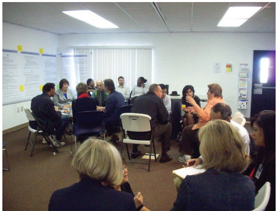
Workgroup members meet to tackle issues and are guided by the partnering agreement