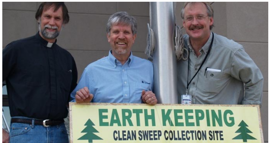
Faith-based collection efforts get big results

Then in 2007, the Earth Keepers Network expanded to include local pharmacists and law enforcement to facilitate the collection of unused pharmaceuticals and prevent improper disposal. Again, using church and temple parking lots, the collection effort collected, properly disposed of or provided for reuse of over one ton of pharmaceuticals. This responded to studies showing that pharmaceuticals are present in water bodies and may cause ecological harm.