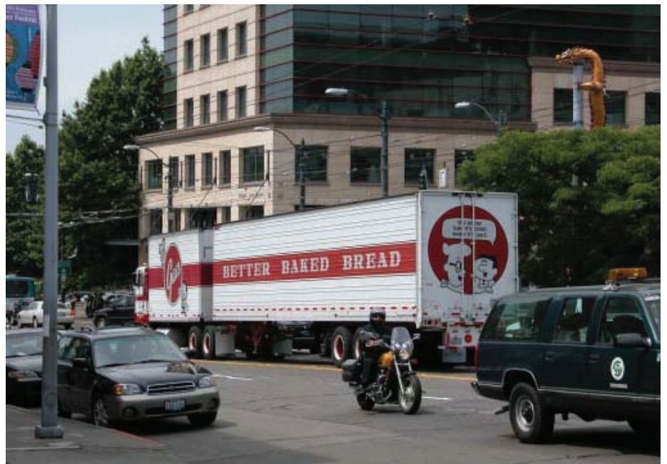
Diesel trucks drive through the international district's downtown

CARE work continues through the Community Advisory Board comprised of elders and the WILD's youth. Youth have become community leaders and a high percentage have sought and been accepted into college and local government internships. Finally, the intergenerational cooperation that took place during the project educated and engaged youth and elders about pressing problems in their community, and promoted a sense of community essential for tackling future environmental issues.