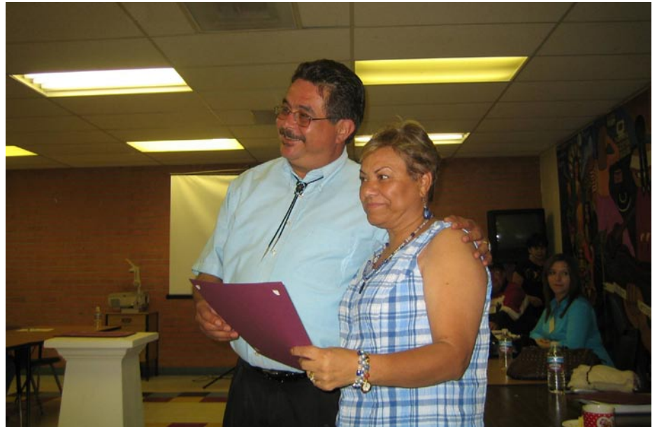
County Supervisor distributing certificates of training completion to promotoras

Finally, the project has developed a broad-based partnership with 23 members from educational institutes, businesses, and local and state agencies. $734,000 in additional funding was leveraged from EPA's Pollution Prevention program, EPA's Indoor Air program, the Department of Housing and Urban Development (HUD) and the City of Tucson.