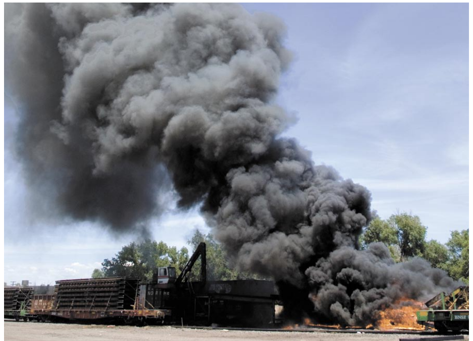
Railroad ties burning in Peppersauce Bottoms before CARE engaged with the community

In 2006, PuebloCARES responded to local flooding issues by providing labor and materials to clean up and rebuild flooded homes. PuebloCARES also used EPA Brownfields funding to assess the contamination of the largest lake in Pueblo and the area surrounding it. The assessment cleared the way for Pueblo to acquire and develop the property as a recreational area that will also help with flood control.