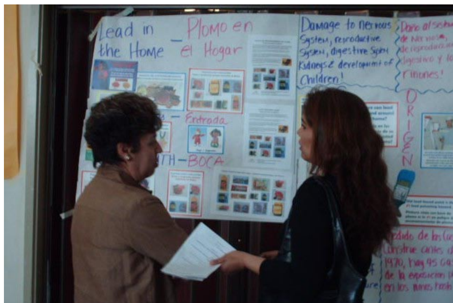
Residents meet at a public forum to share information on local health issues

Once the community was educated about their various environmental concerns, the collaboration convened a meeting where small groups of citizens discussed the pollutants of greatest concern, based on their known risks. Each group was composed of four or five members of the partnership and one EPA or county leader. Then, through facilitated consensus they were able to rank the risks from more risky to less risky.