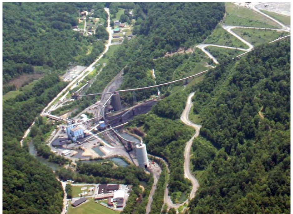
Coal sludge impoundment plant and nearby community, one CARE project focus area

Experts from regional universities shared test results and explained the water problems. Through this process, researchers gained the trust of individuals and citizens began to develop strategies for getting help. More knowledgeable and empowered, many of these same citizens