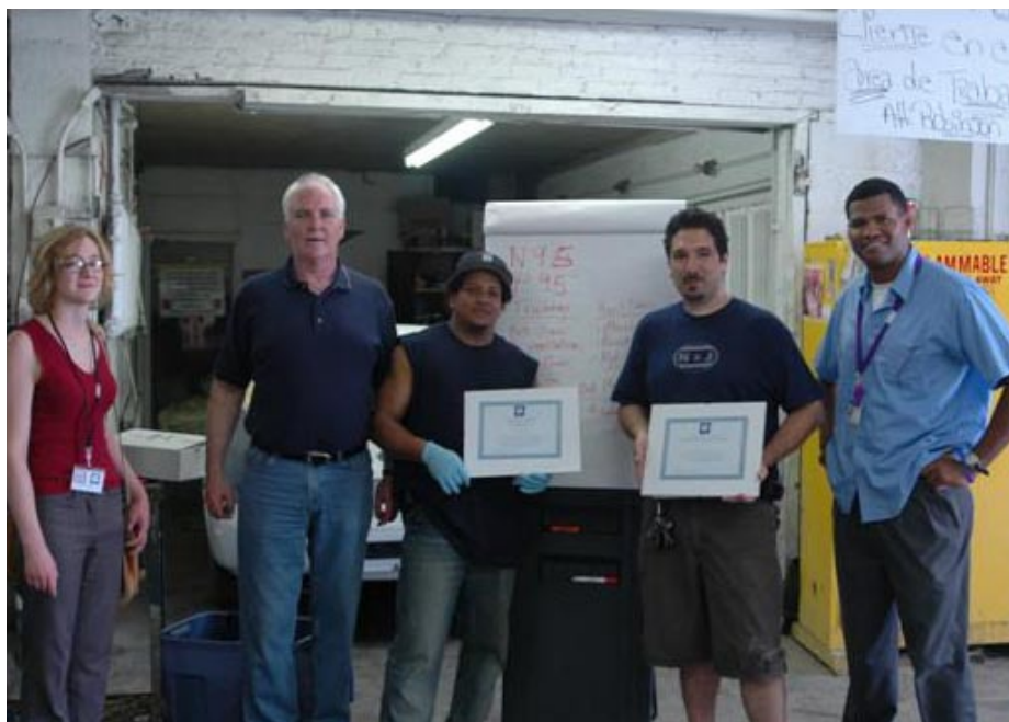
Boston Public Health's Safe Shop Training completed at a local shop