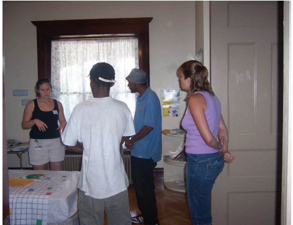
Residents learn how to reduce household environmental health risks

The Neighborhood Educator program was just one of the CARE grantee's six mini-projects. The program also worked in concert with the City of Rochester's Neighbors Building Neighborhoods program to address local environmental concerns.