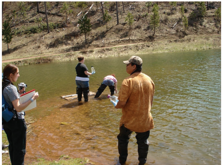
University students sample for water contaminants