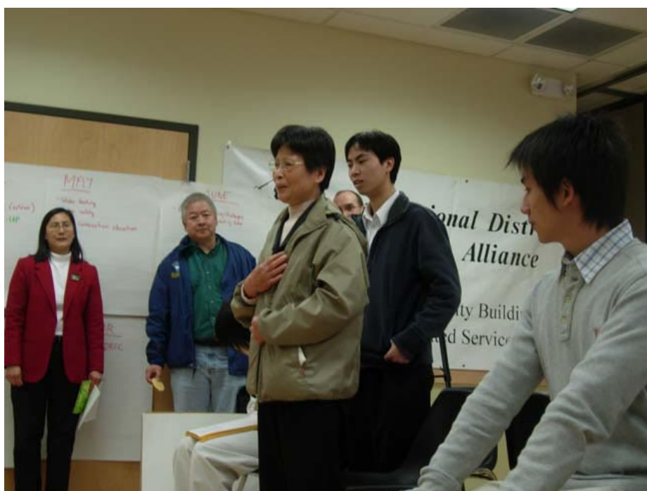
Elders and youth meet to identify local risks

A massive outreach campaign was launched by youth and elders to