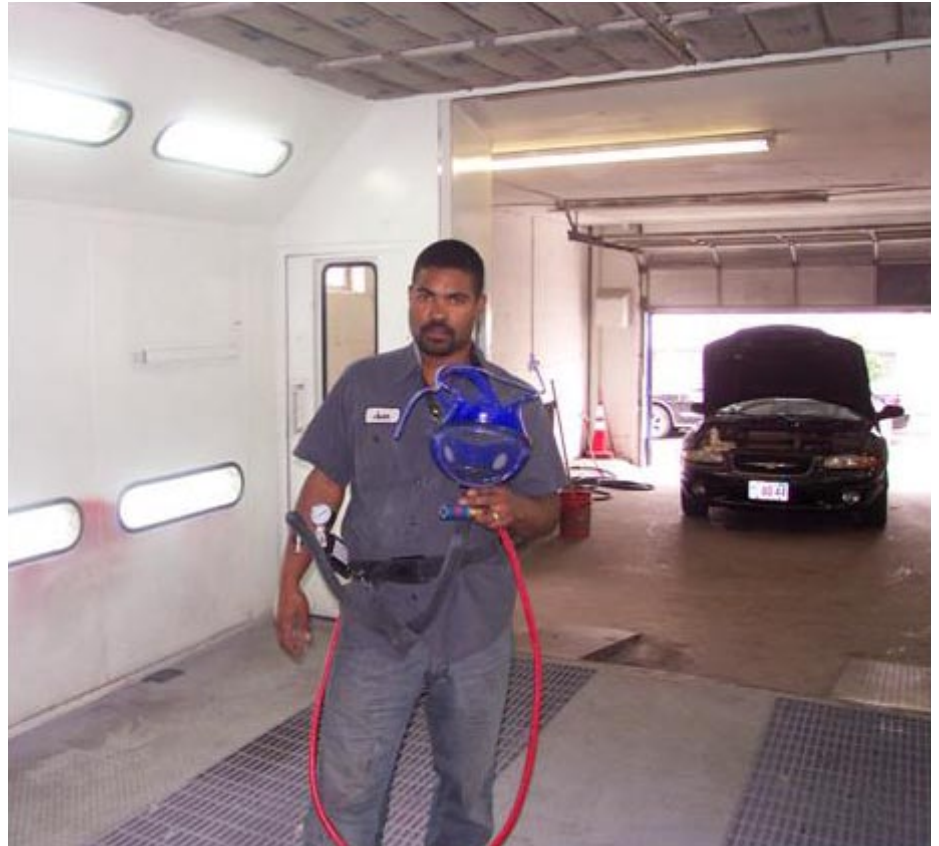
Instruction on Personal Protective Equipment (PPE) was provided to workers

The ability of the project to build trust and gain entry into auto shops and work in a highly collaborative fashion set the foundation for significant change in workplace practices. These practices include switching to aqueous brake cleaner, reducing perchloroethylene-containing aerosols, using hydrophic mop technology, oil and solvent recycling, waterborne coatings to eliminate volatile organic compounds (VOCs) as well as labeling waste containers, oil, anti-freeze, paints and solvents and improving sanitary conditions. Moreover, the project will be sustainable beyond the EPA grant period and replicated in other sectors.