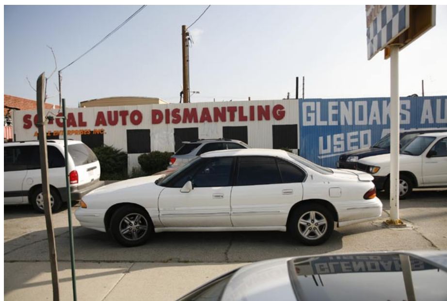
Seventeen auto dismantlers agreed to engage in environmentally sound practices

from local industries and potential next steps. Pacoima Beautiful's staff, health educators from the community and others then shared the results with businesses and obtained agreement on instituting more environmentally-friendly practices. Pacoima is continuing to expand outreach to additional businesses.