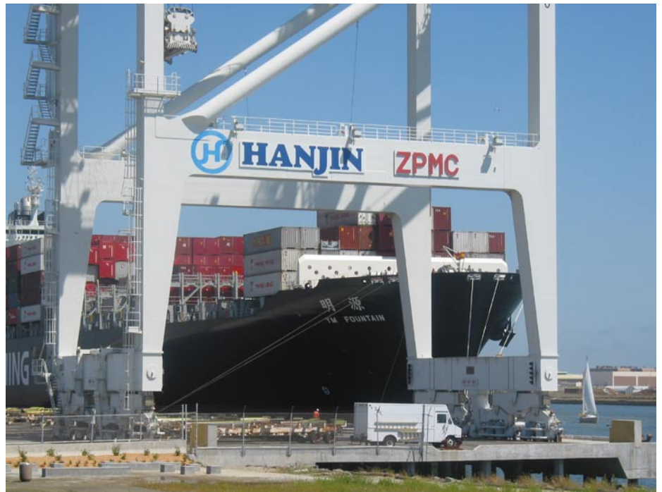
Reducing port-related diesel pollutants is a priority for the CARE collaborative

The success of this collaborative structure has served as a model for other agencies that foster community engagement and multi-stakeholder involvement. Project partners have observed that collaborations often work best when it is generally understood that other less collaborative options, such as lawsuits and political action, remain available “in the wings” if progress is not made during the collaborative process.