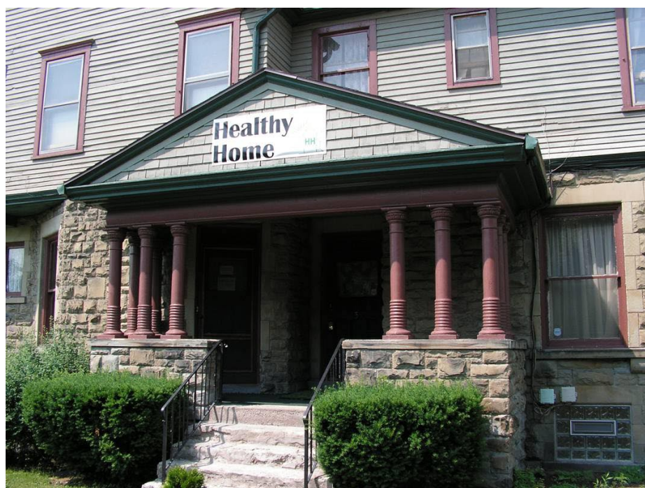
Rochester's Healthy Home Learning Center

Through this mechanism, the educator reached approximately 2,000 residents with environmental health information.