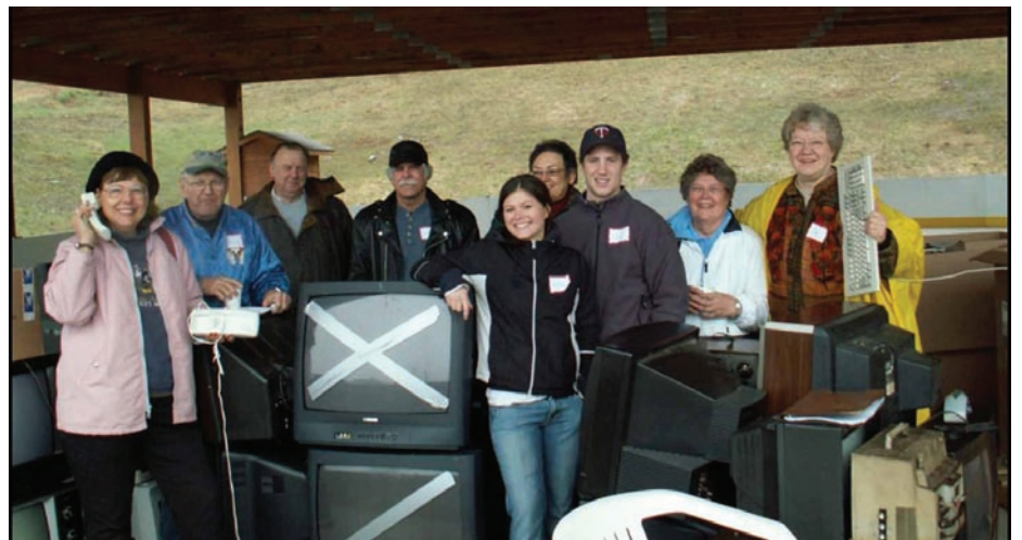
Over 320 tons of e-waste were collected by this CARE project

Success of this program caught the attention of the Michigan Dental Association, which then recommended this as a best management practice for all their member dentists statewide. Subsequently, EPA's Office of