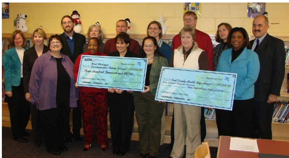
EPA and CDC together invest in children's environmental health