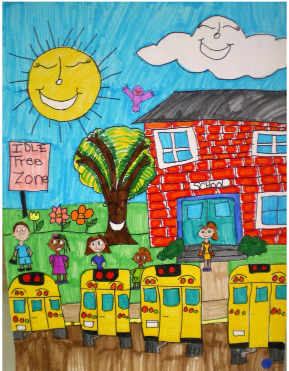
Anti-idling poster contest

Experience gained from the CARE project allowed the grantee to secure an additional $3 million dollars for diesel engine retrofits (including 520 school buses, 91 airport support vehicles, 50 fire department trucks, 33 refuge haulers, 35 commercial trucks, and a tugboat). An additional 929.8 tons of emissions and 98,430 gallons of fuel will be saved annually.