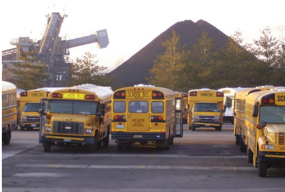
Efforts with local businesses included work with a local coal distributor to move coal piles away from school

To expand upon these successes, Grace Hill worked with local businesses, some of them significant contributors to point-source emissions on pollution prevention strategies. A local coal distributor, located near a school, reduced its fugitive air emissions by 75 percent and agreed to contain the coal piles drifting into the school buses. St. Louis Covidien