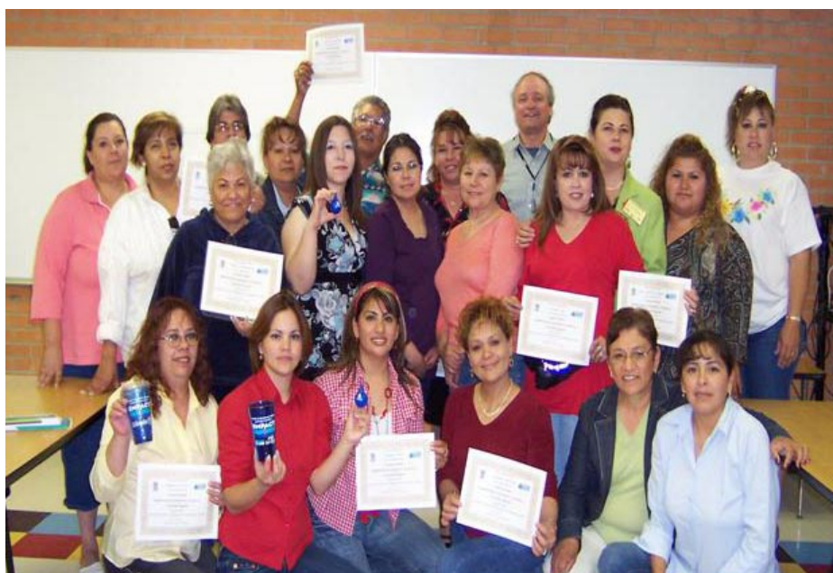
Promotoras after completing their training

These environmental ambassadors visited homes, schools and businesses to provide information and training that resulted in real changes in their neighborhoods. In a period of three years, they visited over 3,500 homes, conducted over 50 outreach events at schools, neighborhood centers and community fairs and distributed relevant outreach materials. They