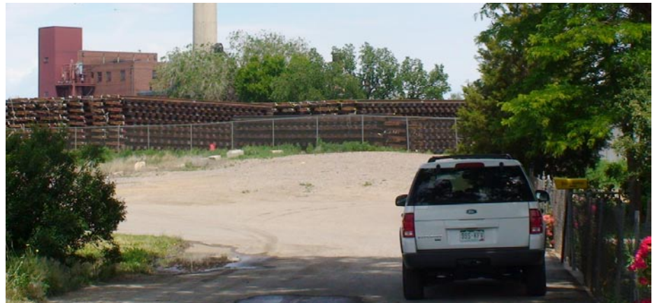
Creosote-treated railroad ties stored in the neighborhood prior to CARE engagement

Each of these efforts brought new partners to the table. In acting on each of these issues, residents began to develop confidence in their ability to cause change. This sense of community contributed to a robust engagement in the process of identifying and ranking the environmental issues of greatest risk and importance for the residents of Pueblo. A bias for action can help neighbors come together to better serve the entire community.