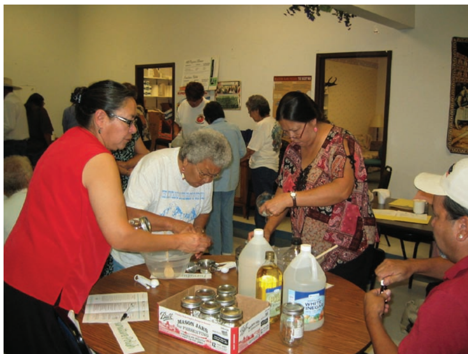
CARE project residents learning about green cleaners

Because CARE focuses on community-based identification of environmental priorities to facilitate change, many organizations came together through MICCP because they shared a common interest in improving the health of their community and the environment.