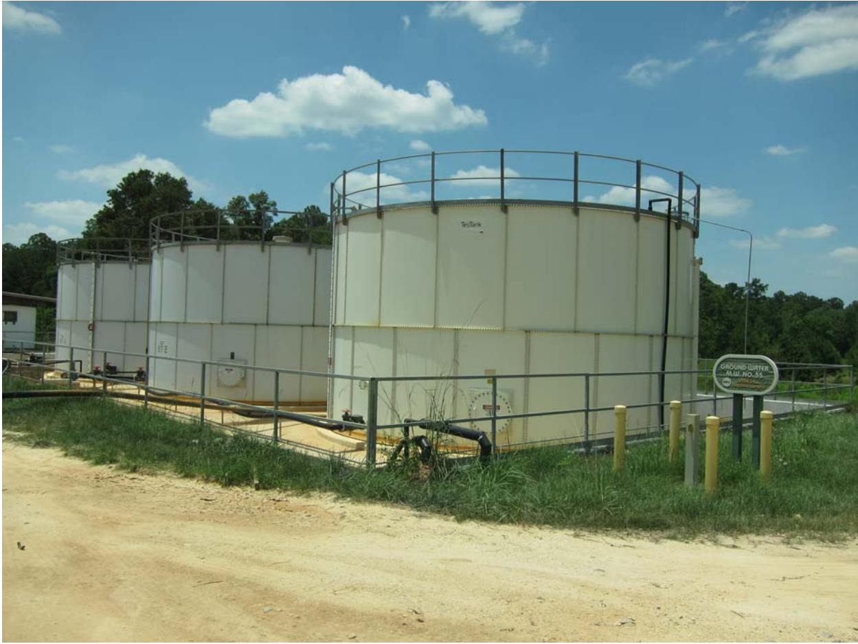
Leachate collection tanks at the Springhill Landfill