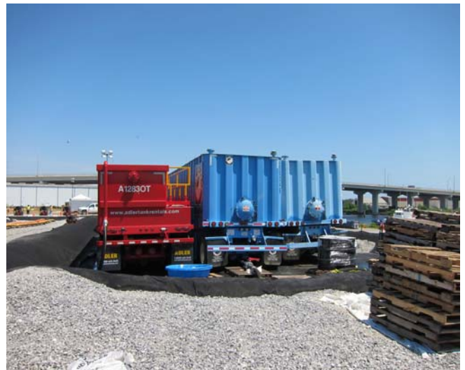
Bayou Chico Decontamination Area Wastewater Treatment System