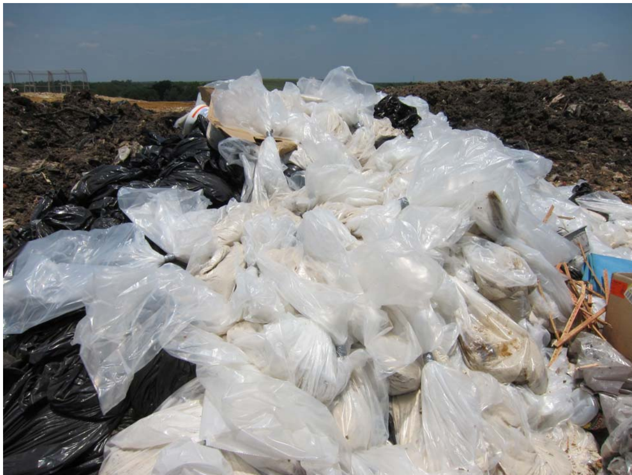
BP wastes (non-contaminated trash and debris and crude contaminated debris) on the Springhill Landfill