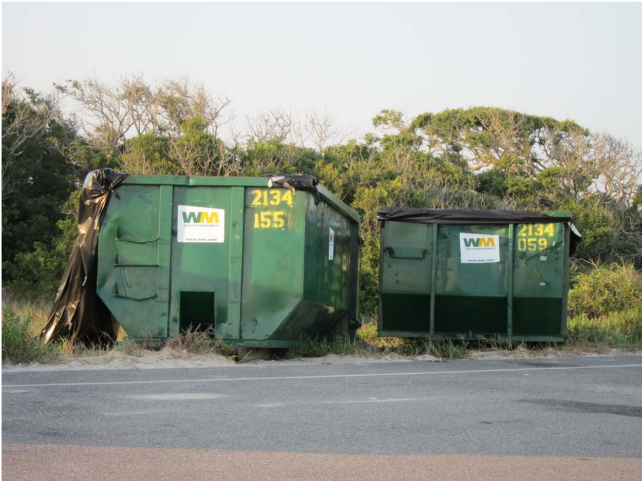
Two roll-off containers of crude contaminated debris. Both containers were not covered and one container did not have liner.

On June 12, 2010, EPA Waste Monitoring Group Supervisor visited several collection points located along beach of the City of Gulf Shore, Alabama. The EPA Waste Monitoring Group Supervisor observed that most of the crude contaminated debris roll-off containers were not lined and not covered. The Waste Monitoring Group Supervisor instructed the Site Manager to use liners for the crude contaminated roll-off containers and keep the containers close. In addition, EPA OSC visited debris collection point located at the Perdido Beach in Alabama. The EPA OSC observed crude contaminated debris roll-off containers were not lined, not covered, and crude contaminated debris was on the ground. The Waste Monitoring Group Supervisor discussed the collection area concerns with the EPA IC and forwarded the collection areas concerns to BP. Private security guard is providing 24 hour security at this location.