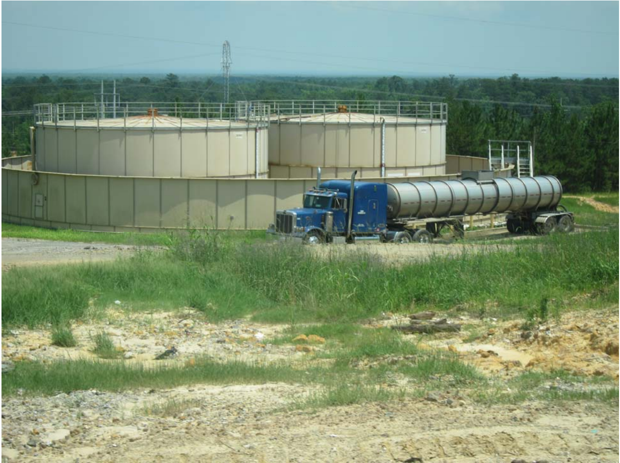
Chastang Landfill leachate collection storage tanks