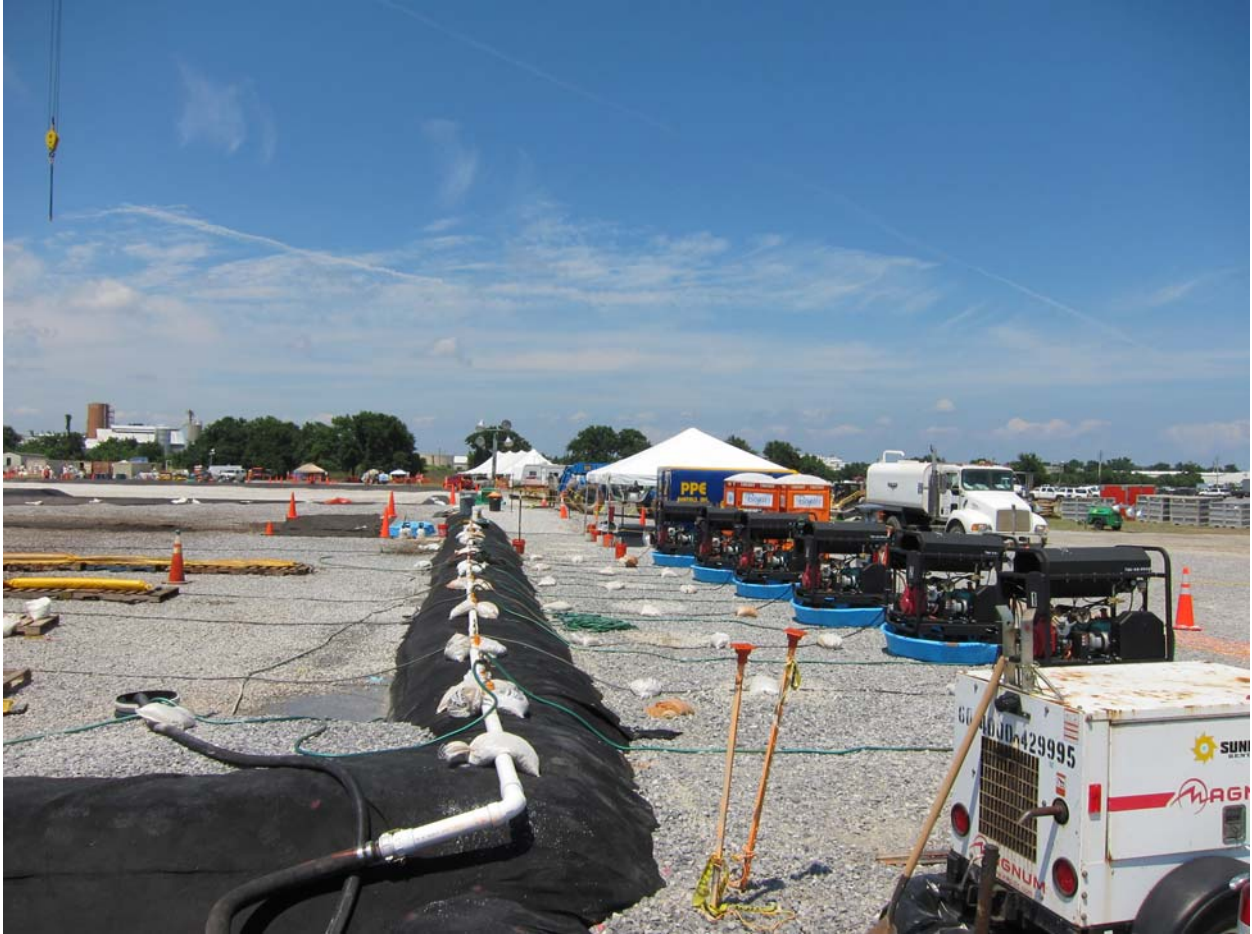
Decontamination Area and Pressure Washers