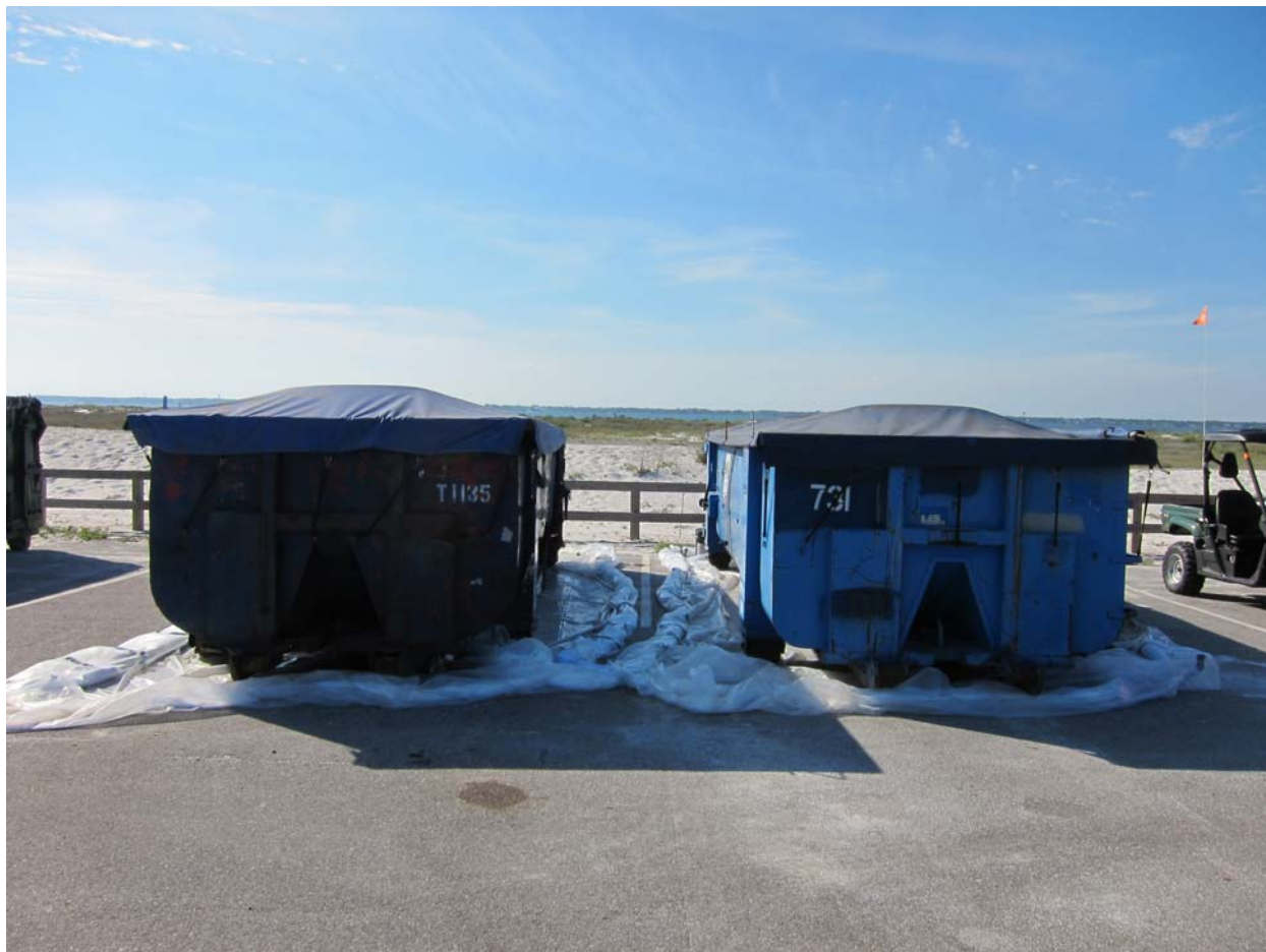
Two roll-off containers with crude contaminated debris

container leaves the staging area. All wastes from this collection point are destined for disposal at the Springhill Regional Landfill in Campbellton, Florida.