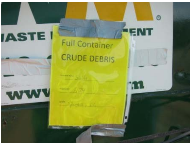
Roll-off container label