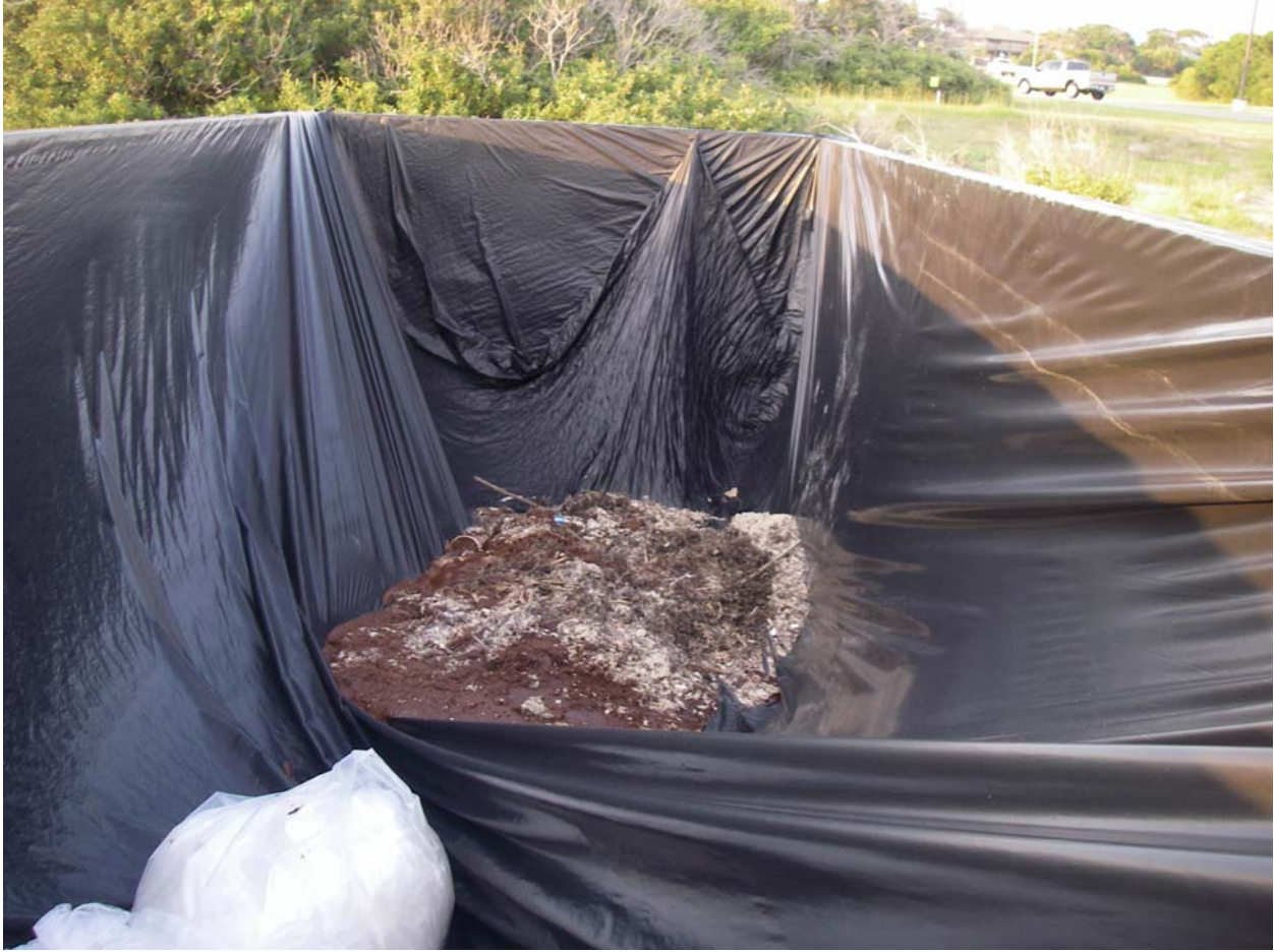
A roll-off container with crude contaminated debris – not covered.