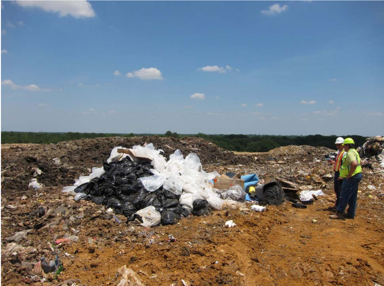
BP wastes (non-contaminated trash and debris and crude contaminated debris) on the Springhill Landfill

The site is fenced and has security to prevent illegal dumping and the site is monitored during daily operations by personal positioned at the entry to the facility. Visual observation of the landfill revealed no unusual findings, practices or activities. Waste Monitoring Group Supervisor reviewed the BP manifests. A records review indicated that wastes were coming from Foley Staging Site located in Alabama and Pensacola Staging Site located in Florida. The manifests were in order, dated and signed.