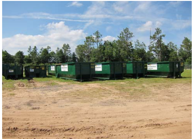
Empty Roll-off Containers at the Staging Area