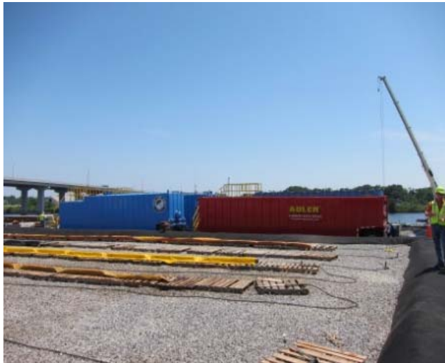
Bayou Chico Decontamination Pad

A water management system is in place to accommodate a 100 year rain event. The wastewater treatment system is consisted of an oil/water separator, a dual chambered clay treatment cell, and a particulate bag filter. The treated water is re-circulated for washing/decontamination process. The stormwater from the decontamination pads is connected to the wastewater treatment system. The excess water will be going to an off site facility for further treatment. Waste Monitoring Group Supervisor did not observe any contaminated materials out side the pads. According to FDEP, the decontamination sites and staging areas are inspected once a week.