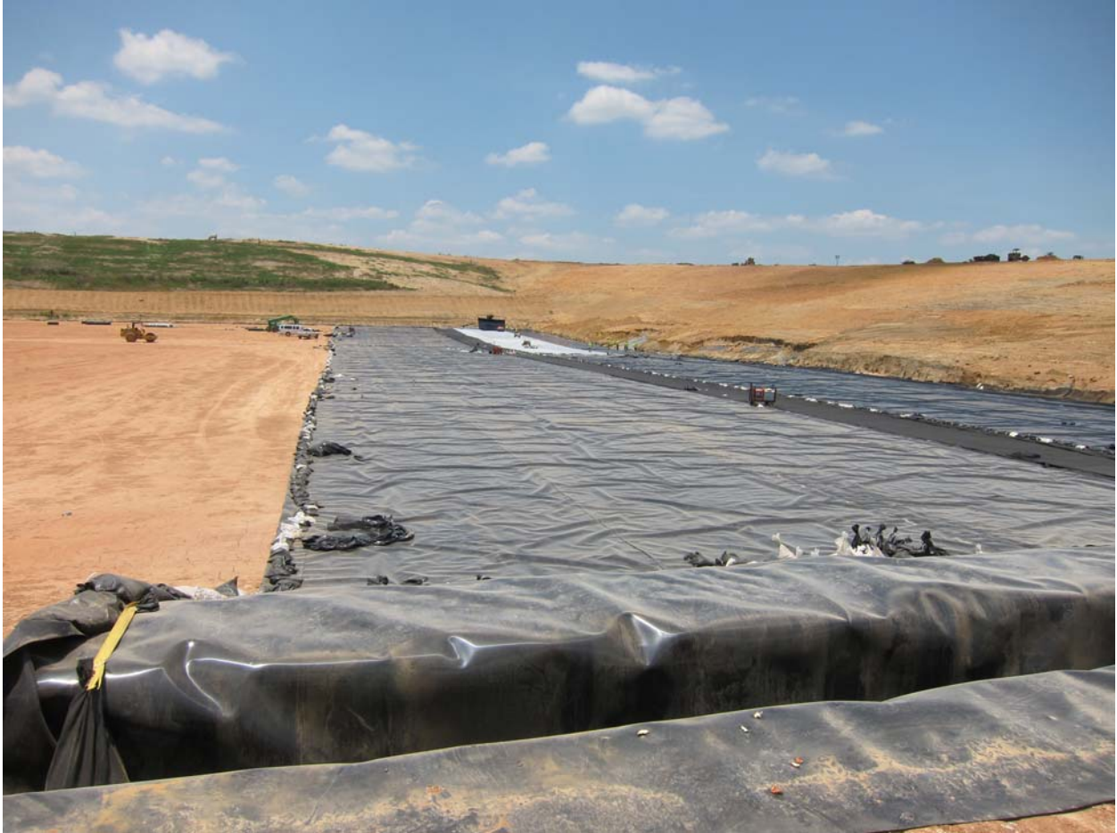
Liners being installed at the Springhill Landfill