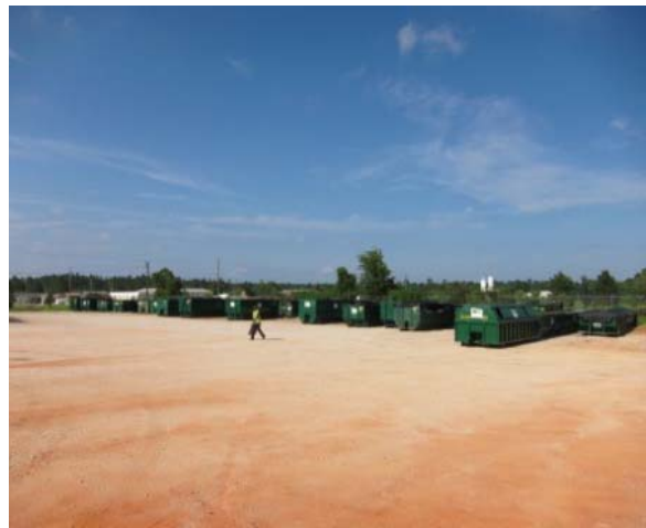
Empty roll-off containers at the Foley Staging Site