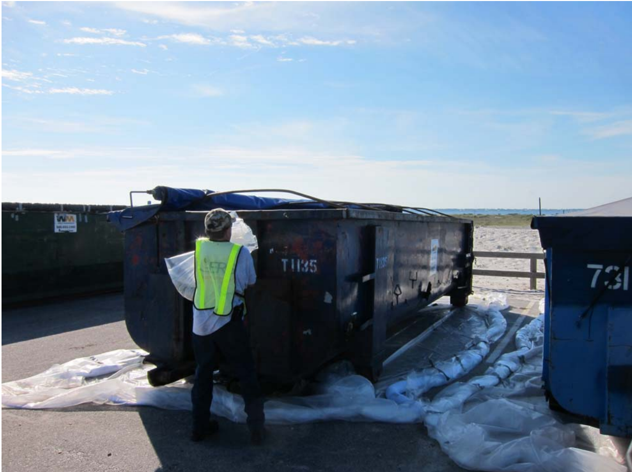
A bag of crude contaminated debris is being thrown into the roll-off container