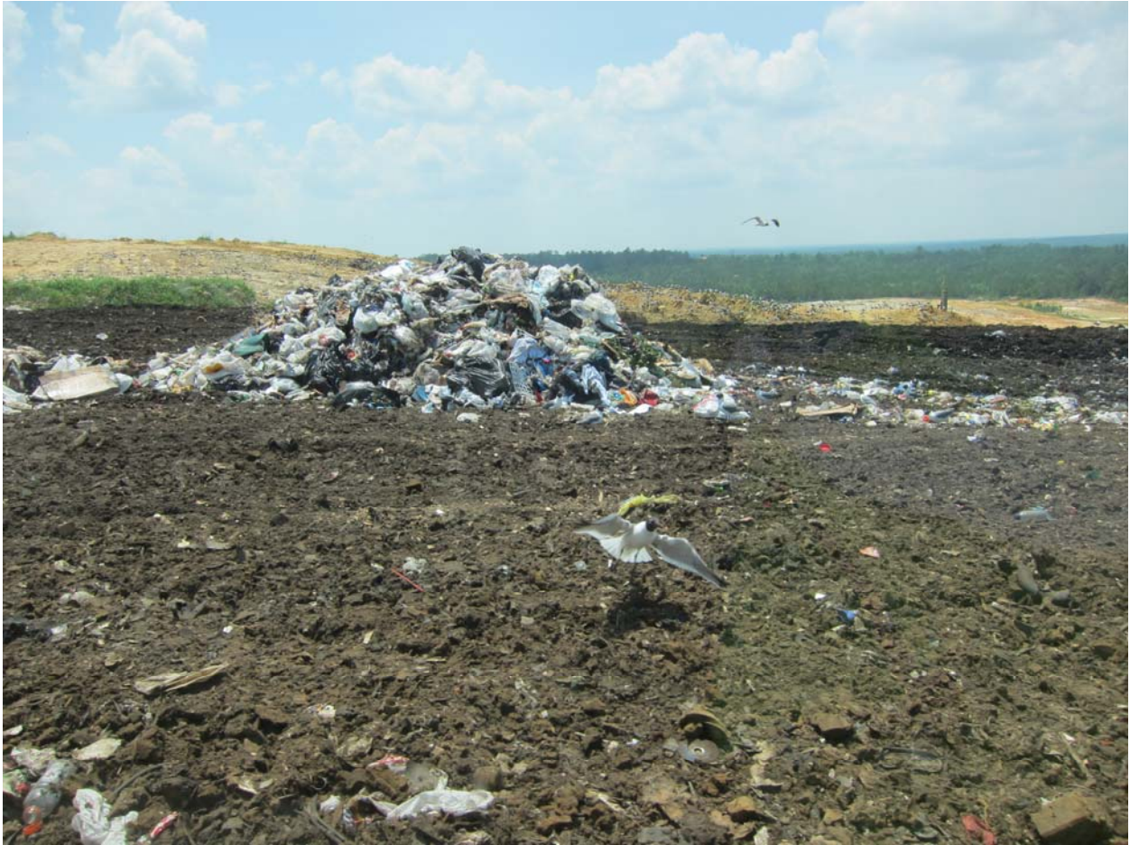
Municipal solid waste at the Chastang Landfill, Mt. Vernon, Alabama