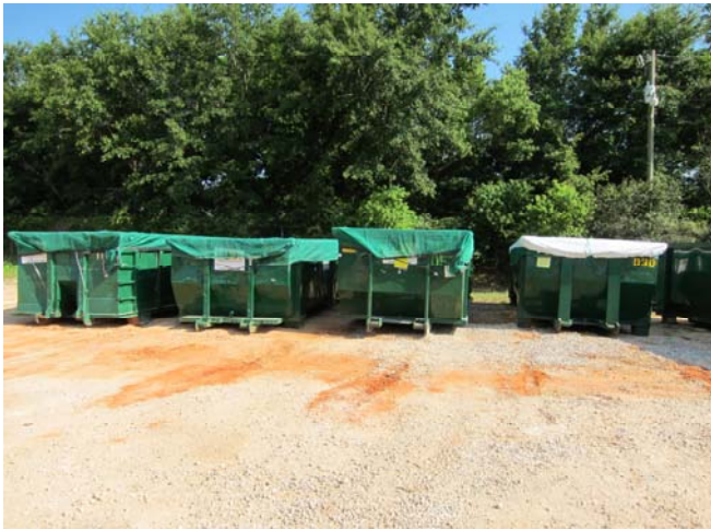
Four staged roll-off containers at Foley Staging Site

On June 9, 2010, EPA Waste Monitoring Group Supervisor visited the Foley Staging area located in Foley, Alabama. The Foley staging area is located on the Waste Management's Foley Operation/Collection facility. Primarily, the facility is used for truck storage, maintenance shop and truck washing. The site is secured and operated by Waste Management. According to the facility representative, wastes (non-contaminated trash and debris and crude contaminated debris) from the Foley Staging site are going to the Pecan Grove landfill in Mississippi and to the Springhill landfill in Campbellton, Florida. There were four roll-offs containers stored during the site visit. All containers with wastes were lined, covered and labeled. EPA Waste Monitoring Group Supervisor observed fifty empty roll-off containers during the site visit. These containers were prepared for the waste collection sites.