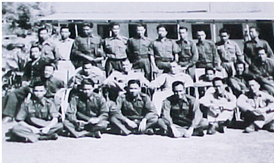
This photo of a group of Free Thai members and US officers was one of many shown in a CIA Museum exhibit in 2000 entitled “Historic Photographs and Memorabilia of Thailand’s OSS Heroes. The photos and many of the artifacts have been transferred to the Thai government.

When former Free Thai were asked how they managed to get away with as much as they did in dealing with the Japanese