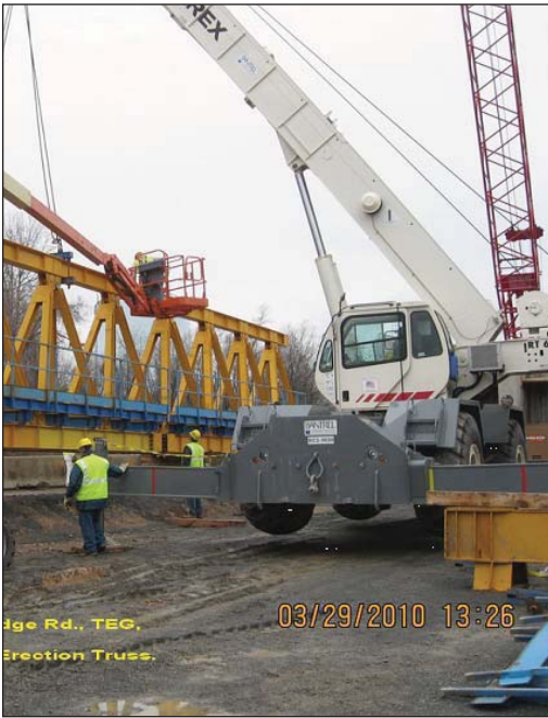
Dulles Corridor Metrorail Project construction, Northern Virginia

project the BAB subsidies at $3 billion per year versus previous estimates of about $1 billion a year.