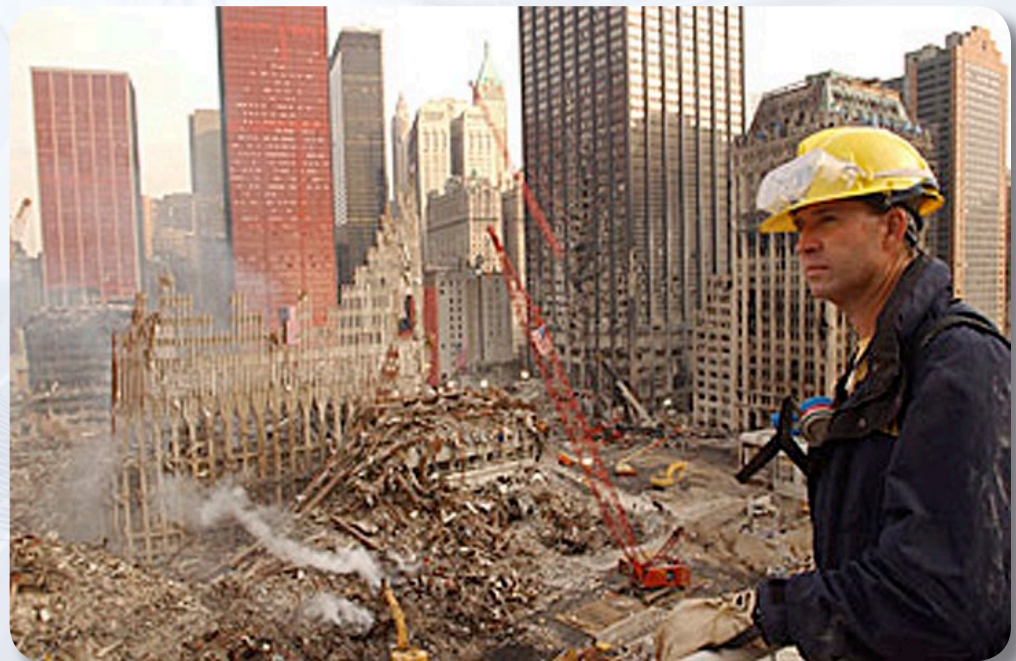
Example of the photos that may be viewed on the new NIST Disaster and Failure Events Data Repository shows a worker from the Federal Emergency Management Agency (FEMA) at New York City's World Trade Center complex a few days after the Sept. 11, 2001, terrorist attacks.

The Disaster and Failure Events Data Repository is accessible at http://wtcdata.nist.gov .