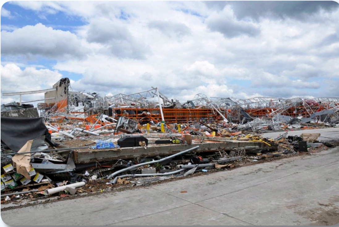
The remains of what was once a home improvement store in Joplin, Mo., showing the destructive power of the tornado that struck the area in May 2011.