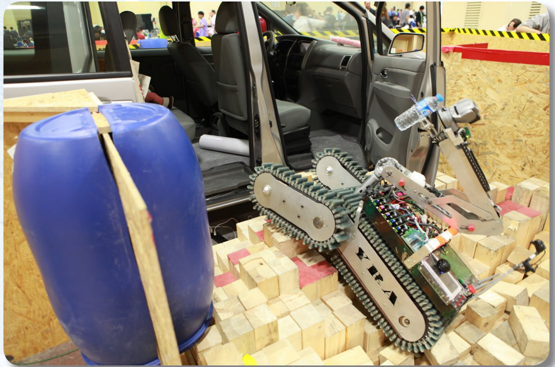
In this scenario a robot searches a compromised/collapsed structure prior to responder entry.

The competition arena included test courses to conduct standard, draft standard, and prototype tests. The extensive robot performance data collected over more than 120 trials during the week-long event will help NIST efforts to develop and validate new standard test methods. Robots involved in the competition typically deploy the most advanced