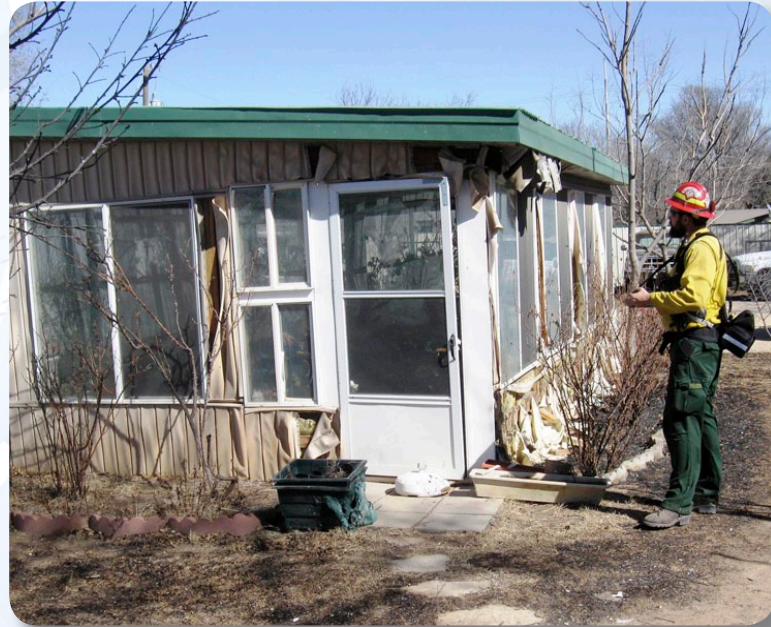
A member of a joint NIST-Texas Forest Service study team collects data on an Amarillo, Texas, building damaged by wildfires in February 2011.

Fortunately, Maranghides had trained TFS field investigators last fall on the use of the NIST data collection methodology, so they were in the field employing the two-tiered system within 48 hours of the start of the Amarillo fires. The first tier—a survey for recording broad observations of damage across the entire fire perimeter—provides input for the second tier. The latter includes a kit with tools designed to capture the specific details needed for developing a precise fire timeline, building computer models to study a fire’s behavior in depth, and most importantly, identifying and assessing all of the factors that determine the