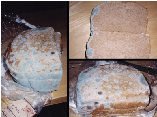
Figure 2. Moldy bread.

Mold grows in many sizes, textures, and colors such as white, black, green, blue and orange. Spores are released by mature mold that varies in color, or may not be colorful at all. Each mold growth can be different.