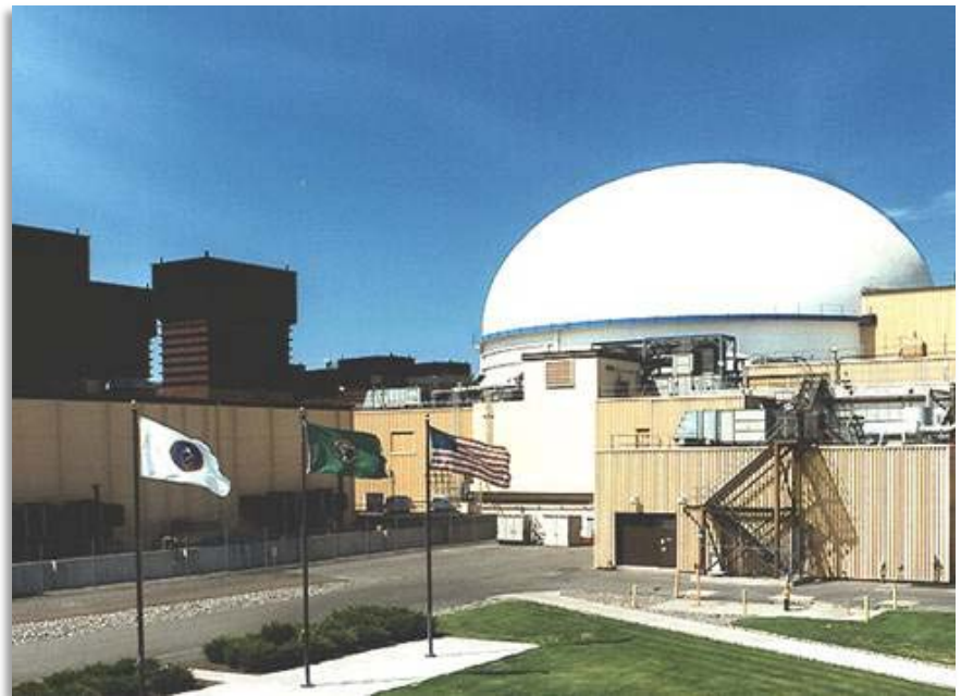
Fast Flux Test Facility