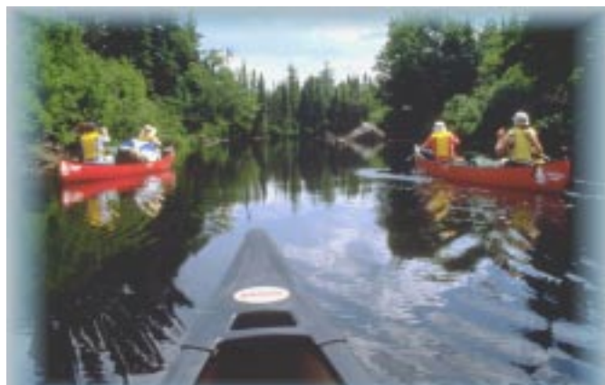
Moose River with Wilderness Inquiry.

Many business owners want hard and fast rules on how to implement the ADA, and they are frustrated when they get the answer “it depends.” However, with laws as broad ranging as the ADA, it takes time for standards to evolve, especially when those standards involve broad concepts such as programs and services. The ultimate legal impact of the ADA will be determined as cases come to trial and are ruled on by the court system