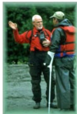
Beach stop on Sun Dog Expeditions' 7-day Copper River Float Trip ( Photo by Sun Dog Expeditions ).

However, facility accessibility is an important issue. Access to facilities is required under the ADA if the facility has to be entered in order to participate in the program being offered. In order to ensure appropriate facility accessibility U.S. Department