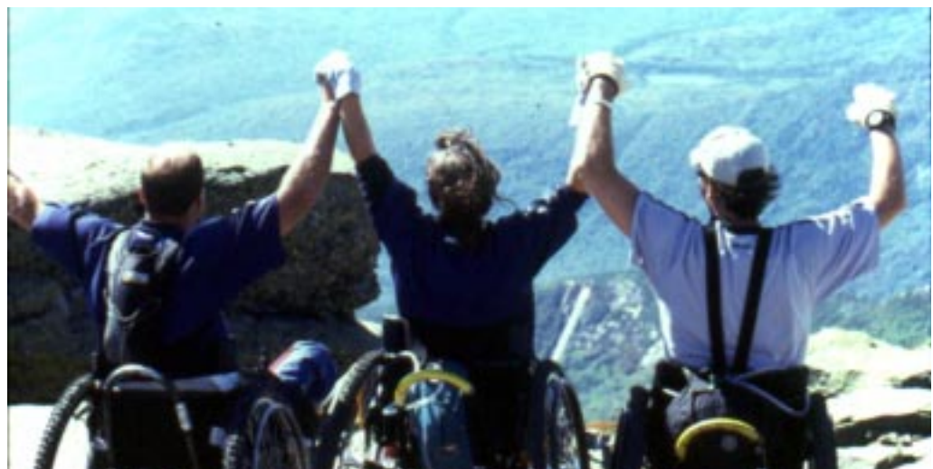
Reaching the summit of Mt. Lafayette with Northeast Passage.

If provided, transportation must be accessible as outlined in Title III of the ADA. Information about public transportation for people with disabilities can be obtained from the Federal Transit Administration on their Web site at http://www.fta.dot.gov or by calling 888-446-4511 (Voice) or 800-877-8339 (TTY).