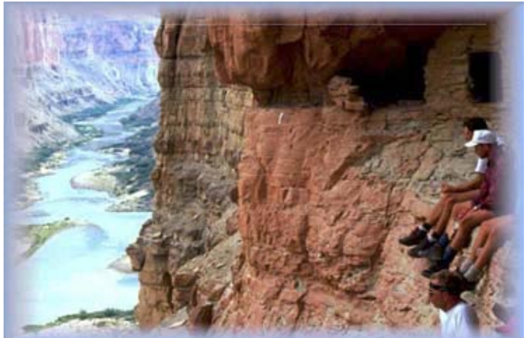
Wilderness Inquiry in Grand Canyon.

Section 504 of the Rehabilitation Act (Section 504) states: “No otherwise qualified individual with a disability in the United States shall, solely by reason of his disability, be excluded from participation in, be denied the benefits of, or be subjected to discrimination under any program or activity receiving Federal financial assistance or under any program or activity conducted by any Executive Agency” (29 U.S. Code 794).