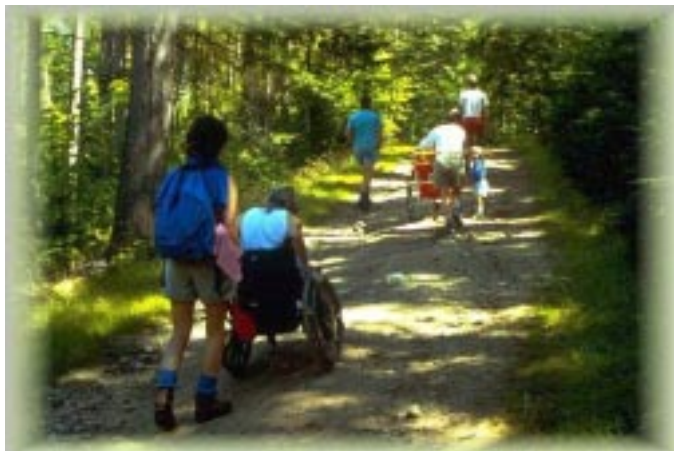
Hikers enjoy a trail on the White Mt. National Forest (Photo by USDA Forest Service).

A competency exam cannot be required for a person with a disability, unless all participants in your program are required to take the same competency exam. There are programs, such as advanced rock climbing, hunting, etc., where skills are tested before entering. This is acceptable if all participants are tested.