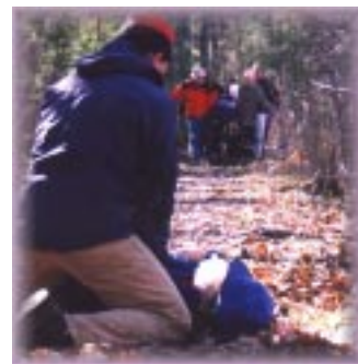
Wilderness Medical Associates volunteer demonstrates litter CPR.

Some outfitters/guides use medical release forms in lieu of any medical evaluation process before embarking on a trip or activity. In many cases, these forms do not collect enough information. Obtaining useful information about a person's medical conditions and special needs, frequently referred to as medical screening, goes hand-in-hand with defining nondiscriminatory essential eligibility criteria and keeping an eye toward safety. This is not intended as an exclusionary process. Rather, it helps staff prepare for any potential special needs and gives them a heads-up about individuals who have medical