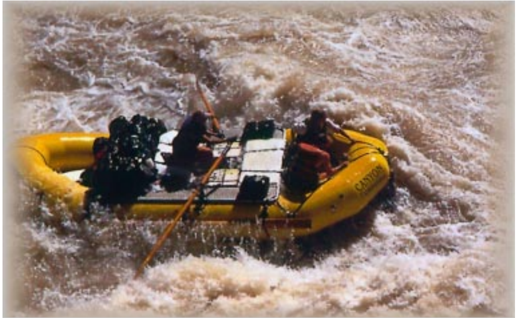
Raft trip with Wilderness Inquiry in Grand Canyon.