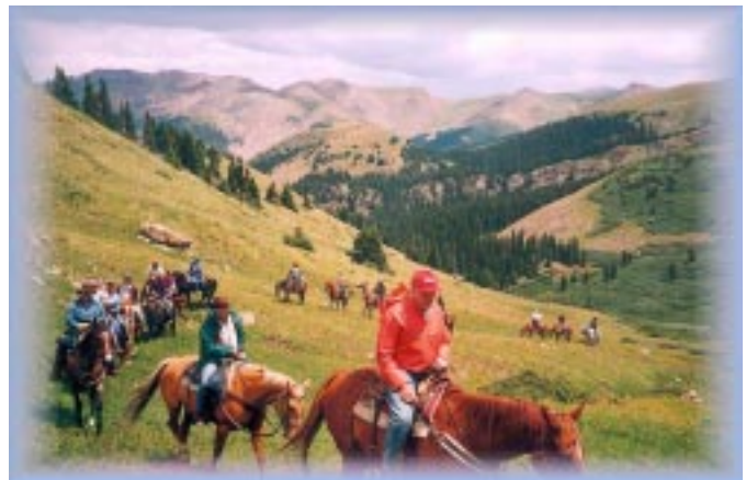
Pack trip with Wilderness Inquiry.