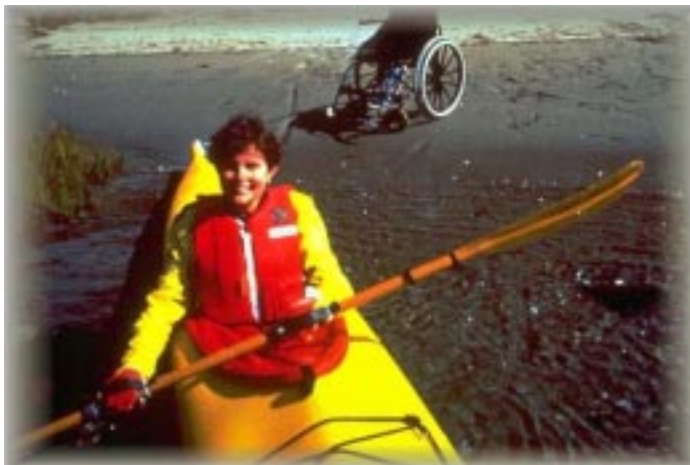
Sea Kayaking means freedom from the wheel chair (Photo by USDA Forest Service).

The simplified nature of the functional approach does have significant limitations. Because it is generalized, the functional approach does not always capture circumstances that may be specific to a particular condition. Therefore, become more familiar with specific disabling conditions that could have a significant impact on the safety and quality of the service you are providing.