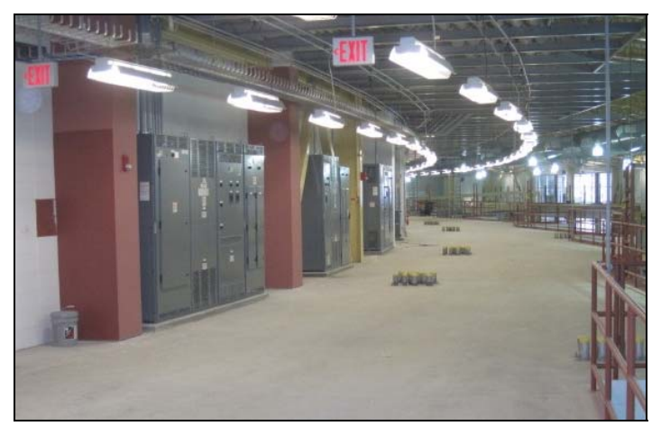
Figure 4: Signage installed, final paint touch-up on the pentant 1 mezzanine.

Building systems in pentant 1 are being commissioned and going through startup under the oversight of the commissioning contractor, with the participation of operations and maintenance staff. Electrical systems are energized and the HVAC and process cooling water systems in pentant 1 are being placed in operation to enable overall system testing and calibration. Life safety systems such as fire protection and detection and building egress lighting are all being readied for final acceptance. Final architectural details and building signage needed for life–safety egress are in place and being readied for final verification prior to building occupancy.