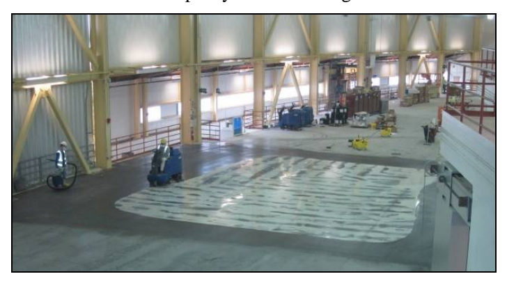
Figure 3: Pentant 1 floor being prepped for the application of floor sealer.

Challenging winter weather continued through February, with temperatures well below average and substantial precipitation. Construction of conventional facilities continued to make excellent progress despite the conditions, but at a slower pace than planned for the period. A review of pentant 1 readiness for beneficial occupancy was conducted in February. The action items identified and attendant startup and commissioning of systems in pentant 1 are nearly complete and should enable beneficial occupancy of the building in mid March.