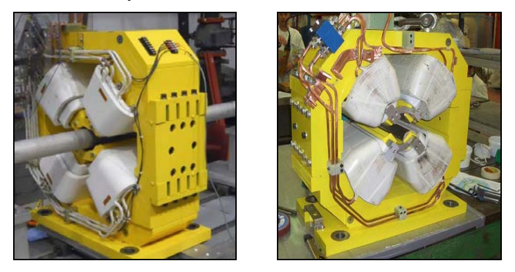
Figure 1: First article quadrupole magnets from BINP (left) and Tesla (right).

Magnets. The magnet group was busy in February with acceptance measurements for the 28 Danfysik production magnets that were received in the two preceding months. Acceptance measurements performed on magnets delivered by Budker Institute of Nuclear Physics (BINP) and Tesla showed acceptable to excellent quality. As a consequence, BINP was given the go-ahead to produce two types of quadrupoles, and Tesla and IHEP were approved for the production lamination and magnet yokes. Meanwhile, BINP has already produced the laminations and the yokes for more than 25 magnets. Magnet production was 12% complete at the end of February.