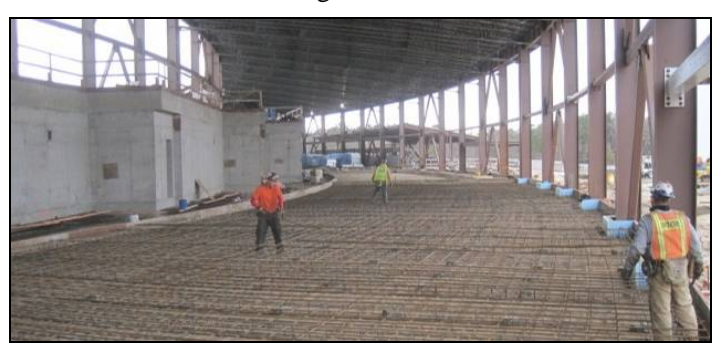
Figure 5: Preparations in pentant 5 for pouring the experimental floor.

The concrete storage ring tunnel is now complete around the entire ring, as the last section of tunnel roof was placed in February. The injection service building floors were also placed in February, enabling the start of injection building enclosure and equipment installation. Remaining concrete work is limited to a section of the experimental floor and access corridor slabs in pentant 5 (Fig. 5) and a section of floor slab in service building 5.