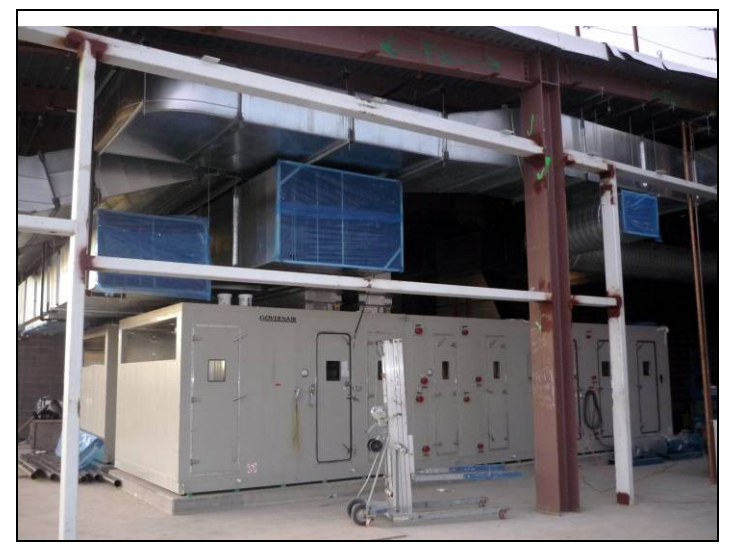
Fig. 6: HVAC equipment in the service building.

compressor buildings and cooling tower buildings have also seen significant progress in the installation of MEP systems.