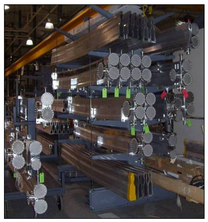
Fig. 1: About 12% of the storage ring vacuum chambers have been completed and a much larger fraction is in various stages of production.

The design and procurement of a few remaining components are moving closer to the final phase. To improve dimensional tolerances during machining and welding, the S4A stainless chambers have been redesigned to use aluminum extrusions. Design of the RF-shielded bellows was completed, and final models of photon absorbers have been generated for vendor quotes. The procurement package for RF-shielded gate valves is nearly ready for its release. The detailed layout of the linac-to-booster transport line vacuum system was completed and component counts have been generated.