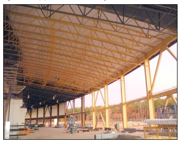
Fig. 7: Exposed steel and decking being painted in pentant 3.

The Chilled Water Plant Expansion is entering system test and start-up ahead of schedule, and will likely be ready to deliver chilled water several months earlier than required. The chilled water piping is installed and tested and ready to bring chilled water to the NSLS-II site when needed. Site restoration in the areas affected by the pipe installation is underway. The electrical substation will enable permanent power to be available to the site in late November.