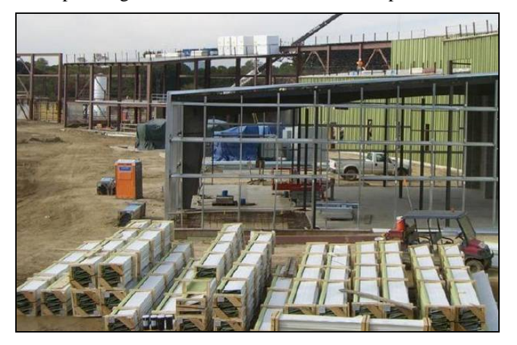
Fig. 5: Compressor building framing, staging for building wall panels, and RF building exterior skin (green) in the background.

Installation of the building envelope (cover photo and Fig. 5) is gaining momentum and importance as colder weather approaches and interior building systems need to be installed. Installation teams are fully mobilized. The pentant 1 envelope is complete and work in other pentants is progressing rapidly. The roof for pentant 1 is complete except for interface work in the lobby area. The roof decking work is advancing to the final sections of exposed roof rafters, recently installed in pentant 5, and all decking will be in place by December. Waterproofing of the booster tunnel is now complete.