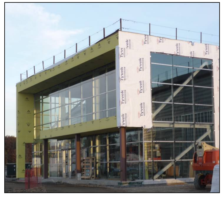
Fig. 8: The lobby becomes recognizable as the curtainwall glass is installed.