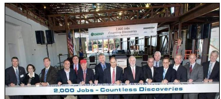
Fig. 3: DOE officials, politicians, and BSA and BNL leaders first sign the final structural steel beam, soon followed by several hundred construction workers and project staff members present at this historic moment on Oct. 13.

Construction continued to make excellent progress in October as the project celebrated the completion of structural steel and closing of the ring (Fig. 3). The onsite work force will soon be expanding, as the LOB contractor completes mobilization and begins construction concurrent with the ring building. Ring building activities are focused on achieving beneficial occupancy of the first building section in early 2011.