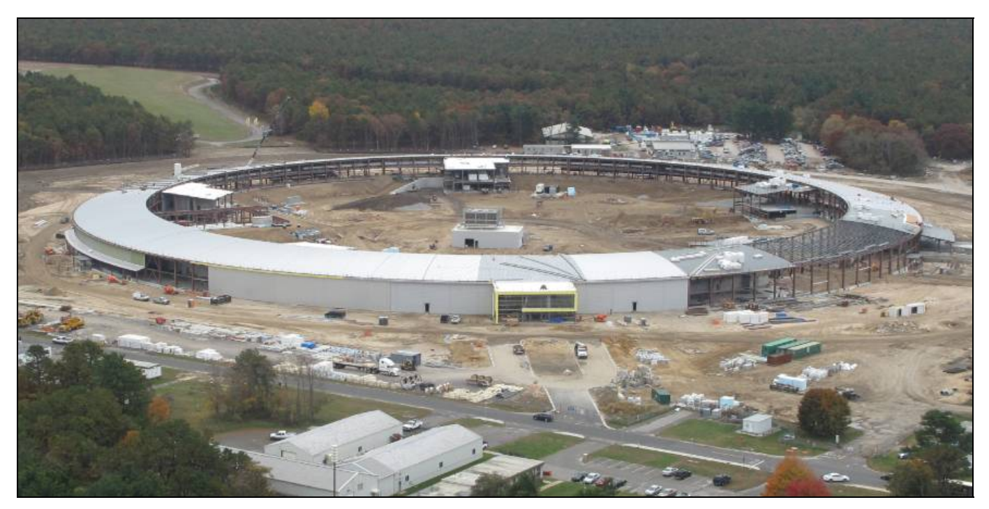
At the end of October, the ring building circle has been completed with the final structural steel in place. Roofing follows close behind.