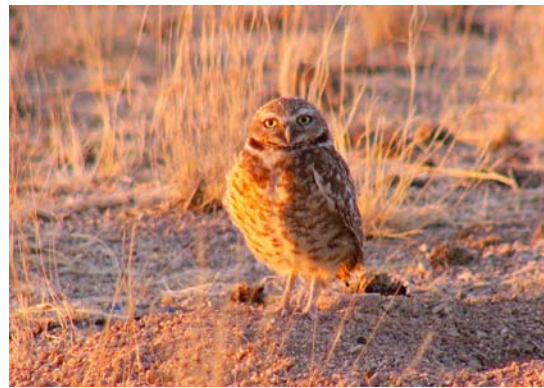
Adult Burrowing Owl on its breeding grounds at Kirtland Air Force Base, NM.

DoD manages nearly 30 million acres of land, water, and air resources across hundreds of installations; the Army Corps of Engineers manages an additional 12 million acres. These lands represent a critical network of habitats for birds, offering migratory stopover sites for resting and feeding, as well as suitable sites for nesting and rearing their young. The many installations that provide these important habitats form DoD's Steppingstones of Migration . DoD PIF is committed to ensuring that these areas, along with the species that depend on them, are protected and sustained for future generations.